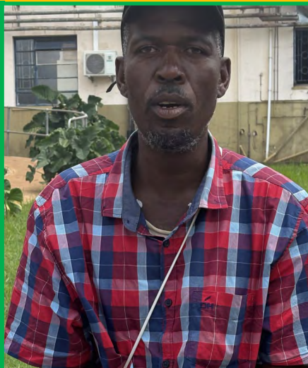
COMMUNITY MEMBER JOINED US