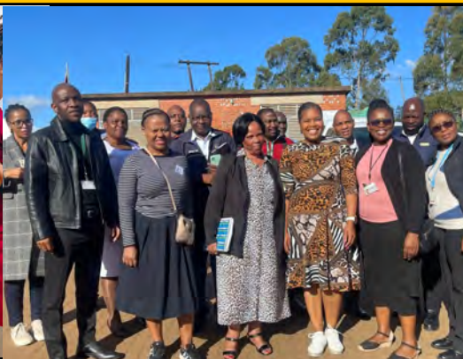
PREMIERE'S OFFICE VISIT