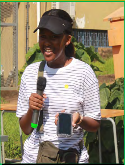
OUR O.T ADVISING US