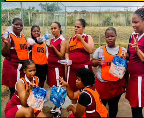
SPORT TOURNAMENT DAY