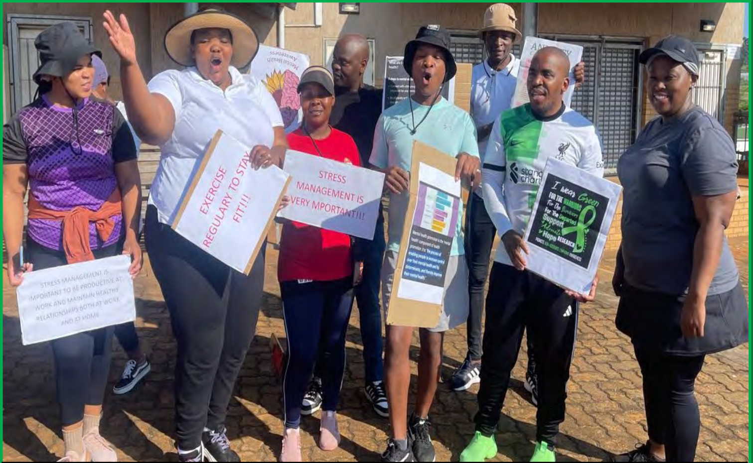
ABOVE: MBONGOLWANE HOSPITAL WAS PROMOTING HEALTHY LIFESTYLE AWARENESS.