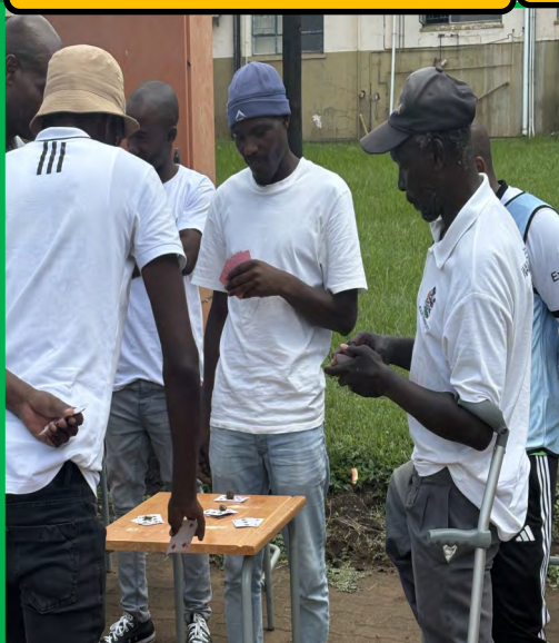
GENTS PLAYING CARDS