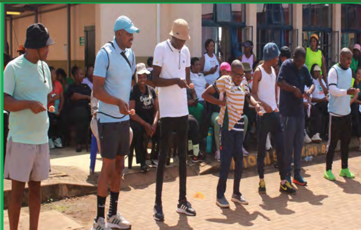
MBONGOLWANE DISTRICT HOSPITAL COLLEAGUES ENJOYING THEMSELVES