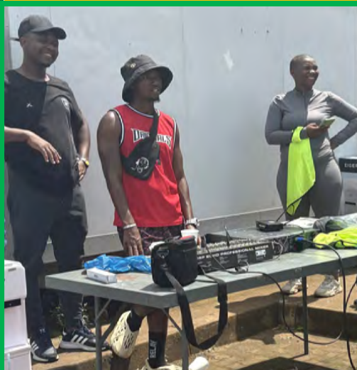
OUR DJ FOR THE DAY