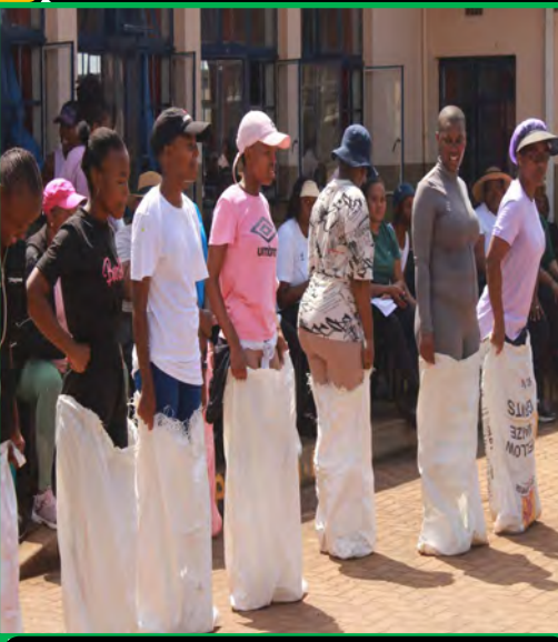
SACK GAME (GIRLS)