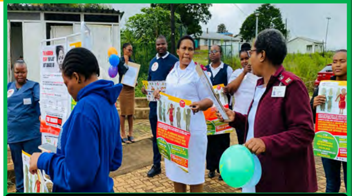
MBONGONGOLWANE H: LETS END TB TOGETHER

spreads, we also told them that this is a serious treatable, and many have been cured of the infectious disease. We promoted efforts to end disease by taking the right medication in the the global TB epidemic. World TB day is correct manner. Symptoms of TB are likely to be; Fatigue, Prolonged coughing sometimes with blood, Fever, night sweats, weight loss and chest pains. TB also affects your lungs, spine, brain or kidney. TB can spread when a person with active TB coughs, sneezes, talks, sings or even laughing. TB can only be diagnosed using skin or blood test, lab test on sputum and lung