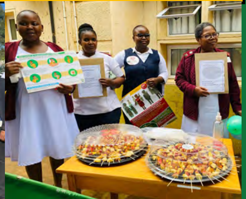
TB AWARENESS MONTH