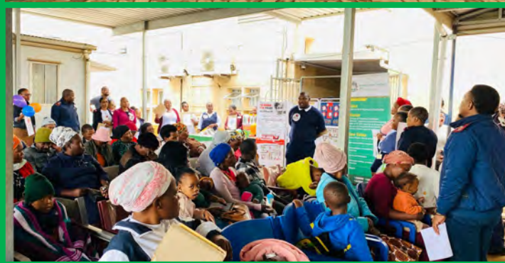
PHOTO GALLERY: TB AWARENESS DAY 31/03/2025

fluid, chest X-ray and Computed tomography scans. Once the hospital has tested you and the results come back positive we then go to your home as Mbongolwane health workers to test the whole family because TB spread fast and very contagious. We can reduce risk of contracting TB by washing our hands thoroughly and often, coughing into your elbow or covering your mouth when coughing, avoiding close contact with other people, making sure take all your medications prescribed to you and also not returning to school or work until you have been cleared by your Doctor or a nurse.