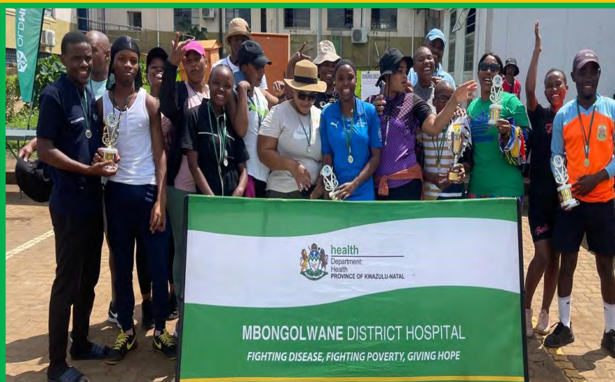
ABOVE: PEOPLE WHO WON WHILE PARTICIPATING

M bongolwane Hospital marked Healthy Lifestyle awareness Day with a goal of encouraging both staff and patients to adopt habits that support long-term health and well-being. The focus was on critical behaviors such as getting adequate sleep, eating a balanced nutritious diet, engaging in regular physical activity, maintaining a healthy weight by monitoring BMI, avoiding smoking, limiting alcohol intake and managing stress and mental health effectively.