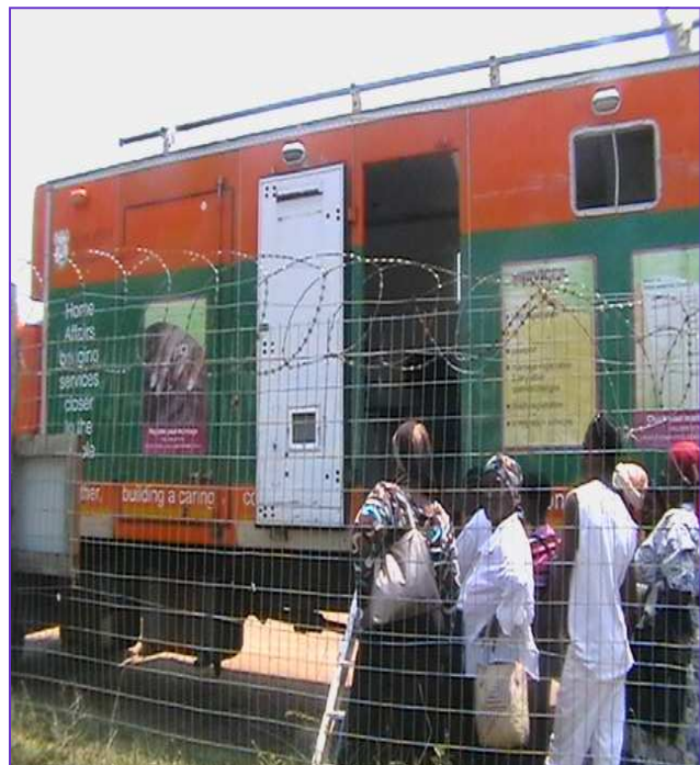
Home affairs issuing ID & birth certificates