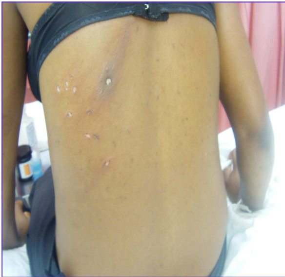
One of the victim learners showing burnt wounds on her back

Others were traumatized and having some bruises resulted from their pushing forcing the exit from their classes.