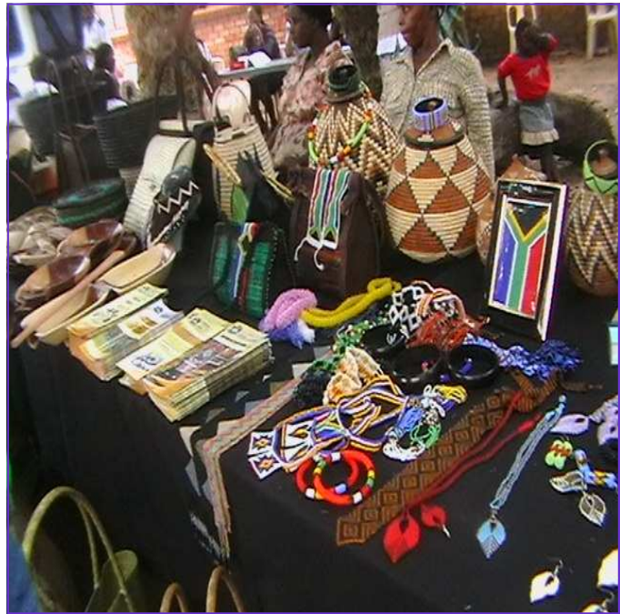
ARTS & Culture displaying their products