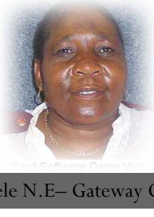
Nsele N.E– Gateway Clinic