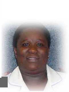
Maphumulo C.N. -OPD