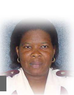
Kunene N.J– Ward 2