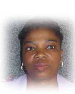
Dlamini N.P. Pediatric Ward