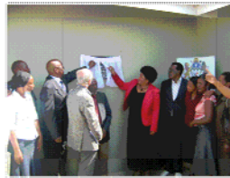
This was the unveiling moment of a new structure of Mduku clinic