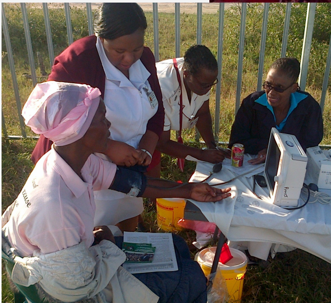
Left: Mobile health service delivery