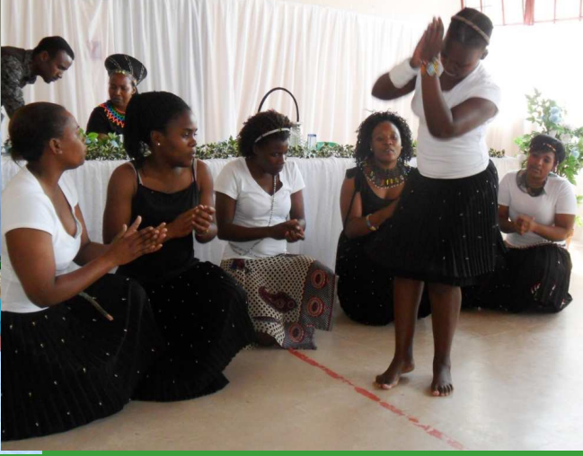
Even young women had traditional dance to offer for the celebration