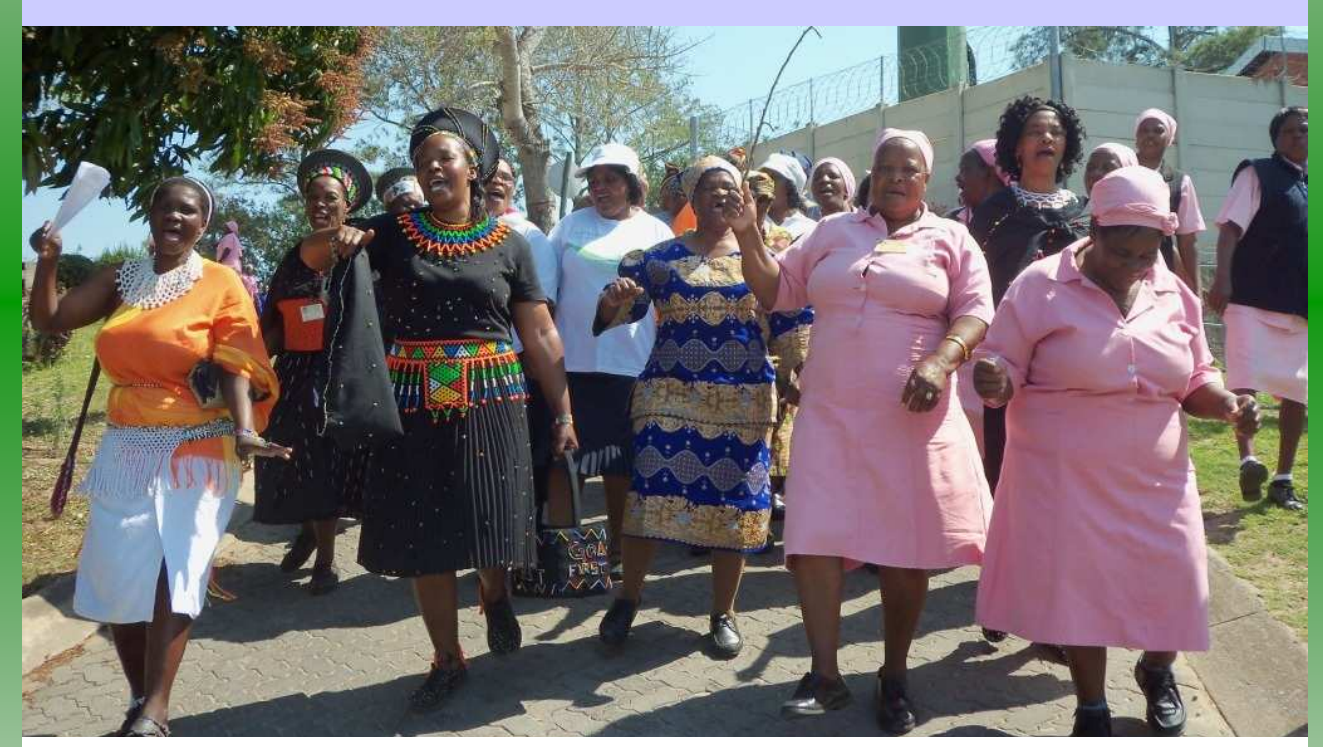
Mseleni Hospital women as they walked towards the venue where their celebration was held

"Wathint' abafazi, wathint' imbokodo!" "You strike women, you strike a stone, and you will be destroyed!"