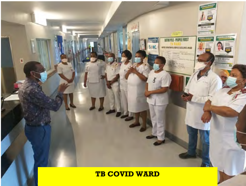
TB COVID WARD