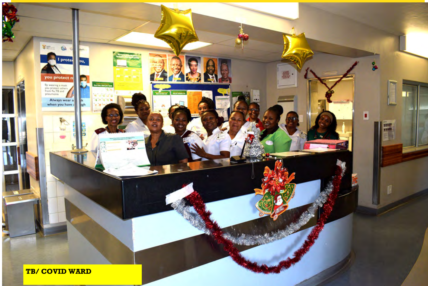
TB/ COVID WARD

Various departments have done their best in making patients feel the spirit of the Merry Season.