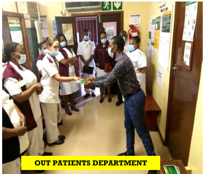
OUT PATIENTS DEPARTMENT

ABOVE: CEO AWARDED COMPLIMENTS SLIPS BY THE PATIENTS THROUGH SUGGESTION BOXES TO STAFF WHO GOT COMPLIMENTS FOR GREAT SERVICE AND POSITIVE ATTITUDE TOWARDS PATIENTS. THIS INCLUDES THE DOCTORS, NURSES AND OTHER CATEGORIES OF STAFF