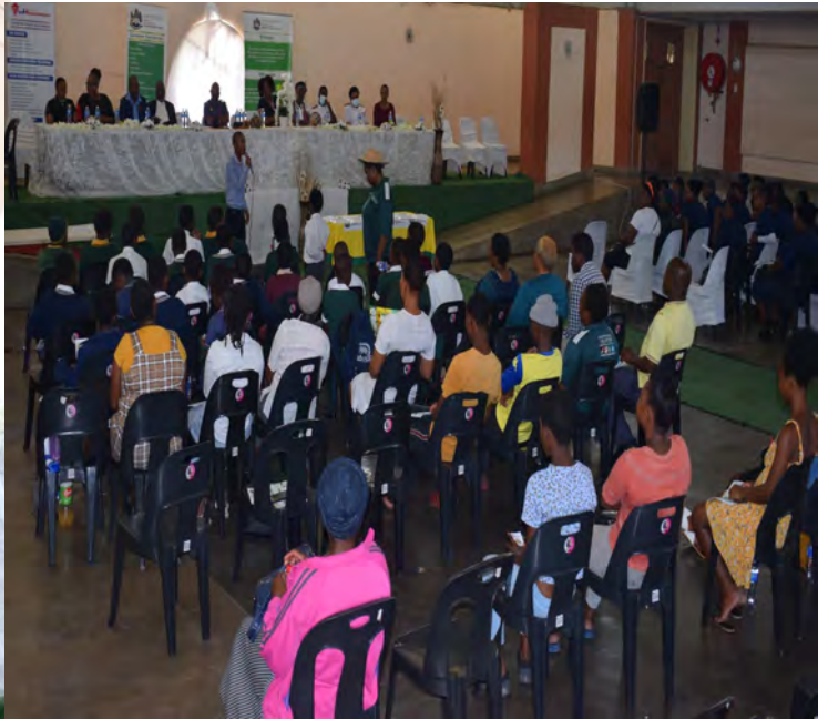
Various stakeholder and sister departments took turns in giving talks and encouraging people to speak up in cases of abuse. Elderly and frail patients were encouraged to utilise local War Rooms to voice out their concerns and challenges through their nearest local Sukuma Sakhe structure.