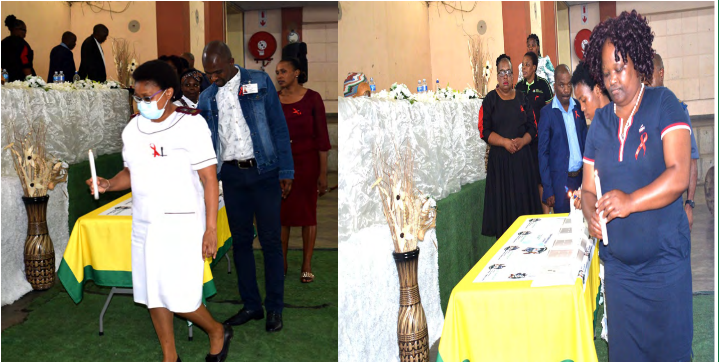
Various departments commemorating World Aids Day 2022 at Izingoleni Community Hall