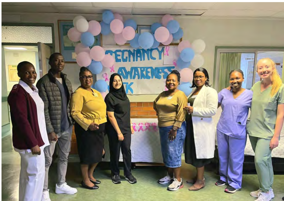
Above: Maternity Ward, Social Services and Dieticians Team during the Pregnancy Awareness Week.

The sessions are critical as they also are used to identify potential complications early and promote a healthy pregnancy.