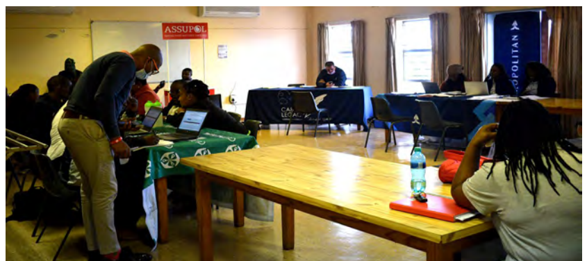
METROPOLITAN, CAPITAL LEGACY & ASSUPOL PROVIDING THEIR SERVICES ON SITE