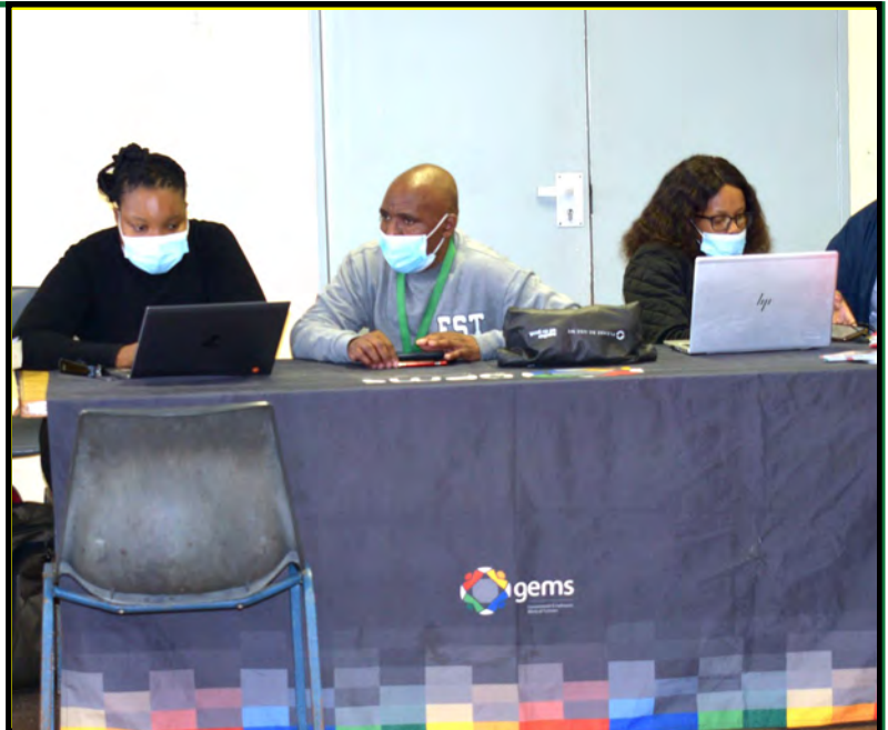
GEMS PROVIDING SERVICES ON SITE

Halfway Mazda and Hyundai displayed their latest cars for the staff and offered consultations.