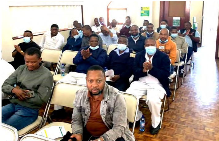
Men listening attentively to the speakers of the day

M en's month is an annual observance aimed at raising awareness of preventable health problems experienced by men in society. By hosting Men's Health Awareness, we aim to encourage early detection and treatment of diseases. It is important as a man to brush up on your health facts, listen to your body and be sure to get regular check-ups. Not only will you live longer, you'll have a better quality of life.