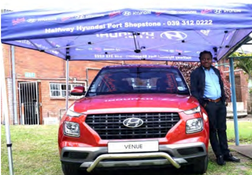
HALFWAY HYUNDAI MARKETING THEIR PRODUCT ON SITE