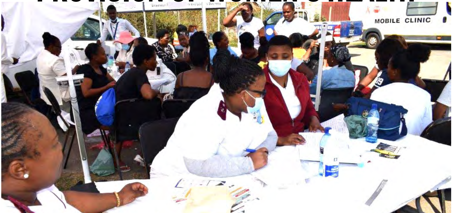
Above: Murchison District Hospital team at Maveshe Community Hall providing services during the Provision of Women's health at Maveshe community Hall on the 25th of August 2022.

The month of August is known to be women's month, in commemoration of "Imbokodo", Murchison District Hospital embarked on the Provision of Women's Health Campaign which took place on the 25th of August 2022 at Maveshe Community Hall. During the past two and half years, central focus has been around the global pandemic of Covid 19 which