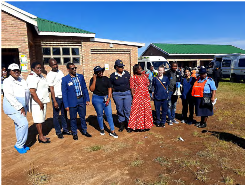
Stakeholders with hospital management —SAPS/EMRS/NGO-Isibani