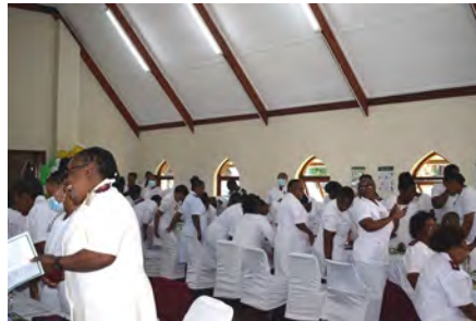
Murchison Nurses rejoicing during the event