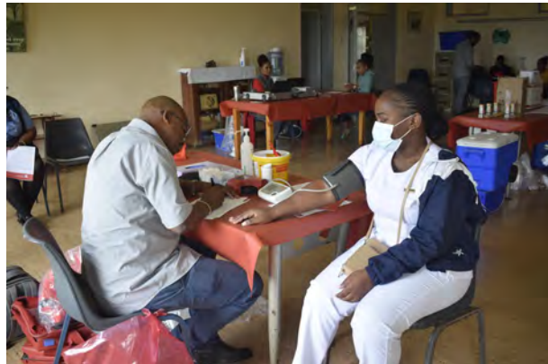
ABOVE: Staff members donating blood during the blood drive.