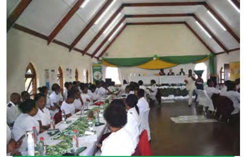
Murchison Hospital Nurses