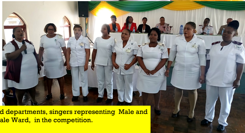
Ward departments, singers representing Male and Female Ward, in the competition.