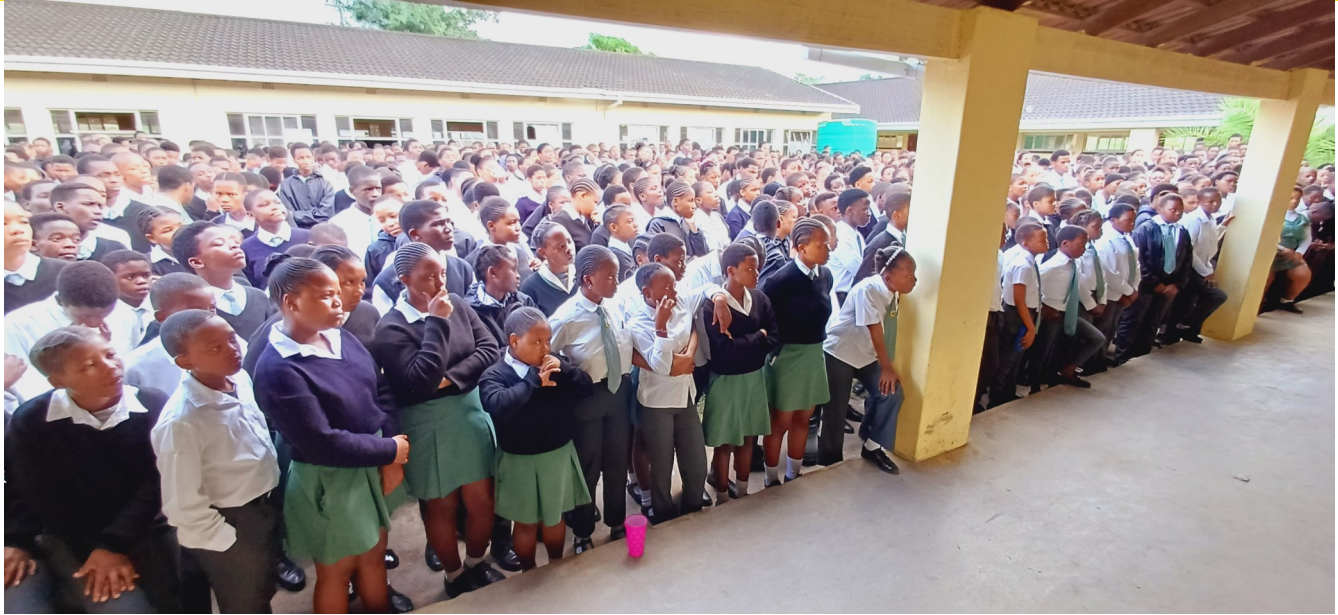
Above : Learners of Sister’s Joans High School listening attentively to the speakers of the day

Murchison District Hospital embarked on a Drug and Substance Abuse Awareness campaign for the learners of Sister Joans High School. The campaign was supported by Sitholimpilo Rehabilitation Center, which is a rehabilitation facility assisting those who want to restart their lives.