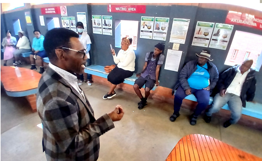
The Pharmacy Department also prepared tea for patients to enjoy whilst waiting for their medication.