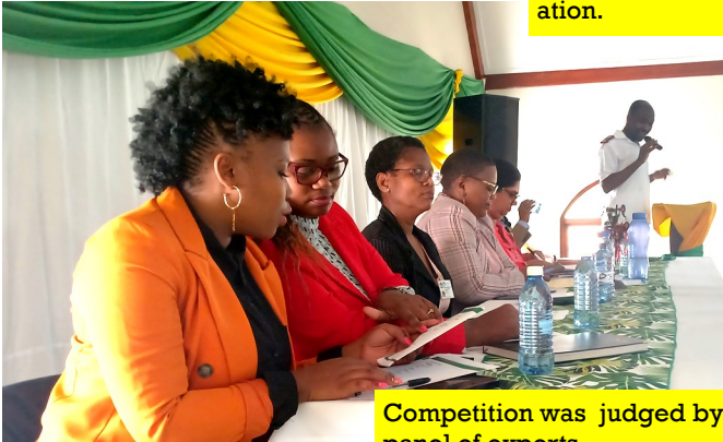
Competition was judged by a panel of experts