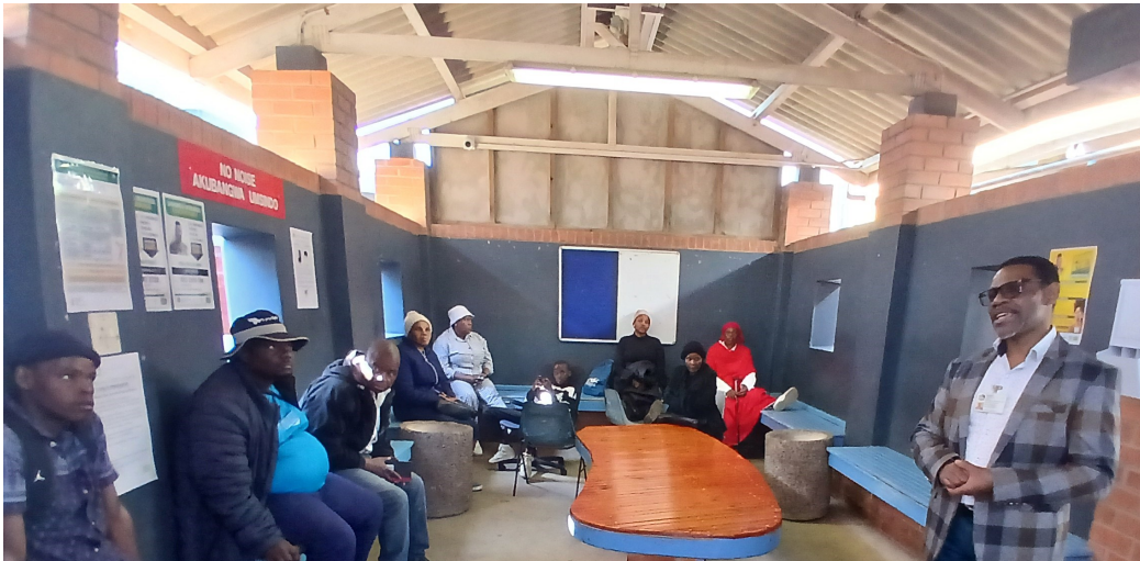
Chief Executive Officer introducing himself to the patients whilst waiting for their medication in Pharmacy Department.