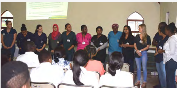
MEDICAL COMPONENT MEET&GREET P5