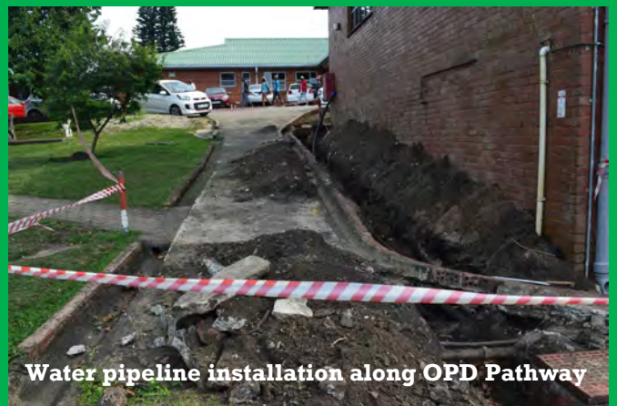
Water pipeline installation along OPD Pathway