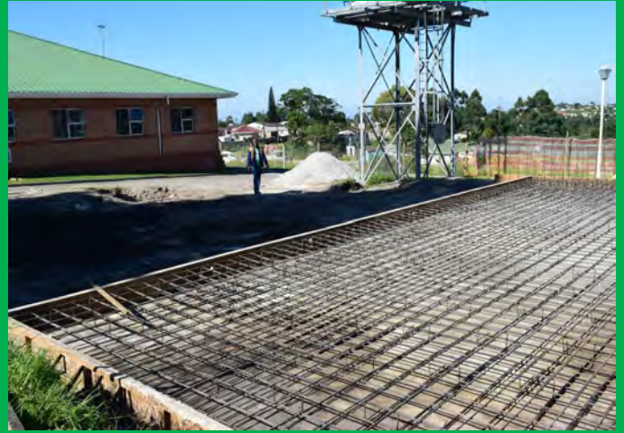
ABOVE: Parking lot under construction for the water storage project.