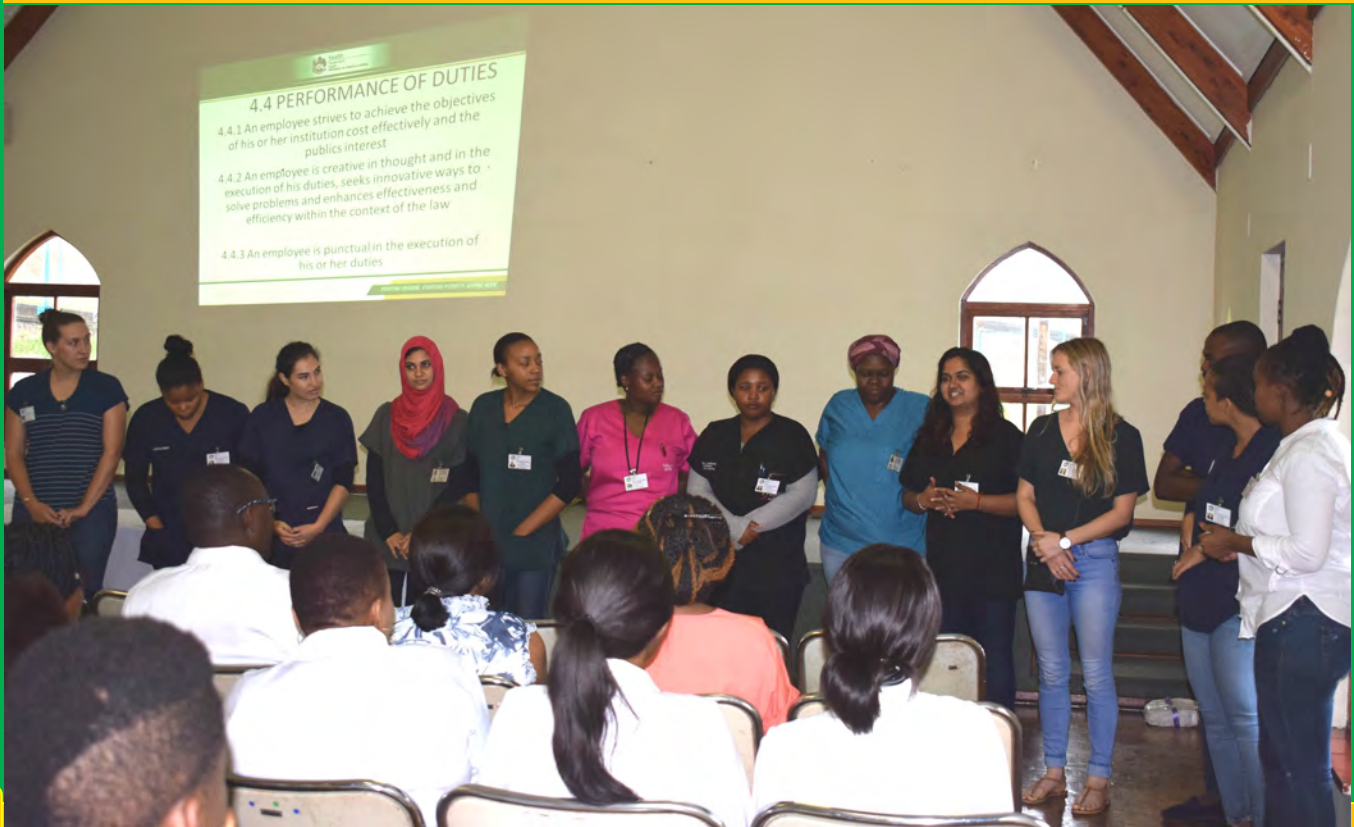
ABOVE: Allied Services introducing their service packages after their presentation.

On the 15th of January, the Medical Services component hosted a Breakfast meeting with the intention of introducing executive management committee, the old and new staff in the institution. The gathering also intended reinforce ethics in the workplace especially in the medical component. Various sub-components such as Pharmaceutical services, Allied Services, Medical Doctors and Clinicians also conducted a presentation based on their services that they provide.