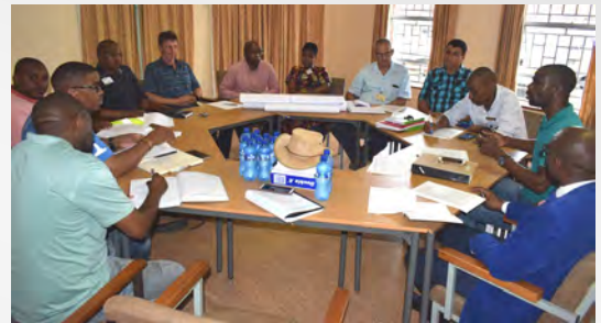
72 HOUR WATER STORAGE PROJECT P7

FIGHTING DISEASE, FIGHTING POVERTY, GIVING HOPE