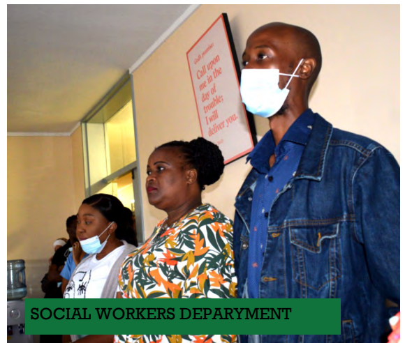
SOCIAL WORKERS DEPARTMENT