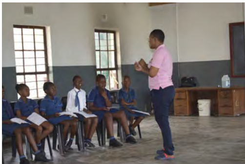
Above: Murchison District Hospital School Health Team rendering HPV Campaign services at Ndabezinhle Primary school