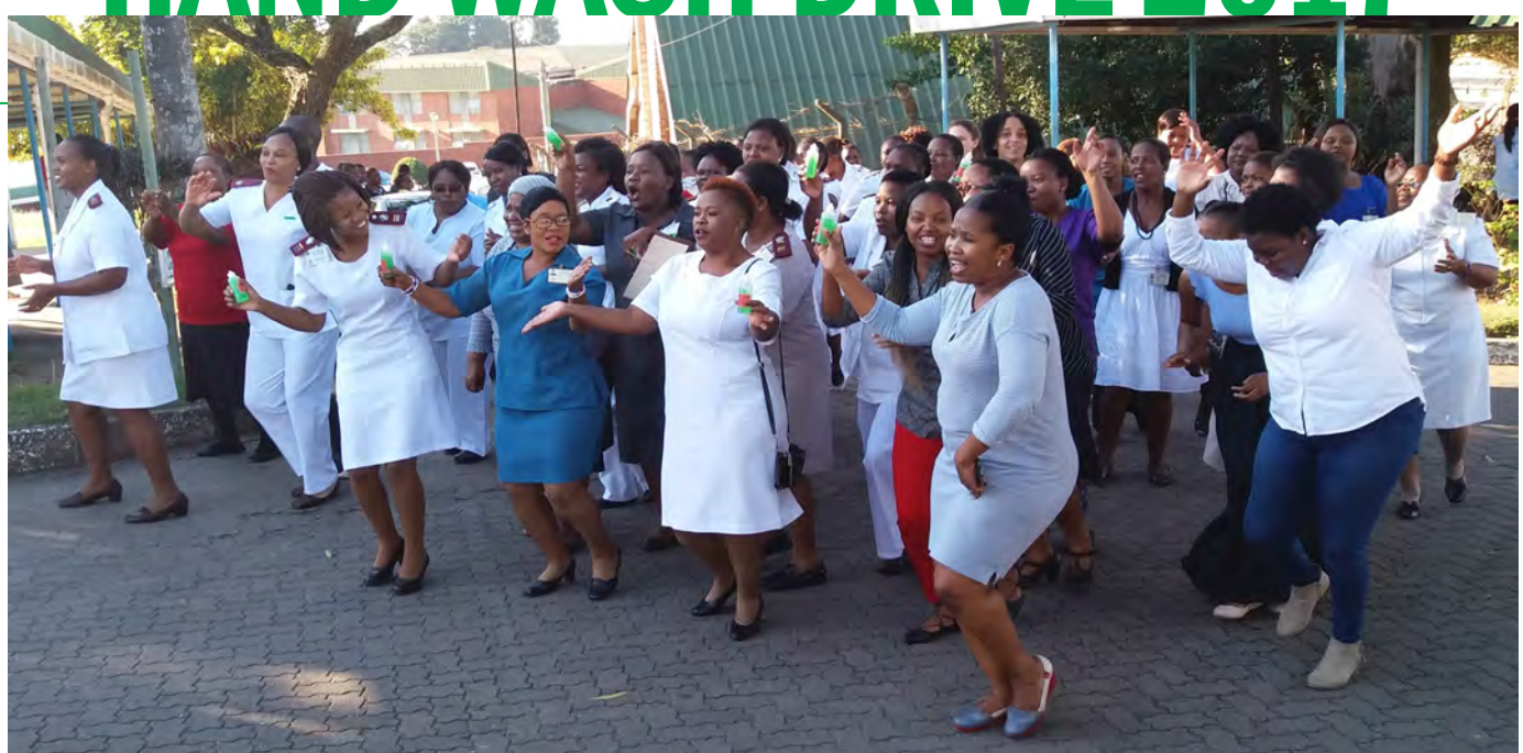
ABOVE: Murchison District Hospital staff during the Hand Wash Drive

n the 3rd of May, Murchison District Hospital Launched the Hand Wash Drive in commemoration of World Hand Hygiene Day. This campaign aimed at informing staff and the community about the importance of always keeping your hands clean to avoid germs and promote good hygiene both at the workplace and outside the workplace.