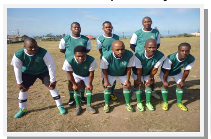
ABOVE: Murchison Hospital Soccer Team