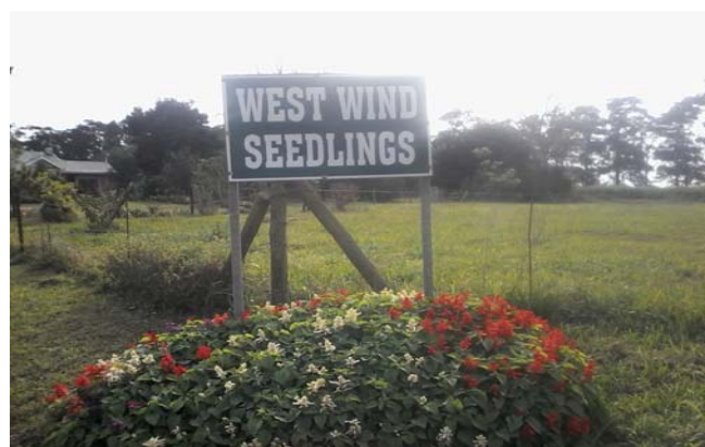
West Wind Entrance gate