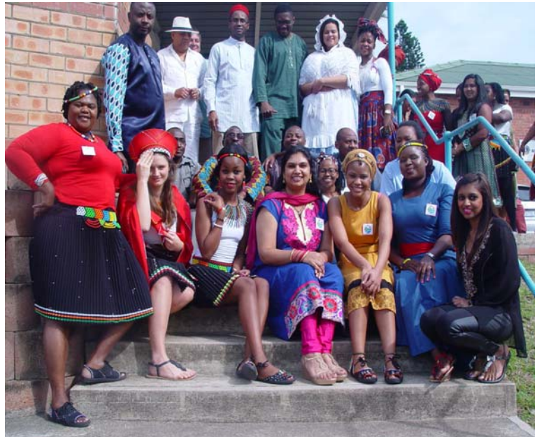
Doctors and The Rehab Team

It is therefore important for South Africans to reclaim, restore and preserve these various aspects of living heritage to also address challenges communities are facing today.