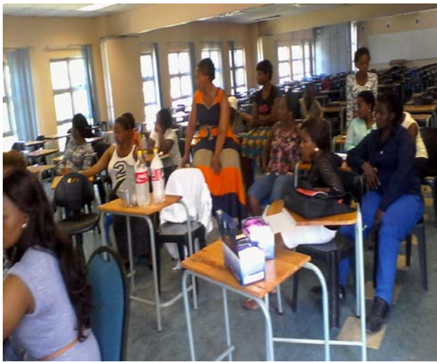
Health talk was given on breast self-examination