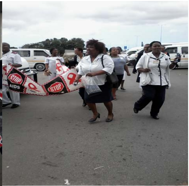
Lindokuhle staff during the HIV and TB awareness march

On 29/09/2016 the Lindokuhle Team visited Murchison Taxi Rank. Condoms, IEC material were distributed to the members of the community and taxi drivers were educated about HIV & AIDS, family planning, STI and TB.