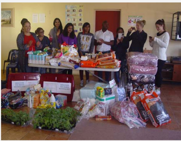
Murchison hospital staff with the donated parcels