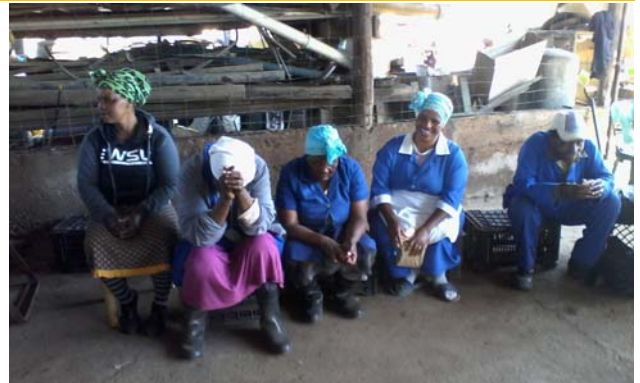
Waterfall staff queuing for HCT, TB and BP Screening

Health education was given on how to perform breast self-examination to check for lumps and to check the breast for changes which may signal breast cancer.