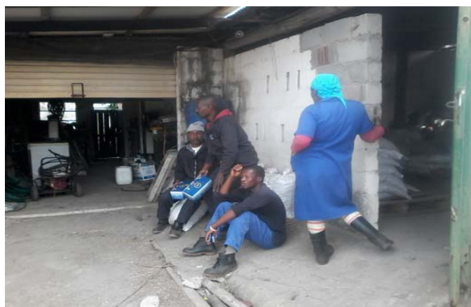
West Wind farm workers queuing for HCT and TB screening

We decided and agreed upon forming a club, where we are going to distribute ARV drugs to clients who are stable in the farm. We created a list of clients that are interested and that meet the criteria to be part of the club.