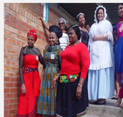
Rehab and Admin Staff