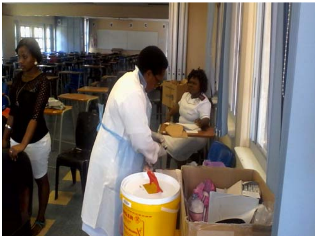
Lindokuhle Staff preparing for the Day