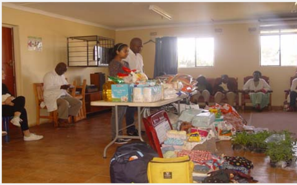
Dental team about to do a presentation