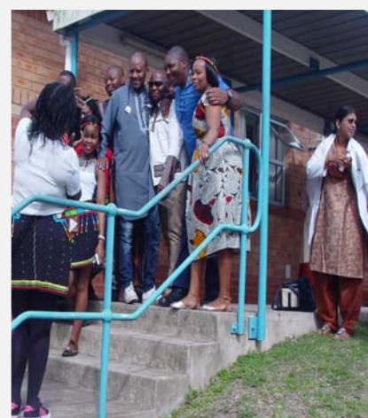
Doctors and Admin Staff