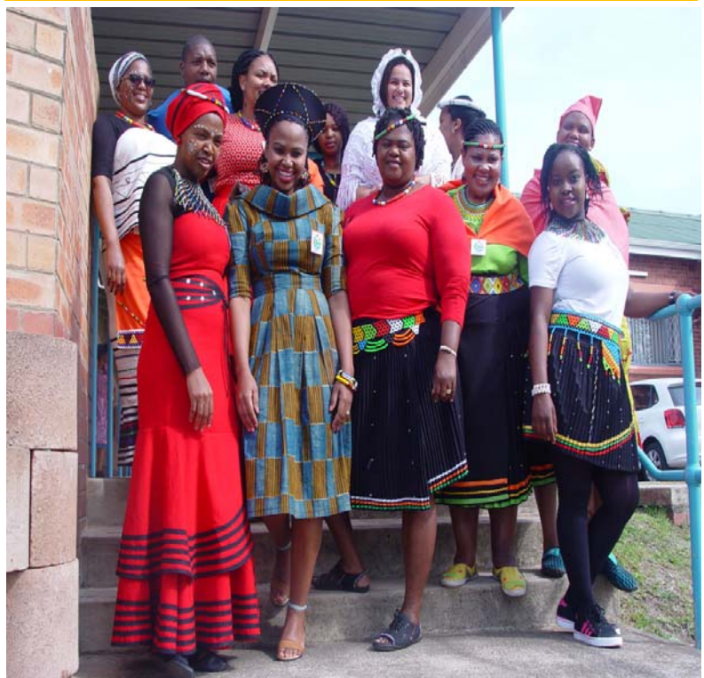
Rehab and Admin Staff