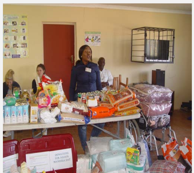
Social worker - speaking to the elderly