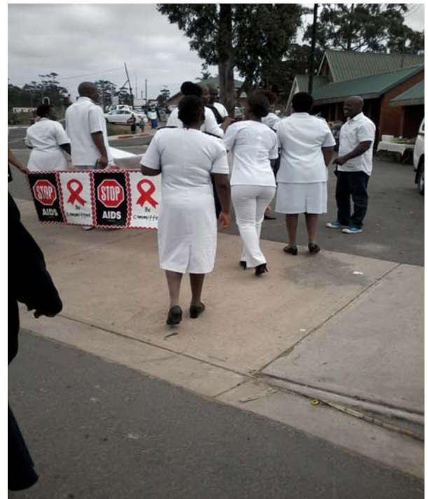
HIV and TB Awareness march