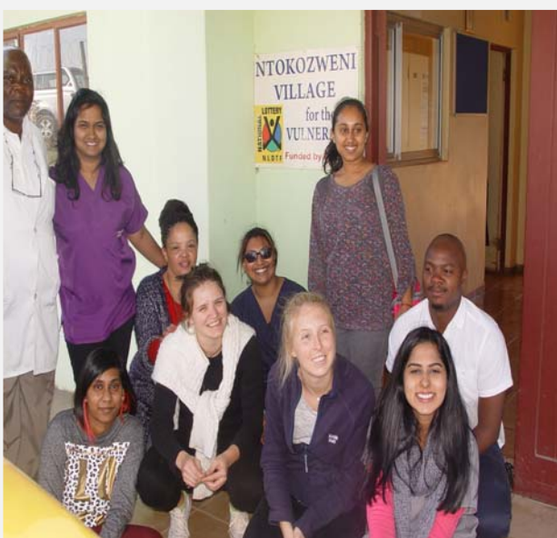
Rehab and Dental Team