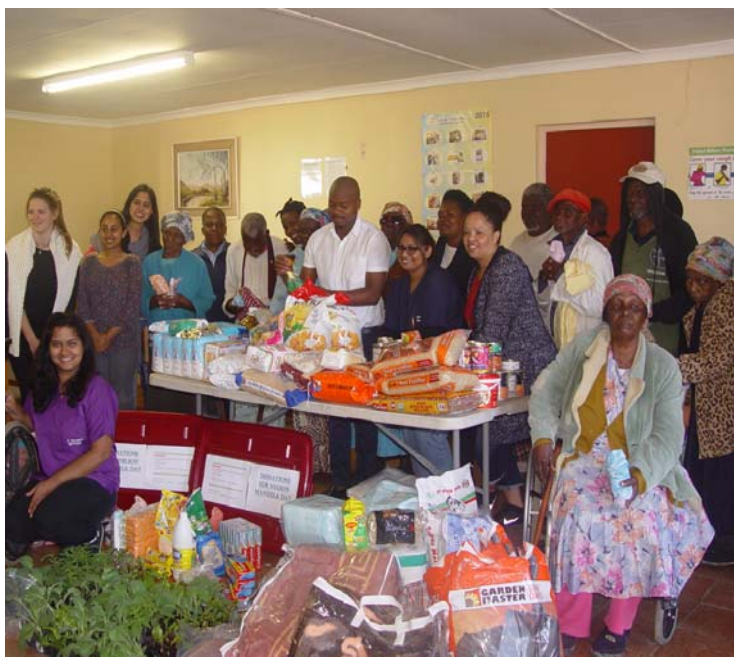
Murchison Hospital Staff with the elderly at Ntokozweni

“blessed is hand that giveth than that receiveth”