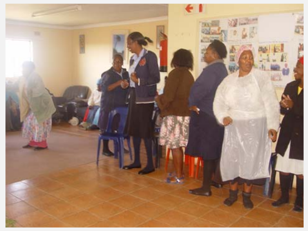
Staff of Ntokozweni