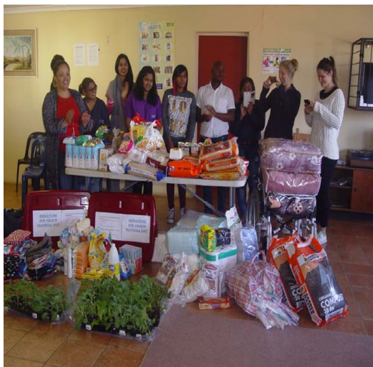
Murchison Hospital staff with food donated by hospital staff