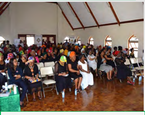
Women's Forum Launch P6