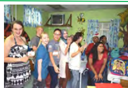
CP PARTY PG 7

FIGHTING DISEASE, FIGHTING POVERTY, GIVING HOPE