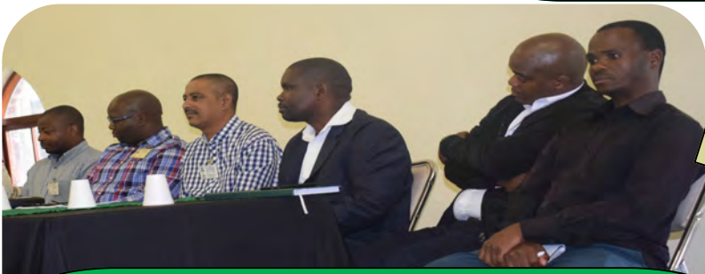
HOSPITAL MANAGEMENT AND HOSPITAL BOARD MEMBERS