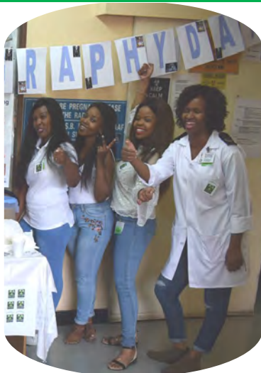
Above: Murchison District Hospital Radiography Team

The 8th of November is the Worlds Radiography Day, the date that marks the anniversary of the discovery of x-radiation.