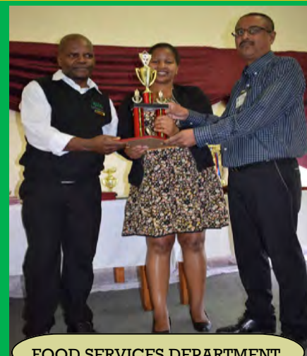
FOOD SERVICES DEPARTMENT

Quality Day strives to engage institutional leaders in quality improvement projects, foster new ideas for future projects, increase staff participation in quality initiatives, and provide a venue for dissemination of outcomes. It provides a platform to celebrate quality improvement successes and learn about creative new project ideas.