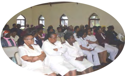
Member of the public during Q&A Session