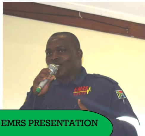
Human Resources and EMRS PRESENTATION