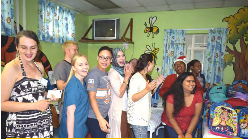
ABOVE: Rehab Team singing Christmas Carols whilst preparing to distribute the gifts