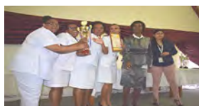
QUALITY DAY PG 4