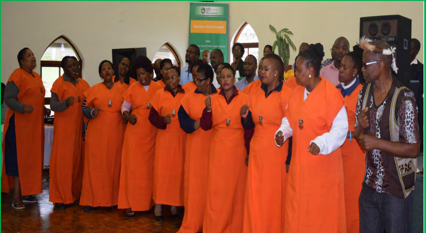
ABOVE: Murchison District Hospital Choir during the Open Day Programme

O n the 7 th of December 2017 Murchison District Hospital hosted an Open Day, a day that is used to put forward the community and patients interest about the services offered by the hospital. On this day, the community of Murchison and surrounding areas were invited to be enlightened and be reminded of the service rendered in the health facility, how the community can benefit from the health facility, who and how they can use the hospital, what services can they get, what to bring when coming to the hospital. The community was also given an opportunity to ask questions and voice their concerns pertaining to the hospitals service delivery.