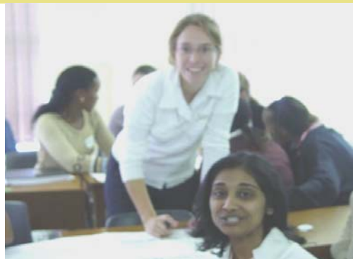
THIS PHOTO WAS TAKEN AT THE LAST BATHO PELE WORKSHOP HELD ON 29 MARCH 2006

What we try and do in these workshops is to encourage staff to interpret these principles into their daily working environment.s. Remember it not an added duty on us as staff but a way to improve on what we have already been doing.