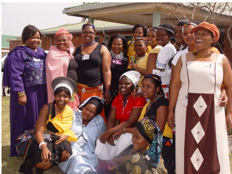
Some of staff during heritage day in their traditional outfits.