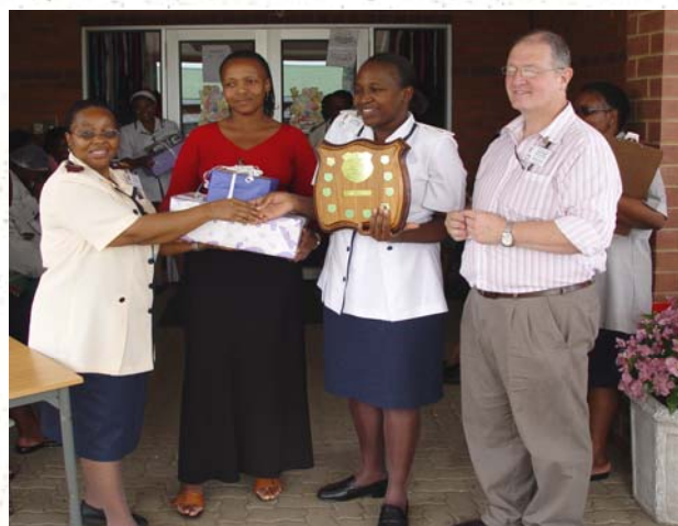
Position one went to Paediatric ward