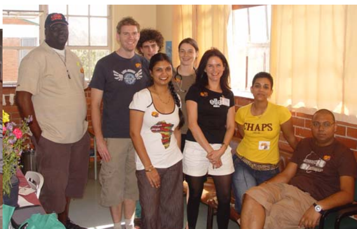
Doctors came dressed casually during National casual day . This year we were supporting Schola Amoris— School for intellectually disabled children.