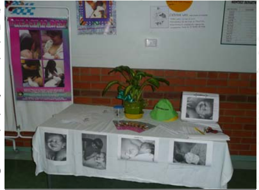
Display table showing diagrams of breastfeeding positions.