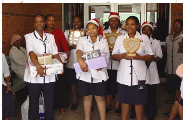
Position three was taken by Female ward