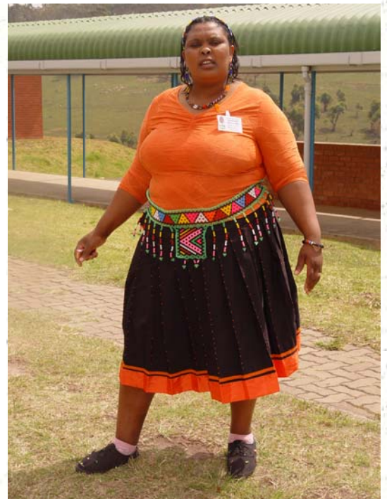
These pictures were taken during the hospital heritage day in Sep- tember 2008

Murchison hospital , Private Bag 701, Port Shepstone, 4240, Tel: 039 687 7311 Email: silindile.mabaso@kznhealth.gov.za