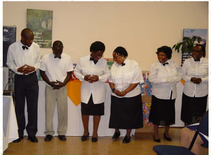
Kwesingenhla iqembu lesicathamiya elishaya into esezingeni elicokeme bazibiza nge Siphithiphithi