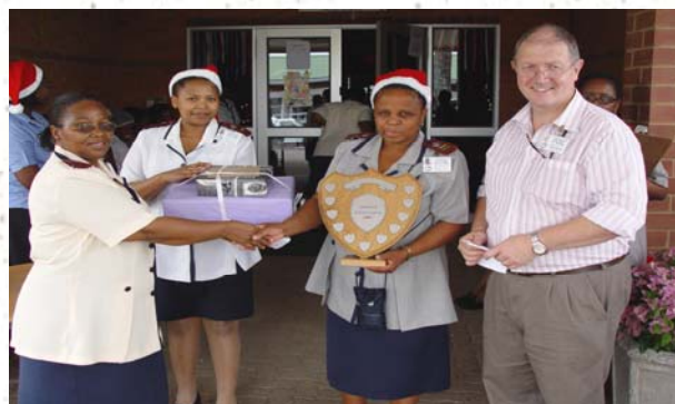
Position two went to Maternity ward