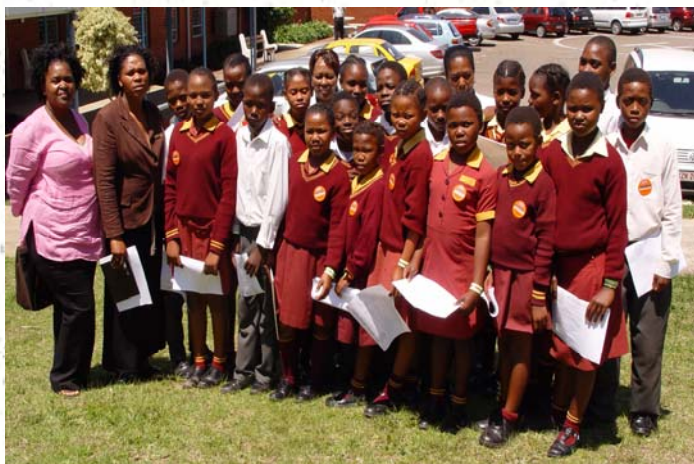
Umdlazi primary school learners from Bhubhoi visited the hospital to get detailed information on HIV/AIDS for their school project.