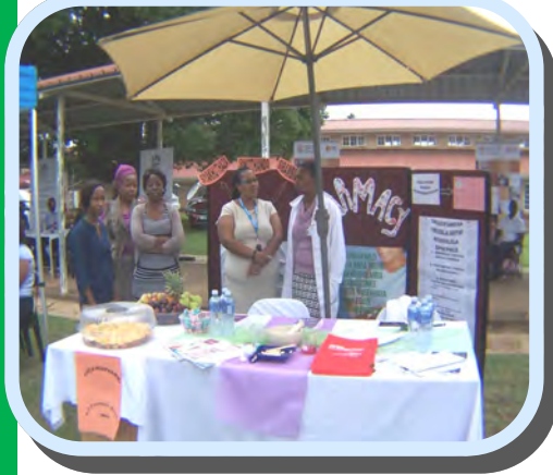
PHARMACY DEPARTMENT PEOPLE VISITED THE STALL—20