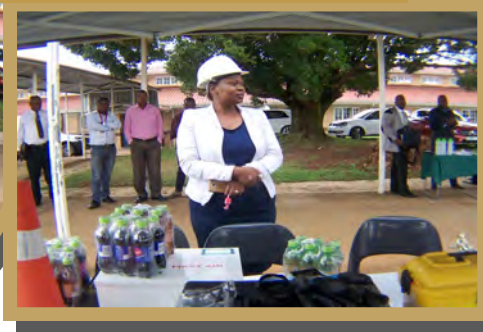
MATERNITY DEPARTMENT PEOPLE VISITED THE STALL—12