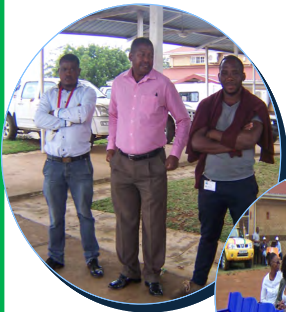
ABOVE: MANAGEMENT AND COMMITTEE MEMBERS DURING THE EVENT