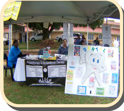
DENTAL , OT AND PHYSIO DEPARTMENT PEOPLE VISITED THE STALL—33