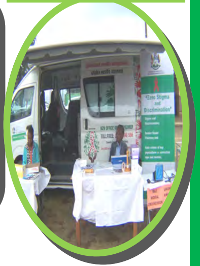
CHRONIC DEPARTMENT PEOPLE VISITED THE STALL—45