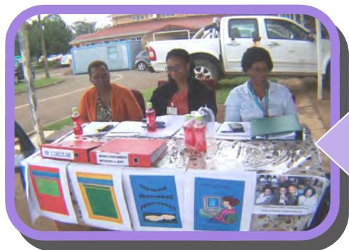
HUMAN RESOURCES DEPARTMENT PEOPLE VISITED THE STALL—21