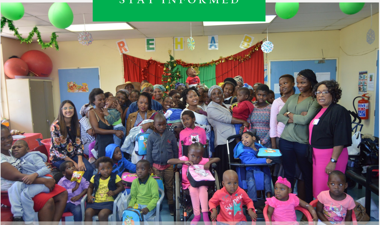
REHABILITATION YEAR END CHRISTMAS PARTY

E ach year the community service officers in the rehabilitation department are tasked to plan and organize the annual Children’s Christmas party as part of their community project to bring a little joy and happiness to little children accessing the rehabilitation services.