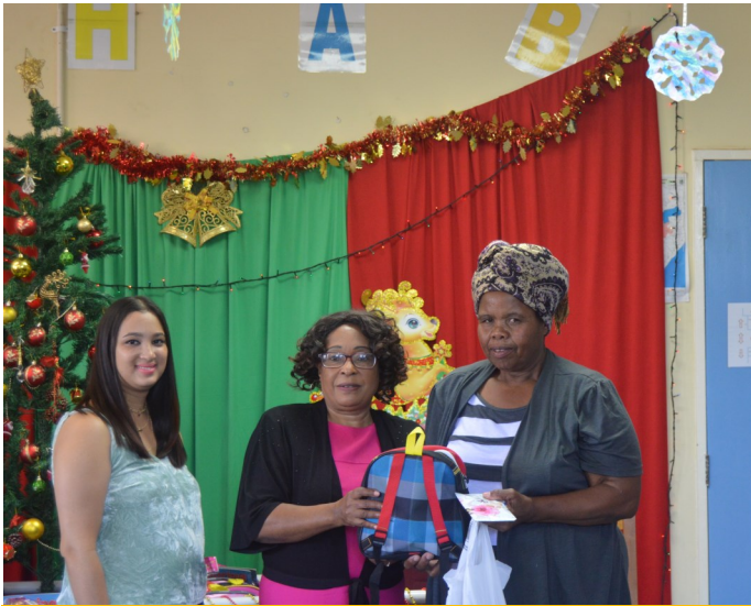
PHOTO GALLERY FOR CHRISTMAS PARY2017