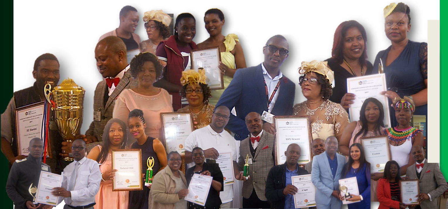
VARIOUS DEPARTMENTS WERE RECEIVING AWARDS FROM MANAGEMENT FOR OUTSTANDING PERFORMANCE

FIGHTING DISEASE, FIGHTING POVERTY, GIVING HOPE