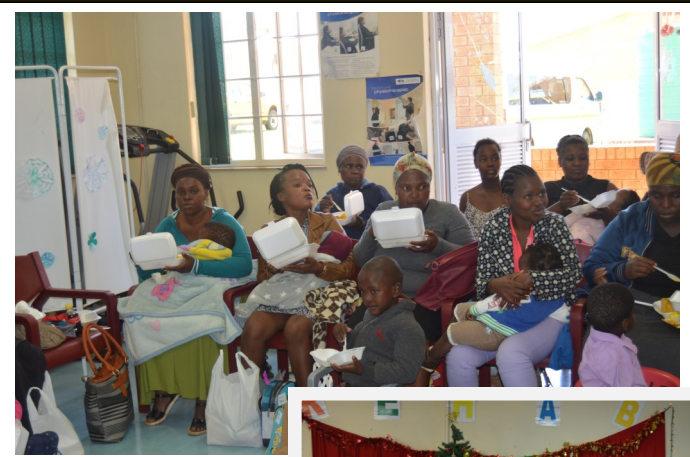
REFRESHMENTS FOR KIDS