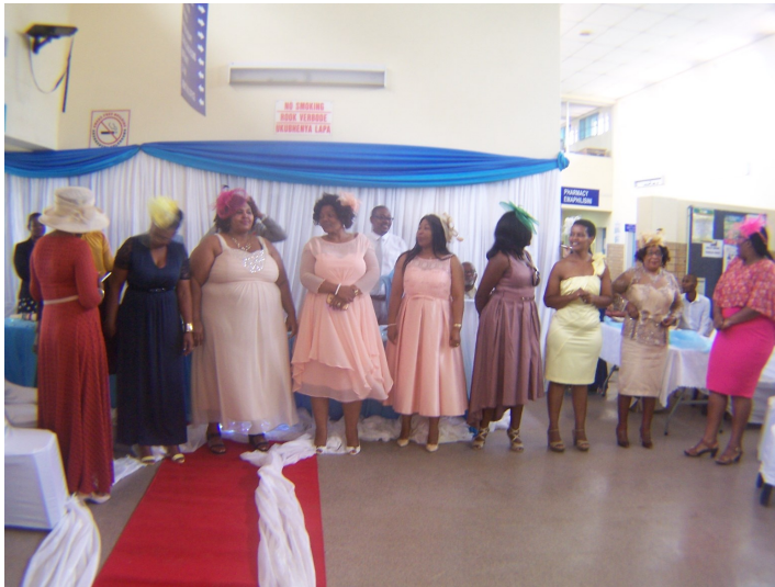
PHOTO GALLERY FOR AWARDS DAY 2017