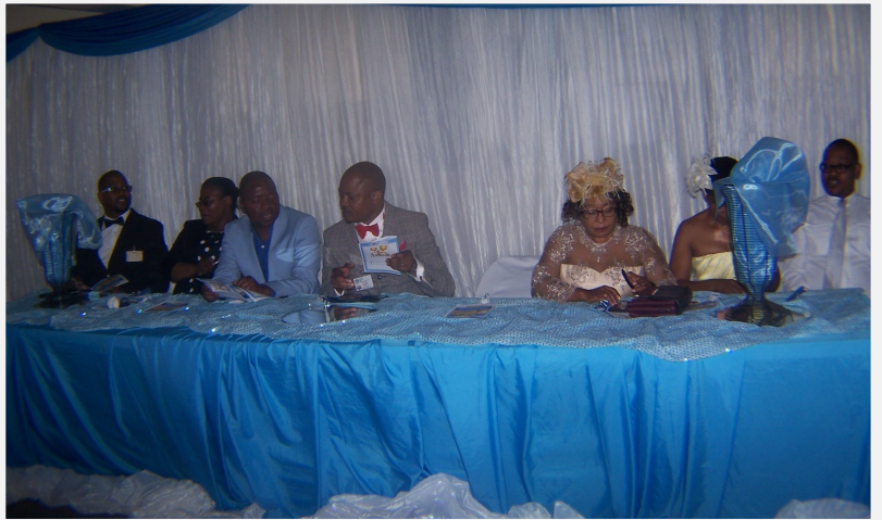
NDWEDWE CHC MANAGEMENT

S ervice Excellence Awards are rewards that are given to staff in recognition of individuals who go above and beyond the call of duty at work, it is done to appreciate and motivate employees to proceed with the ability to do great performance at work.