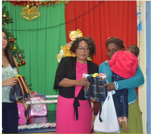
RECEIVING OF GIFTS BY MOTHERS FOR KIDS