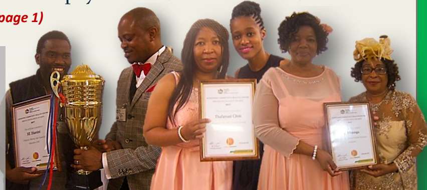
THE ANNUAL AWARDS DAY CELEBRATION 2017

FIGHTING DISEASE, FIGHTING POVERTY, GIVING HOPE