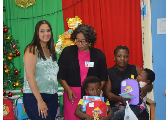
RECEIVING OF GIFTS BY MOTHERS FOR KIDS