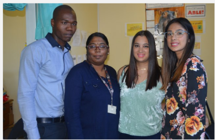
REHAB CHRISTMAS PARTY