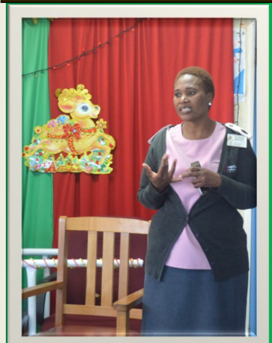
NURSE FROM IMMUNIZATION CLINIC