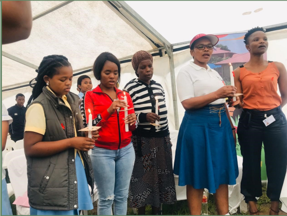
Audience participated in candle lighting in remembering those who are living and affected by HIV/AIDS..