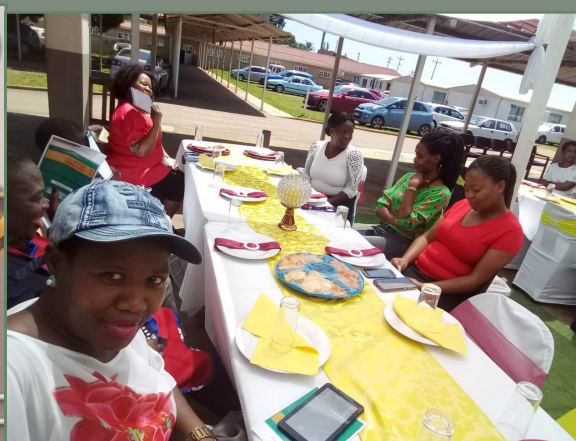
Attendees of the event