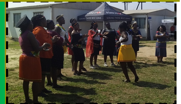
Nursing showed the crowd art of ukusina