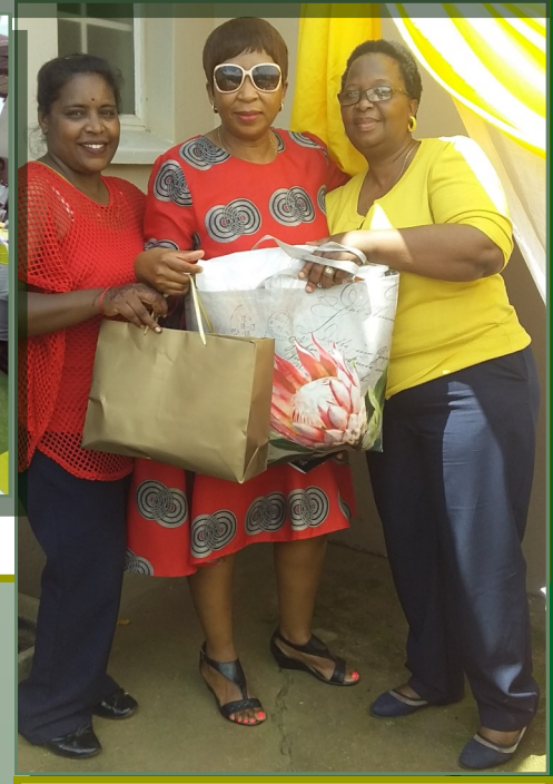
Presentation of gifts