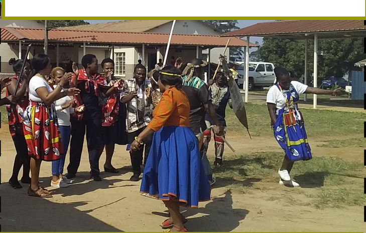
Systems Department did indlamu on the day

Staff members enjoyed different food which was prepared by components to share amongst staff members.