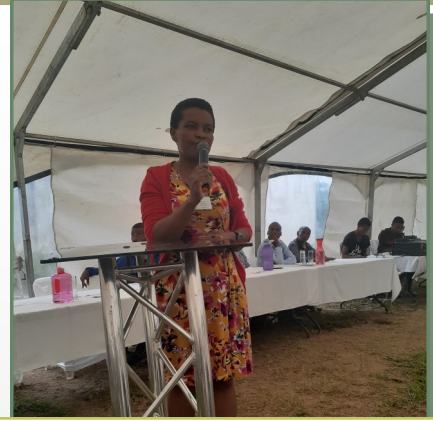
Mrs. J.N Mdimba informed the public about different programs they offer as Department of Health in order to prevent HIV like male circumcision etc.