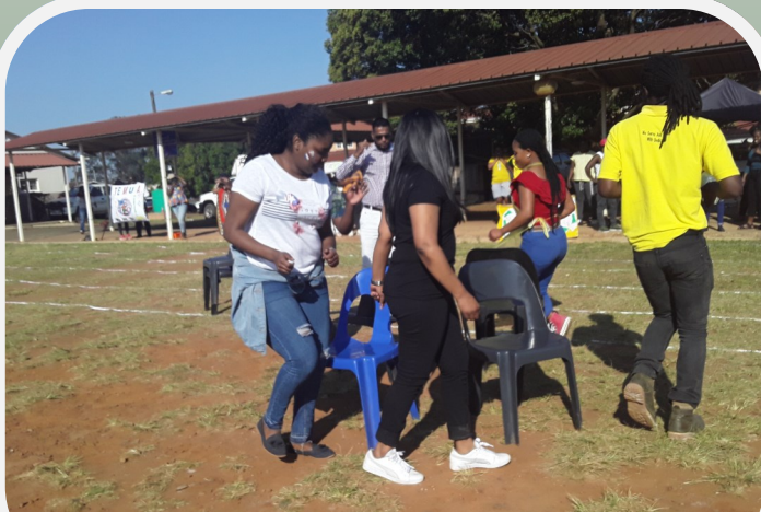
Musical Chairs was part games