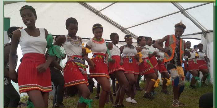
Ngungwini High School entertained the audience with Umbholoho at the event.