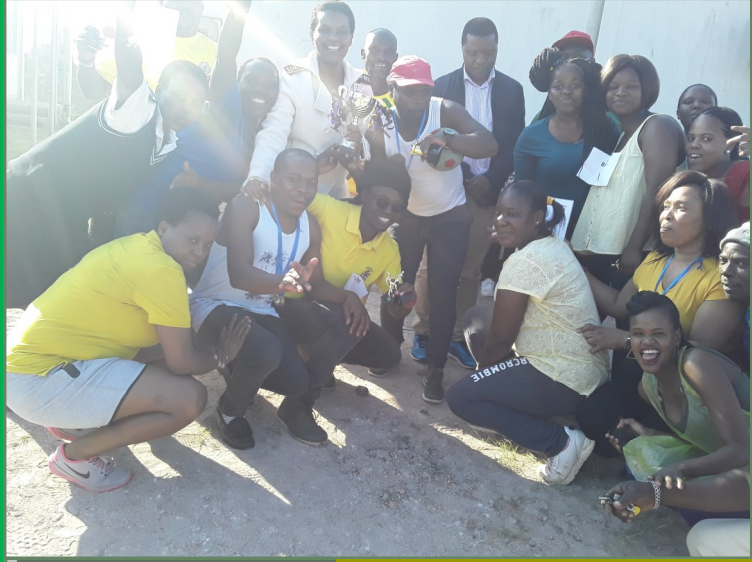
Team Brazil received a trophy and a certificate for their overall win