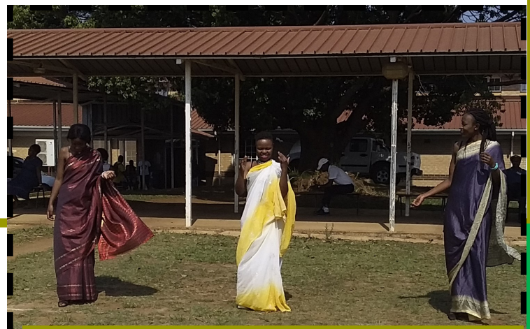
Indian Dance was done by HR Staff showing diversity