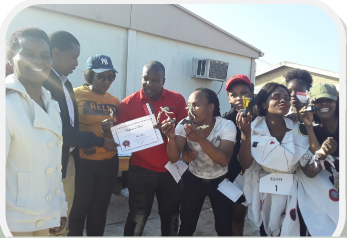
Team Egypt received a certificate for their dress code