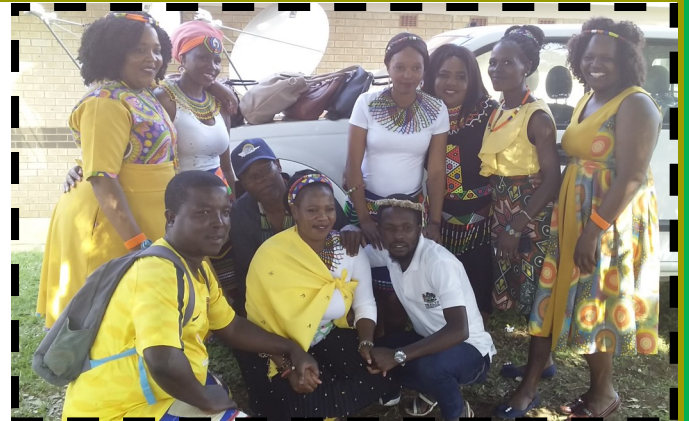
CHW's were part of the event in their traditional attire