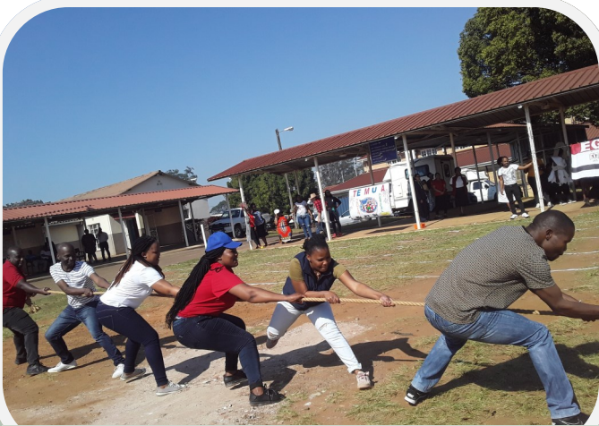
Teams participated in tug of War