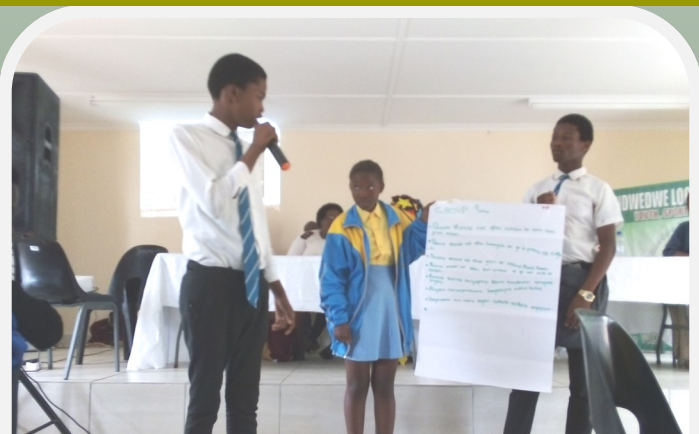
Learners presented topic regarding teenage pregnancy