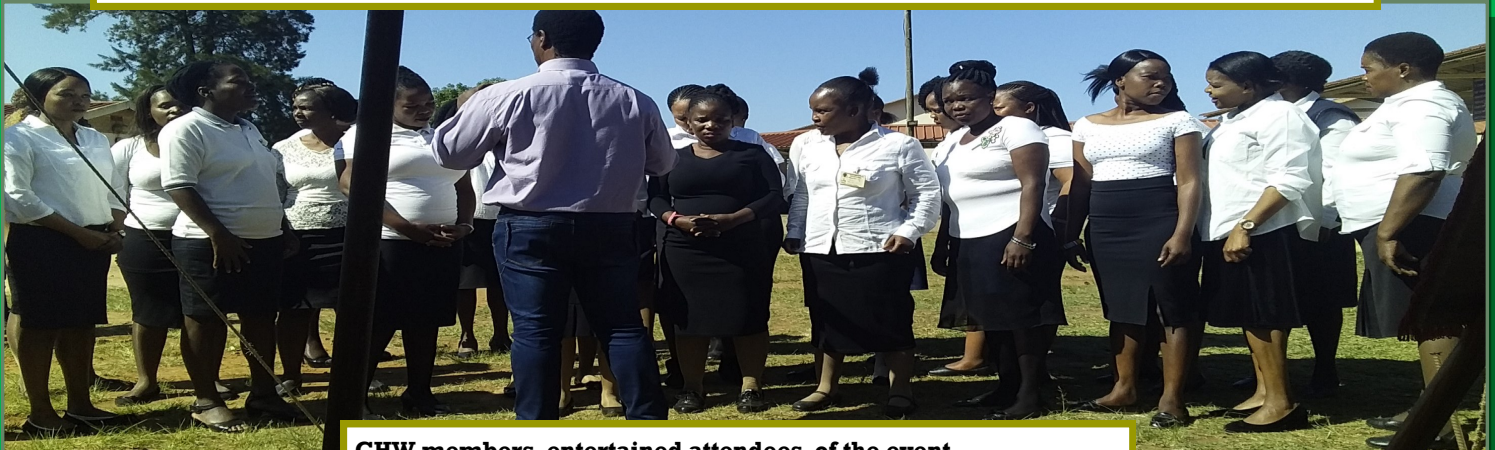
CHW members entertained attendees of the event .