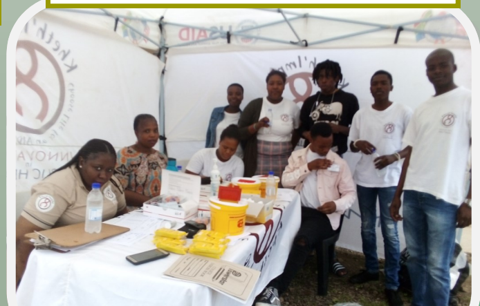
Khethimpilio did vital sign testing to attendees of the event