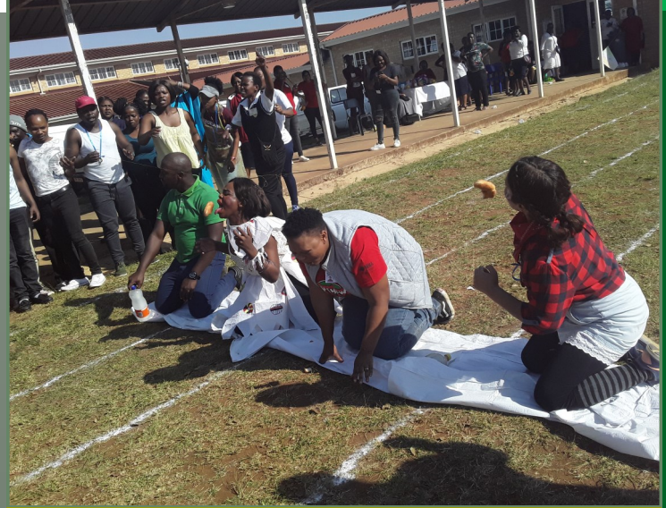
All teams participated in a donut game