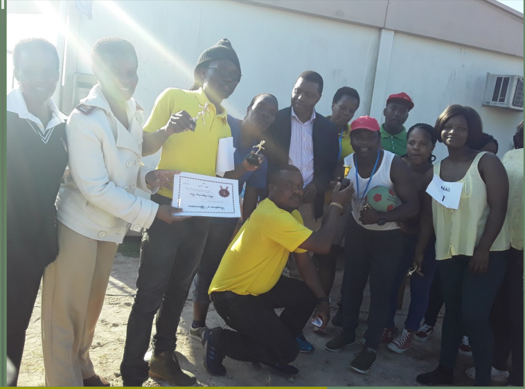
Team USA received certificate for their participation