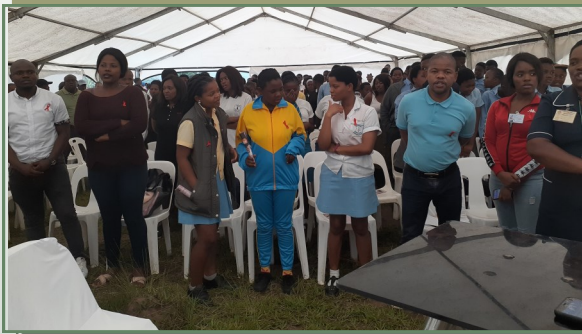
Attendees of the event sang the National Anthem in solidarity against HIV/AIDS.