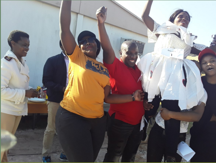
Team Egypt celebrating their second place win.