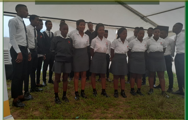
Nombika High School entertained the audience with wonderful music at the event.