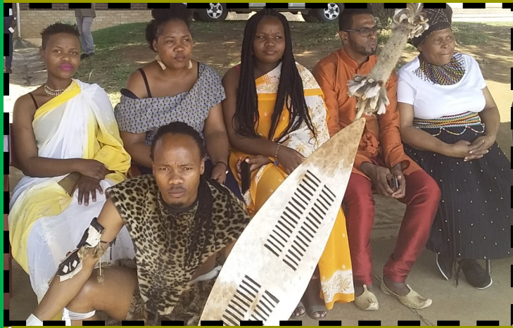
Human Resources Staff in their different traditional attire

Heritage Day was celebrated on 20 September 2019. Different department of Ndwedwe CHC participated on the event. A number of activities took place on the event such as indlamu which was done by the Systems Department, HR Staff contributed by doing an India Dance while Nursing Department showcased their talent in Ukusina.