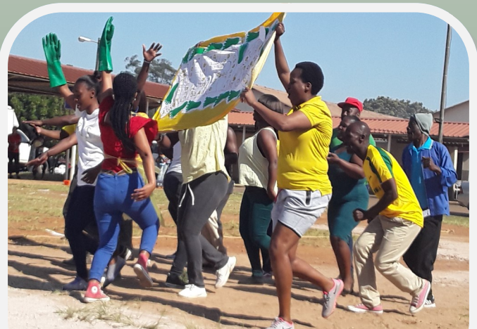
Team Brazil celebrating their winning overall games