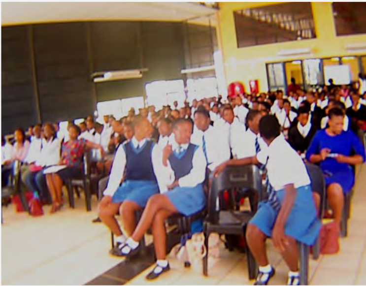
SCHOOL CHILDREN LISTENING ATTENTIVELY TO SPEAKER