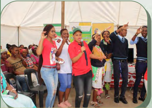
AYFS Club performing a stage play about Youth issues