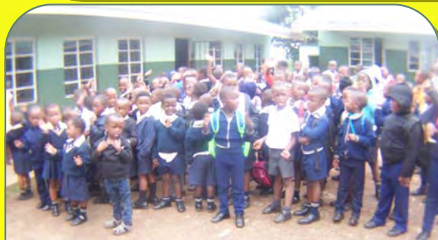
Dumezweni Primary School learners sang in appreciation of the donation given to their school mates.