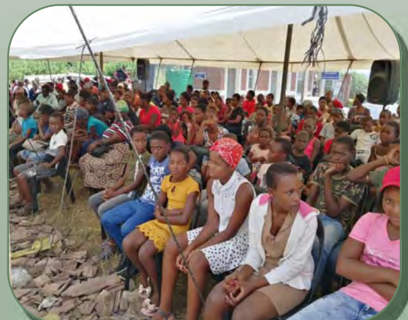
The Community and Youth members who attended the event