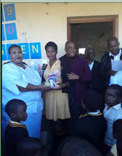
A gift hamper was given to a learner that was able to answer question regarding global hand