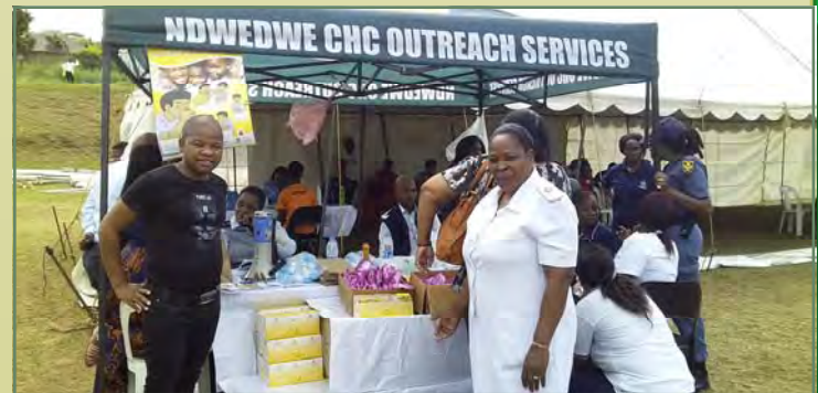
Condoms were distributed to the community that attended the event