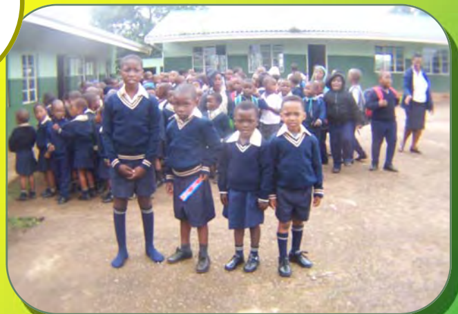
Above are the kids that were donated a school uniform

FIGHTING DISEASE, FIGHTING POVERTY, GIVING HOPE