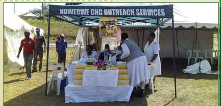
Ndwedwe CHC TB stall