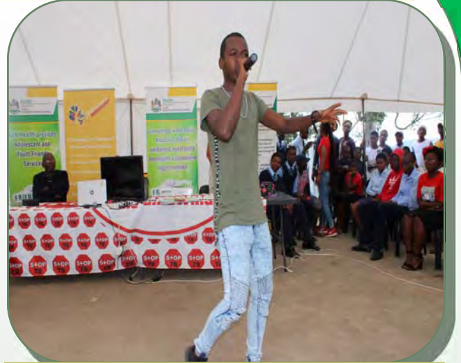
Scebi entertained attendees of the event with a song