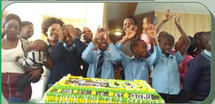
Children singing happy birthday with Boxer Store staff members