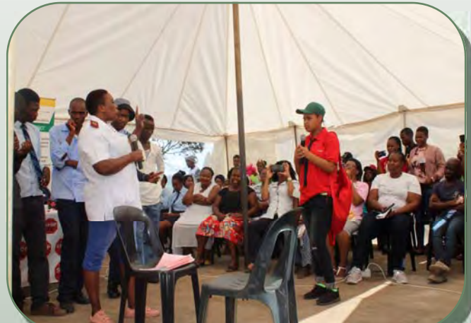
AYFS Club performing a stage play about Youth issues