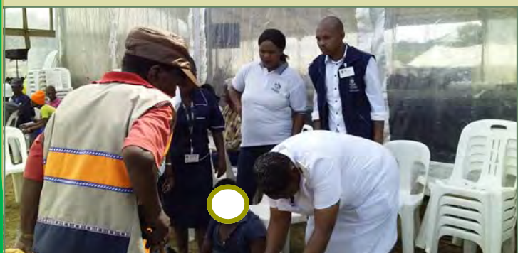
Ndwedwe CHC Staff resuscitating and attendee to the event