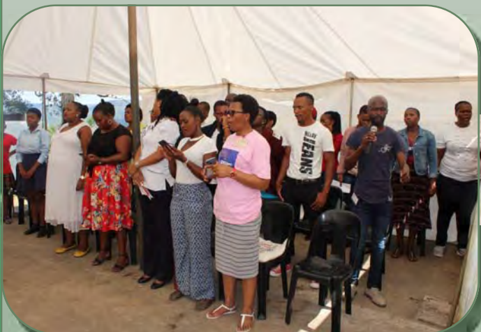
Ilembe District staff was part of the program