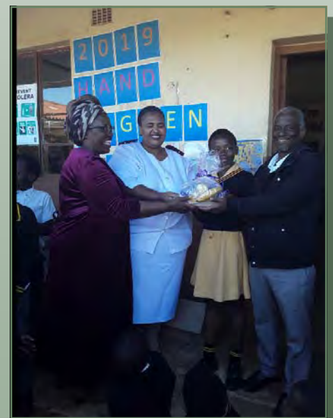
A Learner was given a gift hamper after demonstrating hand wash