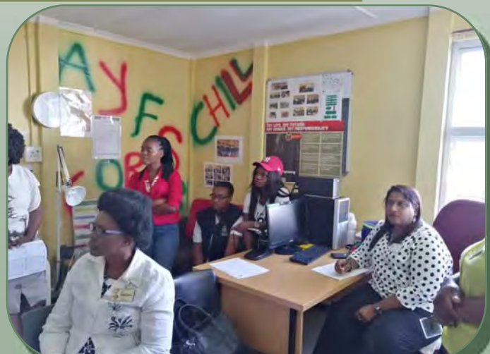
Ilembe District staff benchmarked on the success of AYFS