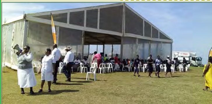
Sr Zikhali informing the public about TB