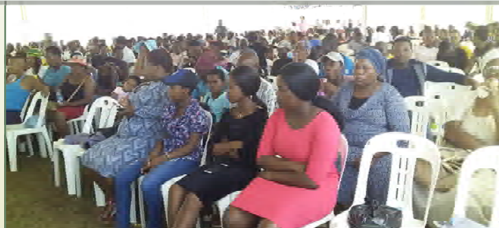
The community came in a remarkable number to attend the event

The community of Ndwedwe came in a good number to attend the event. On the day condoms were distributed, information pamphlets was distributed to members of the community. The day was very sunny but the community came to experience to see and hear from their leaders on new development they had to offer to them. Due to the sunny and humid weather on the day one of the community member collapsed; thanks to Ndwedwe CHC nursing team who responded very swiftly and resuscitated the community member. He was then taken to the clinic for further examination and treatment.