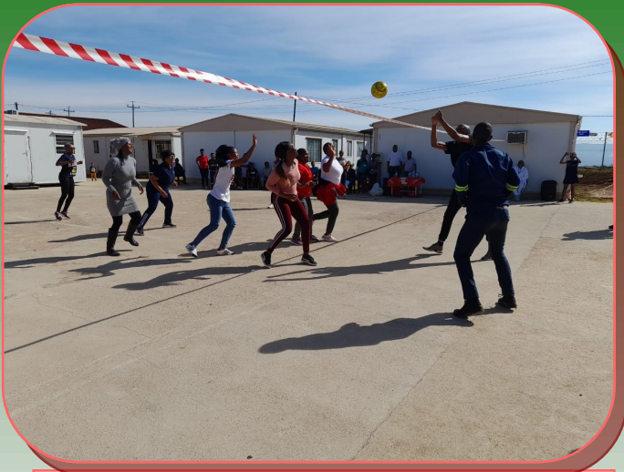
VOLLEY BALL GAME MALES VS FEMALES.