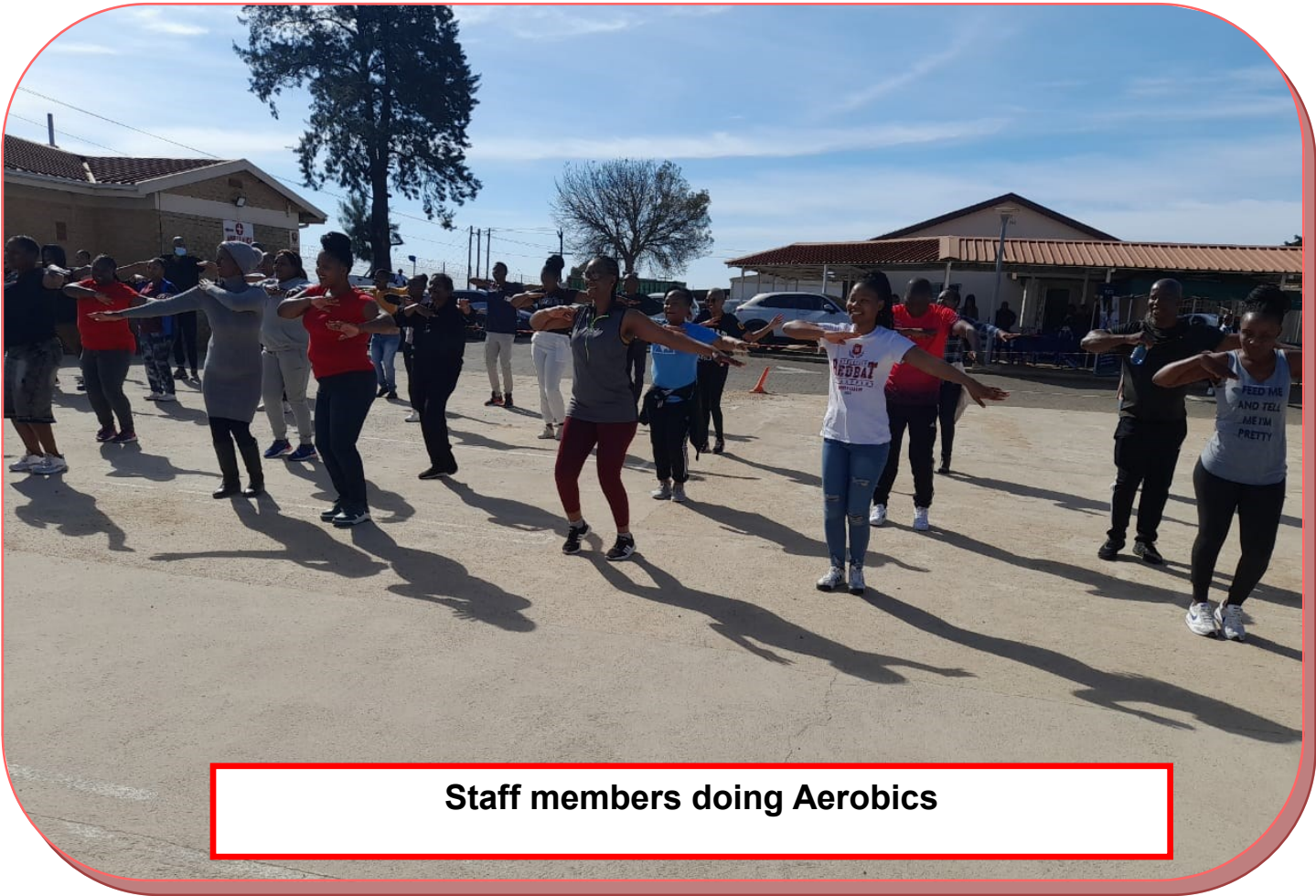
Staff members doing Aerobics

Wellness programs encourage employees to eat healthy foods and exercise which will help in reducing the risk of long-term health illness. A wellness program can have a positive impact on the team's mental health and serve as a team building effort. On the 7th July 2023, Ndwedwe CHC events team organised a wellness day program. The program was held within the facility and all departments participated on the activities of the day.