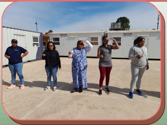
EGG AND SPOON RACE.