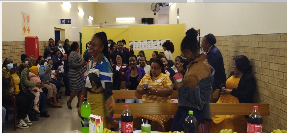
Attendees of the event