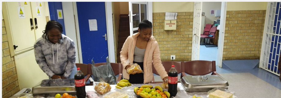
HR in-service trainees setting up