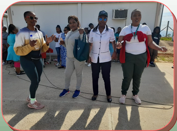
WINNERS OF THE EGG AND SPOON RACE.