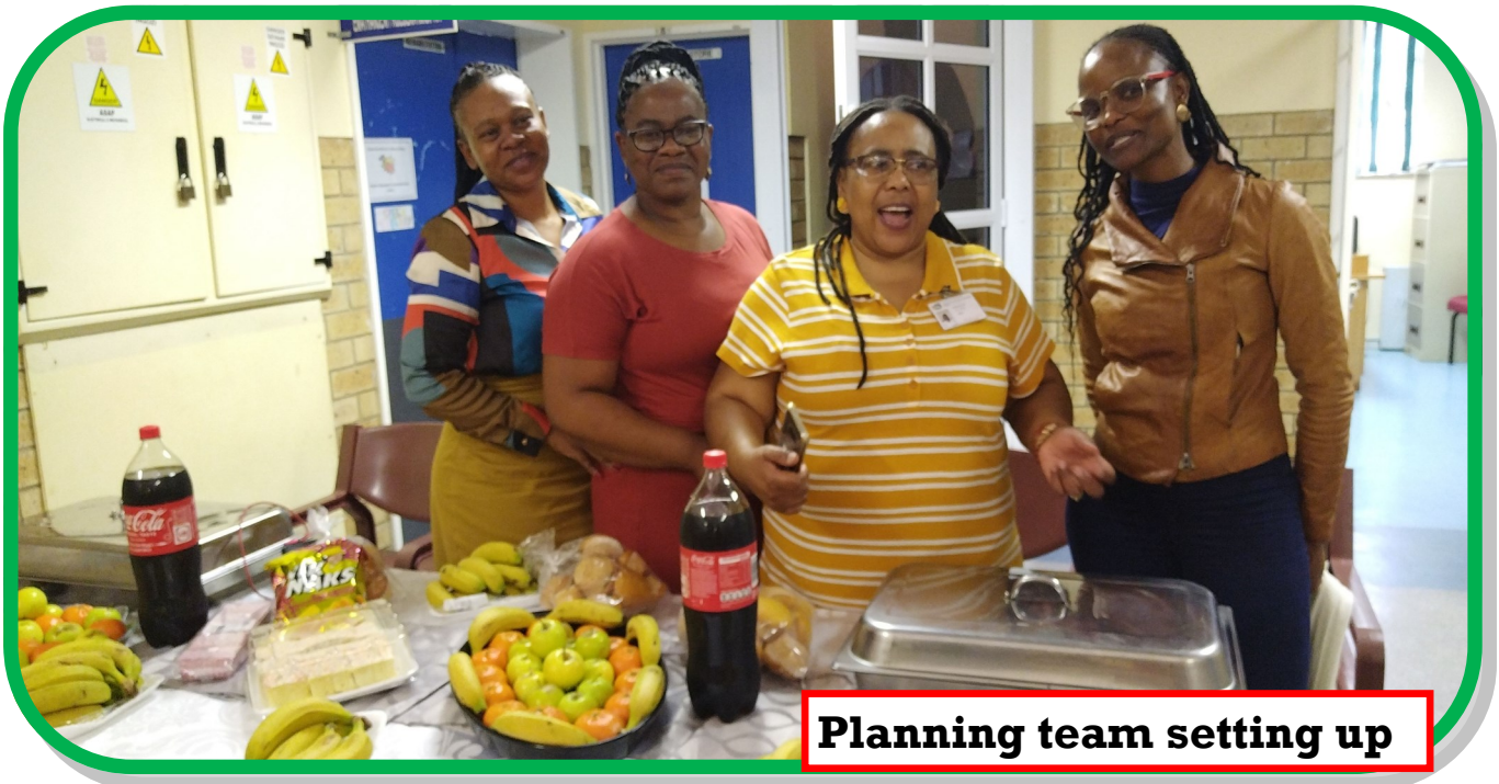
Planning team setting up

Women's Day marks the anniversary of the great women's march which took place on the 9th August 1956, where about 20 000 women marched to the Union Buildings in Pretoria to protest against legislation aimed at tightening the apartheid government's control over the movement of black women in urban areas. In celebrating this remarkable month to honor women , Ndwedwe CHC organizing committee planned and hosted a "Women's Day High Tea" event which was held on the 18th August 2023 within the facility and all departments contributed towards refreshments for the events success.