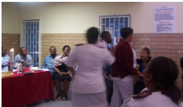
LEFT: CCMT department performed a role play for entertainment. The role play highlighted staff attitude and the implementation of Batho Pele Principles within the workplace.