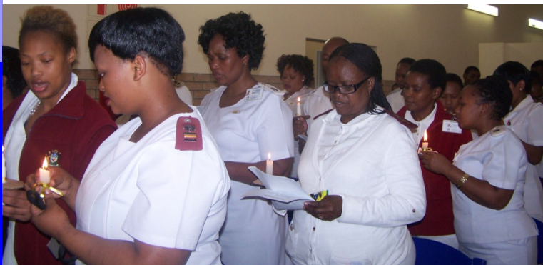
ABOVE: Nursing staff of Ndwedwe CHC lit their candles and read their pledge