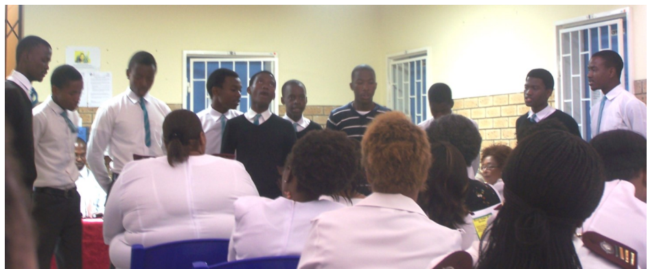
RIGHT: Nombika High School Boys Choir for entertainment