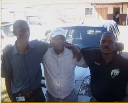
Department of Transport ALU- FAKWA LUBUYA NODAKA.