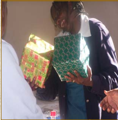
uCebe eshaya adumengazo emcimbini iKitchen Party yezintombi zaseMobile ezazilungiselela uku-shada.