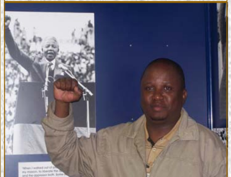
UmKhabela phela naye uthi izwe likhu- lulekile nje ingoba basilwela.