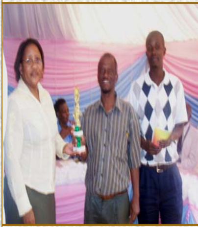
iEnvironmental Health iyona eyadla umhlanganiso itafula labo lawina.