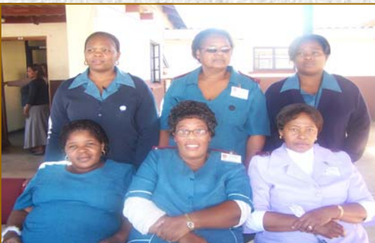
Some of Mobile staff members.

A big thank you goes out to all the Social Committee people who made this event a success, to all staff members for co operating, management for the support and above all to all sponsors who made this event an enjoyable one. THANK YOU ALL.