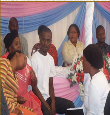
Onompilo bedlala umdlalo weshashalazi ngosuku lwe Open Day.