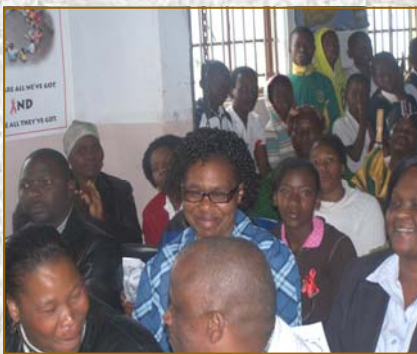
Kwakugcwele kuchichima abadla nabancane

Ndwedwe CHC also took part and joined Mayika Primary School in an awareness campaign for learners and the community on 1 December 2009. Talks were given regarding the HIV/AIDS pandemic, condoms were handed out but the main message of the day to the youth was to ABSTAIN, pictures always tell a clear story.