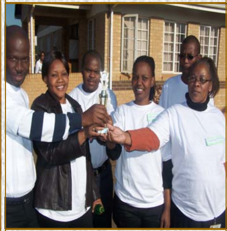
HR Department yalala isibili kowetafula elihhayo.