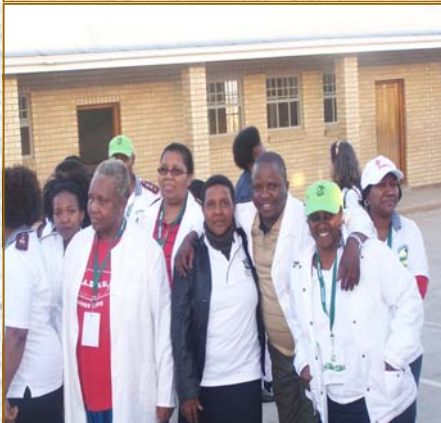
Kwakumnandi kudelile kwelase East- ern Cape.