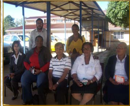
ARK team at the Open Day