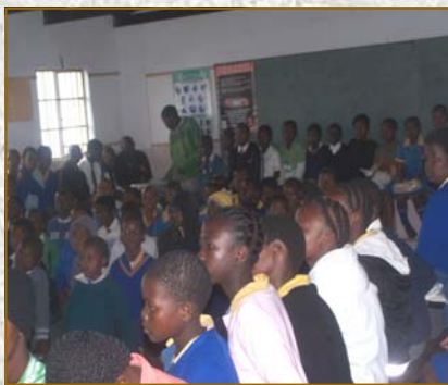
Nezingane zesikole zazikhona zilalele iziyalo.