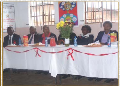
Izikhulu ezazivela kwiminyango eyahlukene.