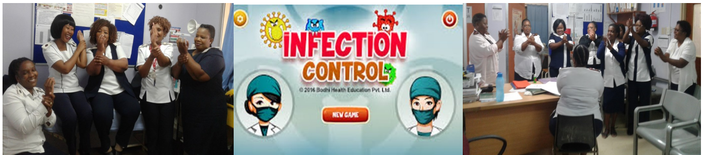
From left to right: GOPD staff members demonstrating their hand washing. Right: Maternity staff members demonstrating their hand washing