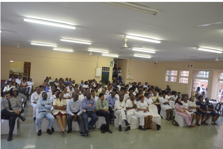
Attendants at the staff residential hall listening to the programme