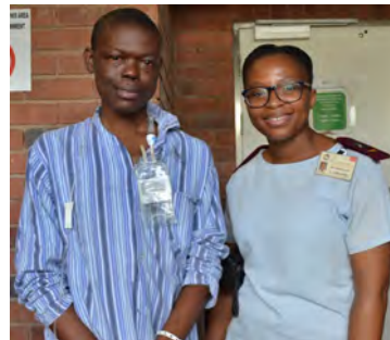
READ MORE ON PAGE 05 WORLD WIDE KIDNEY AWARENESS DAY