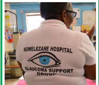
READ MORE ON PAGE 06 GLAUCOMA AWARENESS