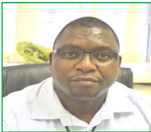
READ MORE ON PAGE 02 REMARKS OF THE CEO