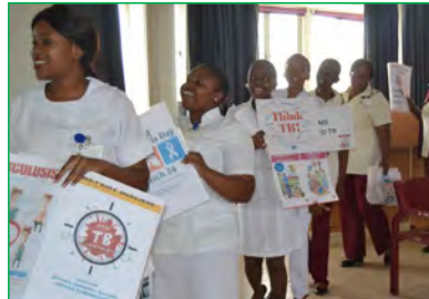
READ MORE ON PAGE 03-04 TB AWARENESS CAMPAIGN