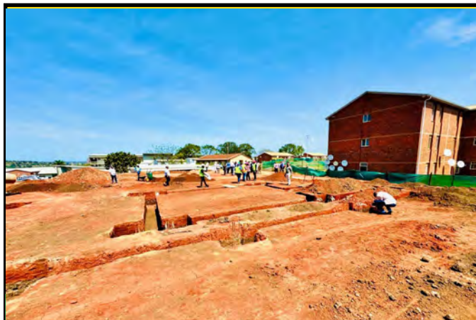
Orthotic centre site as the construction continues