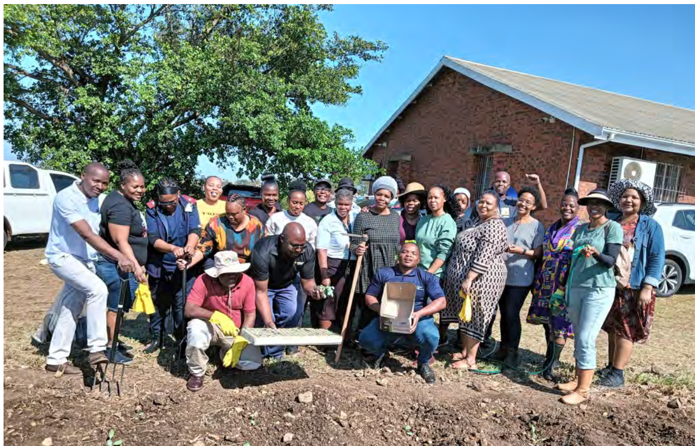
Ngwelezana hospital staff during practical work of the training

A griculture play a central role in addressing food security and providing nutritional supplements that are need by a human body.