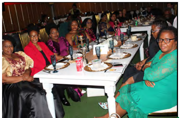
Esteemed guest enjoying the event