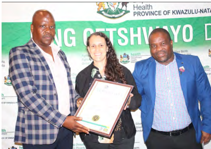
Dietician receiving award from Systems & HR Mx