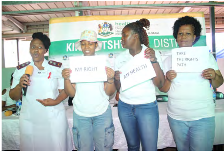
Hast manager presenting world Aids day Slogan

W orld Aids Day is commemorated globally on the 1 st December annually.