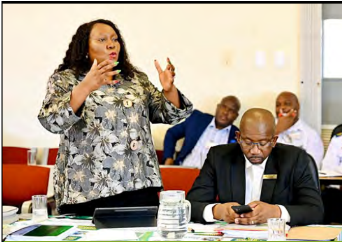
MEC for Health briefing CEO's