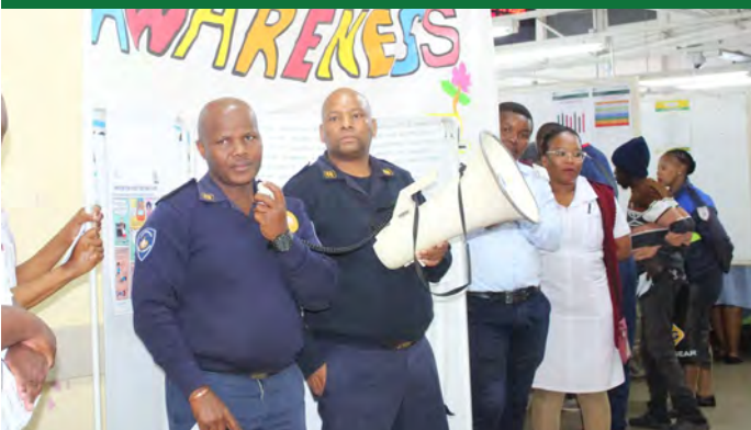
Empangeni Fire fighters giving fire awareness to the community.

On the 23th of July 2024, burns unit held a successful burns awareness campaign at Ngwelezana Hospital outpatient department.