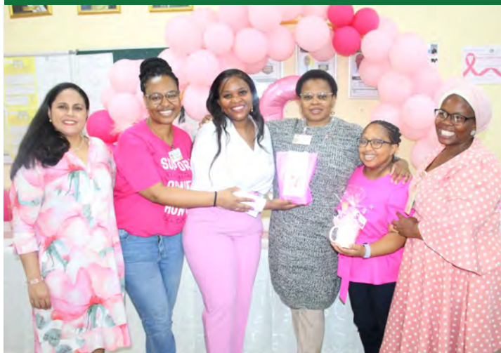
Radiology , Oncology, Surgery department team