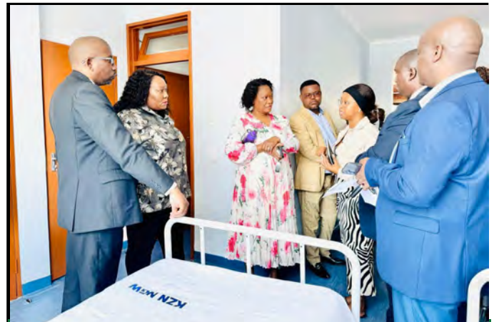
Nakekela repartition centre briefing