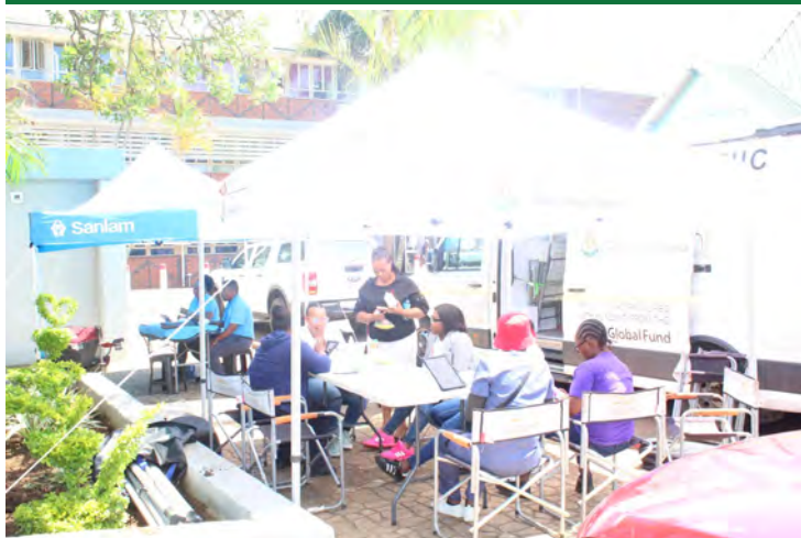
Staff members waiting for services rendered during the event

A role play by wellness clinic team demonstrated the importance of regular testing of HIV/ Aids and adherence to treatment for people to live longer.