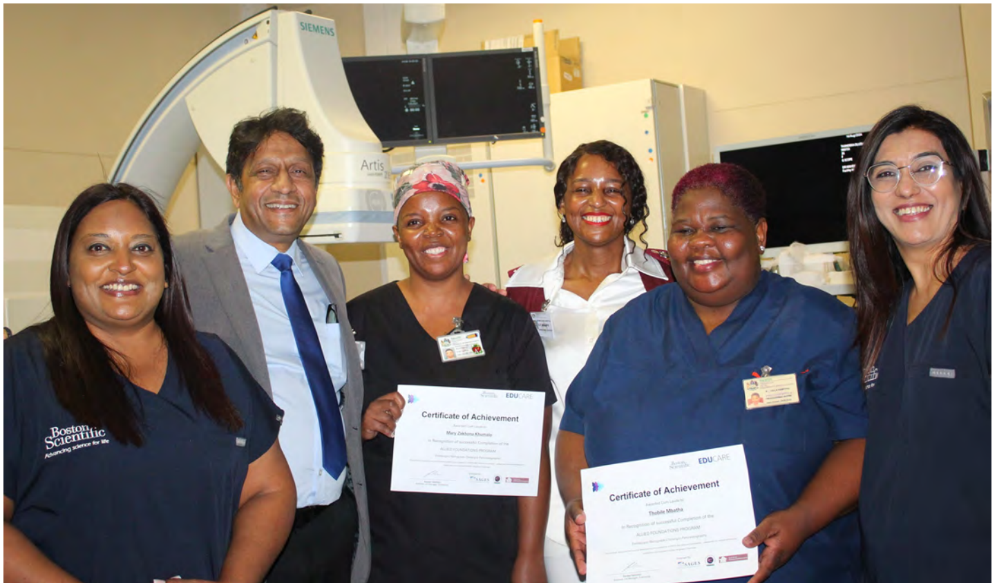
Ngwelezana hospital surgery HOD, Theatre nurses and Boston Scientific trainers

N gwelezana Tertiary Hospital is rapidly advancing its medical services as it continues to develop into a fully-fledged tertiary hospital.