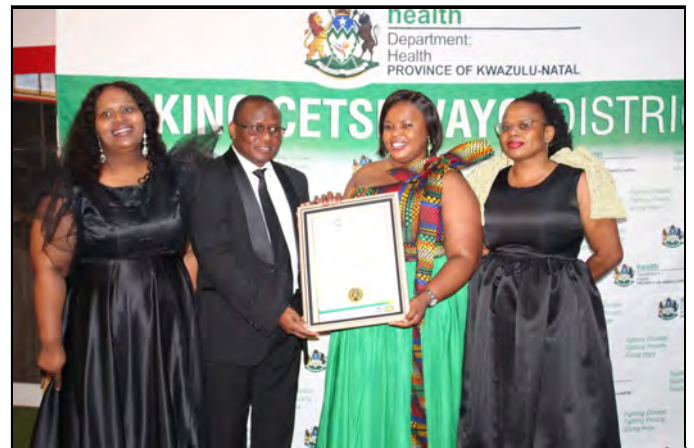
Finance & M&E handing certificate to PHC