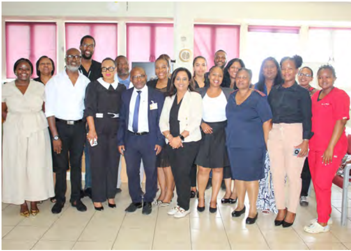
Ngwelezana hospital Doctors & Empangeni cluster Prosecutors

N gwelezana hospital hosted a successful 1st panel of discussions with National Prosecuting Authority (NPA) Empangeni on the 05th of December 2024.