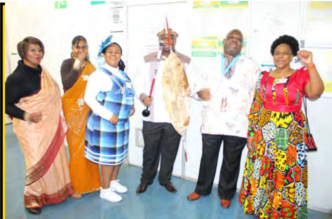
Management leading by example