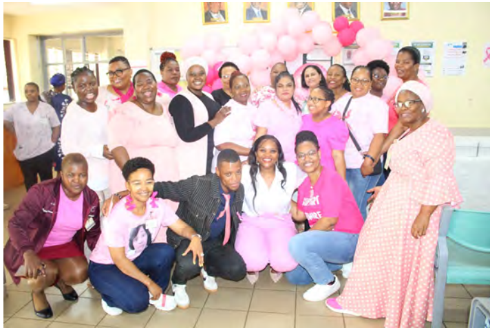
Staff members who participated in Breast Cancer Awareness campaign

B reast cancer is a disease in which abnormal breast cells grow out of control and form tumors, if left unchecked, the tumors can spread throughout the body and become fatal. Treatment is based on the person, the type of cancer and its spread. The treatment combines surgery, radiation therapy and medicines.