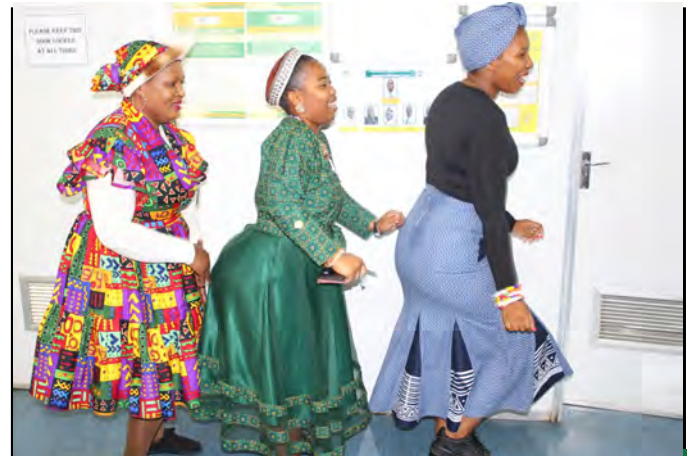
Staff members dancing