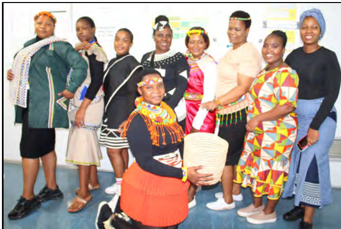
Patient Admin staff and wellness Clinic staff