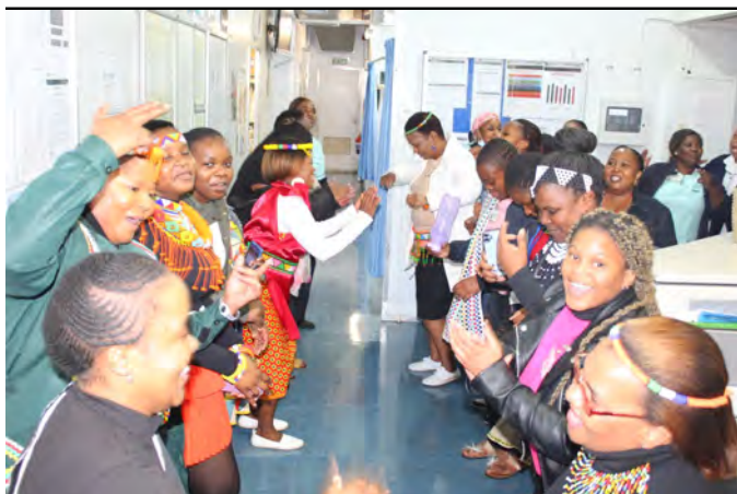
Staff members singing traditional songs