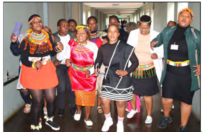
Staff members singing traditional songs