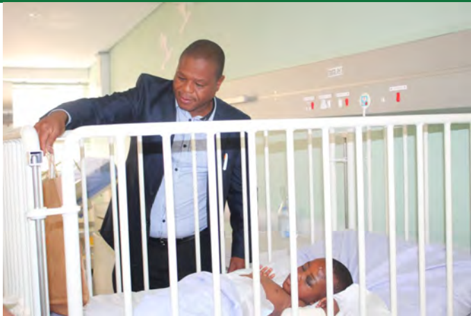
Smith & Nephew representative giving patients gifts