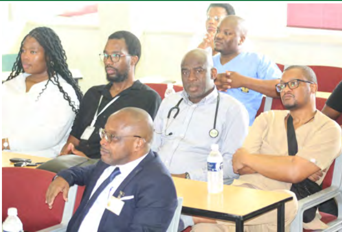
Doctors listening attentively to presentations

Her presentation was followed by a question and answer session. She introduced all regional court prosecutors present in the meeting. Engagement between prosecutors and the doctors occurred on concerns, challenges on completion of J88, witnessing and terminologies. Good practices were shared by the doctors on how to fill in J88.