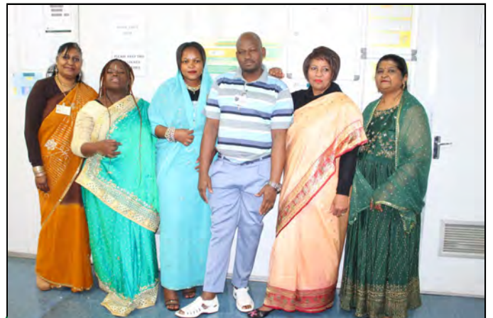
Cultural diversity in action