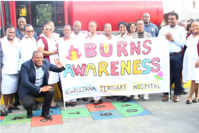
Burns unit team , fire department and Smith & Nephew team outside Peads Burns Unit.