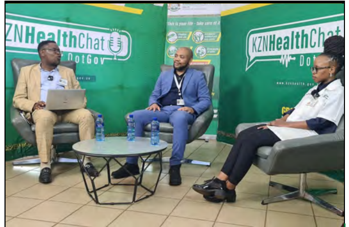
KZN Health chat broadcasting