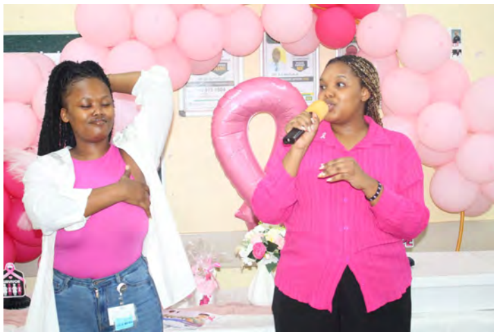
Radiographers demonstrating breast examination

Psycho – social support is crucial for all patients diagnosed with cancer.