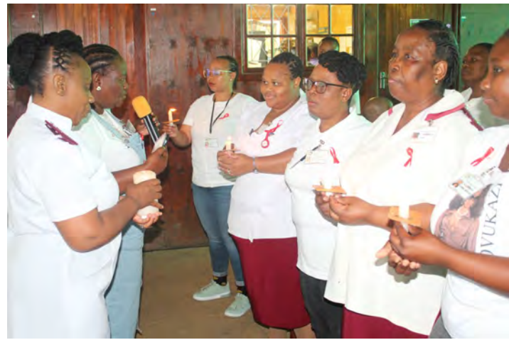
Lighting of candles to remember the fallen solders

She further stated that" the intersection of TB and HIV is a critical area of concern. People living with HIV are 20-30 times more likely to develop TB. TB, in turn, accelerates HIV progression. To combat this deadly synergy, we must integrate TB and HIV services. This includes routine HIV testing for TB patients, cotrimoxazole preventive therapy, and antiretroviral therapy (ART) initiation for TB-HIV co-infected individuals. "All staff members were requested to recommit themselves to the following actions: