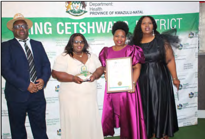
Isiboniso Clinic O/M receiving certificate of achievement