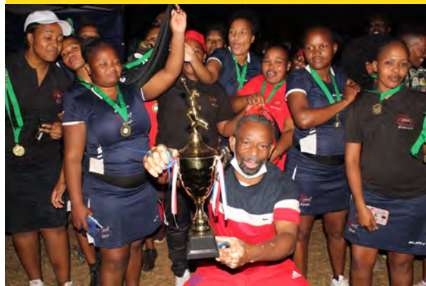
Myaluza Security Netball Team

ealthy mind in a healthy body is equally to productive employee. Work and play is encouraged in the workplace because it yield positive results.