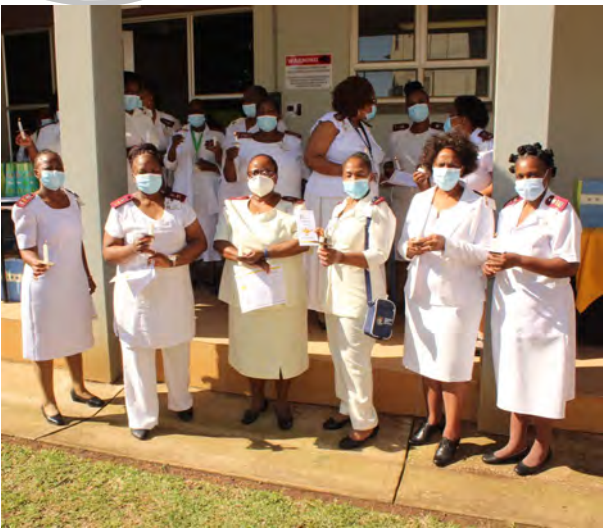
Nursing management during the event