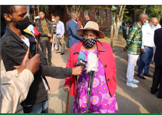
Elderly citizen motivating others to be vaccinated