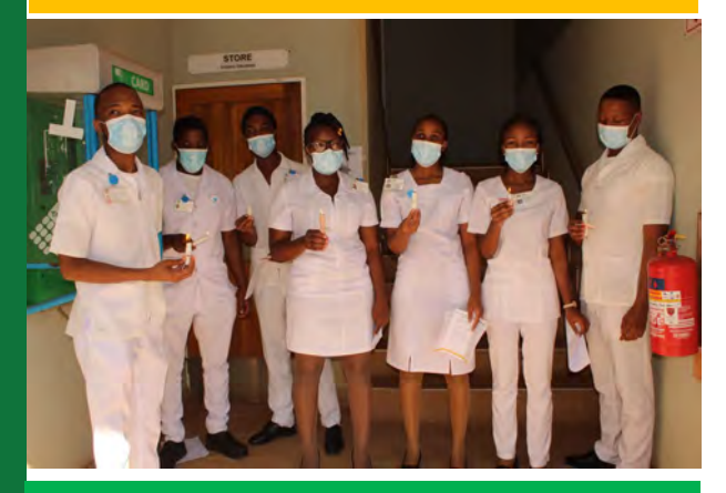
Student nurses saying the Nurses pledge