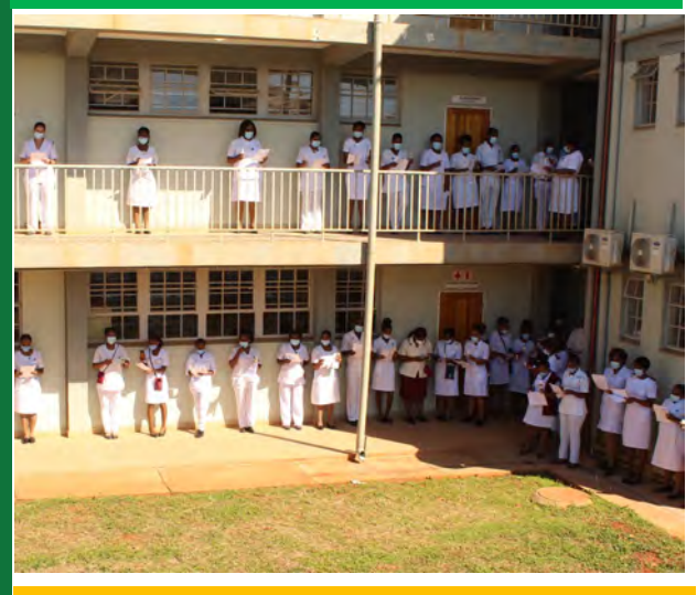
Nurses who attended Nursing day

urse's Day was commemorated on the 12 of May 2021 at the Ngwelezana Nursing College. The theme of the day was "A voice to lead- A vision for the future health care".