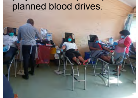
Ngwelezana staff donating blood

is also rewarding because you get to receive free check up of your body functions, your blood pressure, body temperature, heart rate, hemoglobin/ iron levels. We kindly encourage all employees to participate in