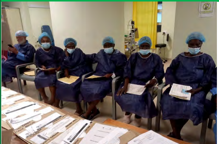
Patients waiting for cataract surgery

C ataract is the one of the 1st top ten disease affecting the community worldwide daily, if it is not attended or treated early it can lead to permanent blindness.