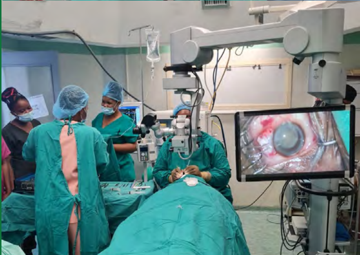
Ophthalmologists and the team during cataract surgery