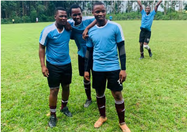
Team celebrating the goal

A healthy mind in a healthy body produce a productive employee.