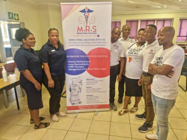
Internal Medicine and Mabika Renal Solutions Team