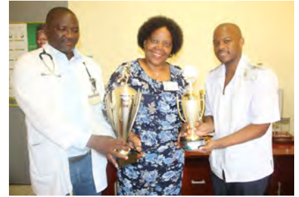
Trophy hand over to the CEO.....