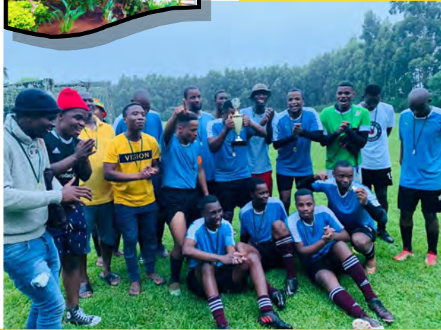
Ngwelezana Team celebrating the victory at Eshowe tournament