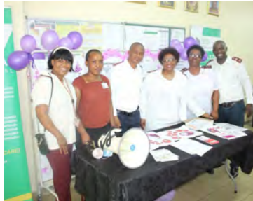
International Epilepsy day.....