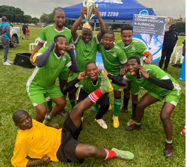
Ngwelezana Team celebrating victory at People