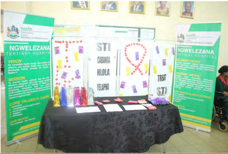
STI/Condom Information desk stall

In an effort to encourage individuals to make informed choices about their sexual health, Ngwelezana Tertiary Hospital commemorated STI/Condom week on the 15 February 2023 at Out Patient Department.