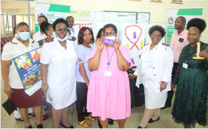
HAST Team during STI/Condom week commemoration

S exually Transmitted Infection (STI's) remains a big problem in South Africa , even thou most of the infections can be cured.