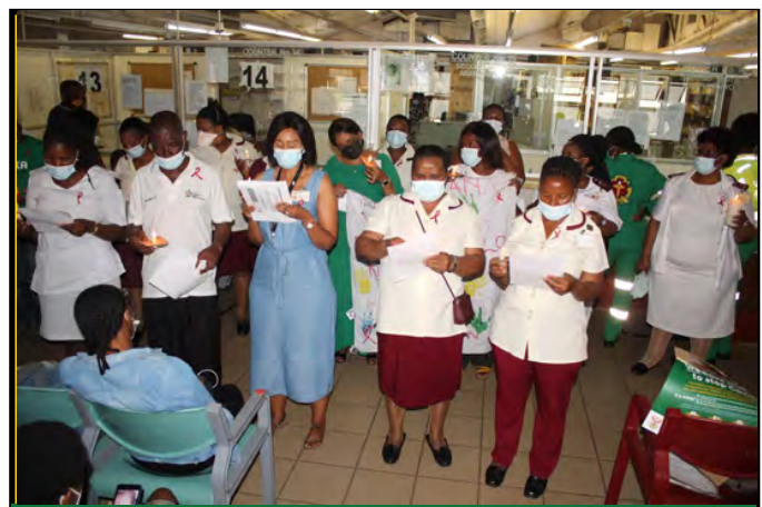
Staff lighting candles to remember those who died because of AIDS