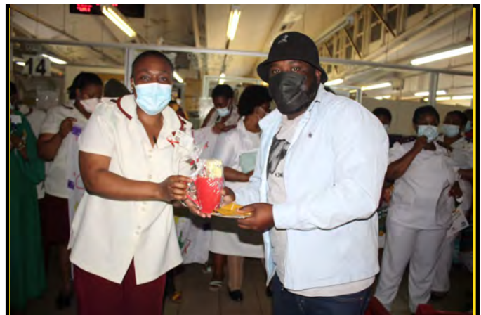
Patients receiving tokens for answering questions