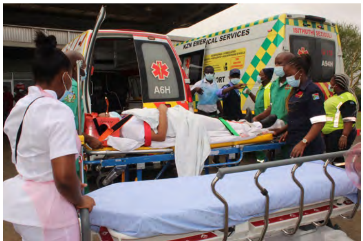
Critical patient arriving at EMU