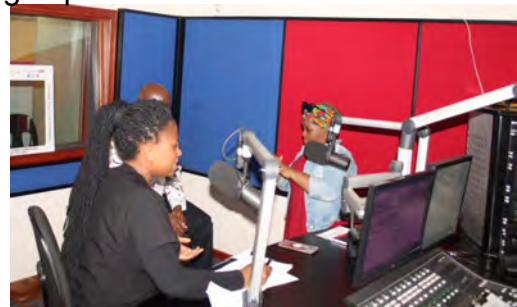
Ms Mpanza during a radio slot at ICORA FM educating the community about deaf culture. (May her lovely soul rest in peace)

Moreover to make sure that the measures used will not only be limited to individual initiatives but to the whole community. Staff members were educated about accommodation processes to utilize, to ensure inclusivity of persons with hearing impairments.