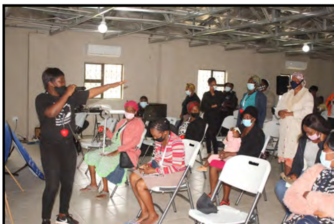
Official keeping the community entertained