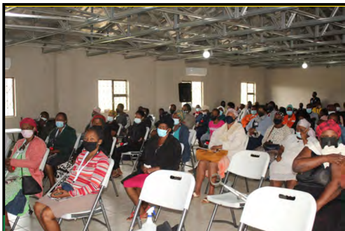
Community listening to speeches during the event