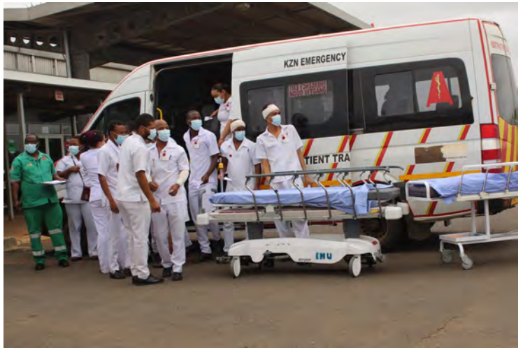
Minor injuries patients arriving at EMU

Special gratitude was forwarded to all stakeholders who participated during the drill.