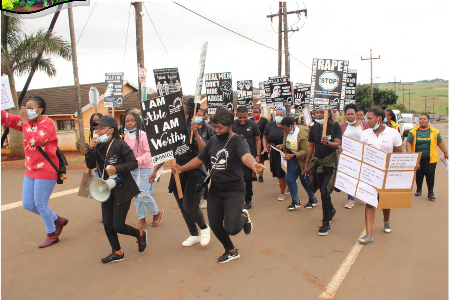
Staff giving messages related to 16 day of activism to uMhlatuze village community