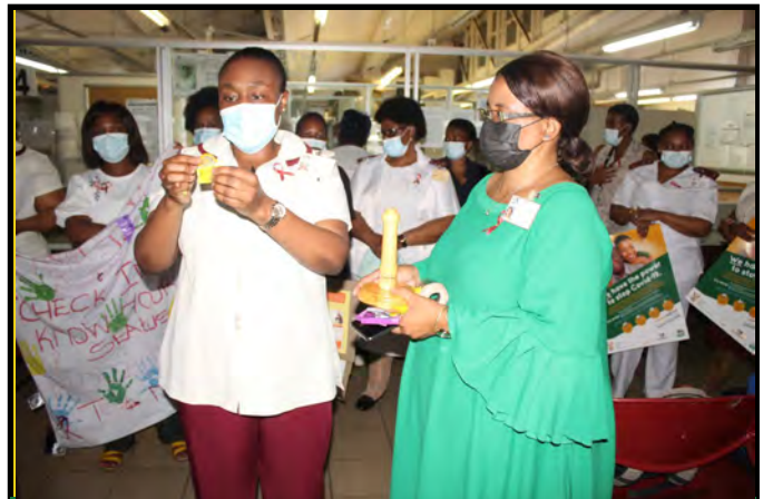
Inserting of the male condom demonstration