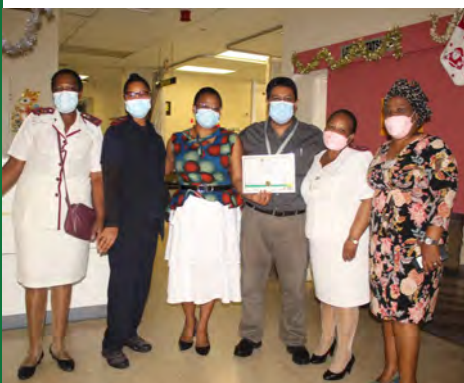
1st position EMERGENCY UNIT

Christmas season is always a fun and exciting time. Ngwelezana Tertiary Hospital ran the best Christmas decoration competition. Departments were requested to decorate their departments and assessments were done on the 23rd of December to choose the best Christmas decoration.