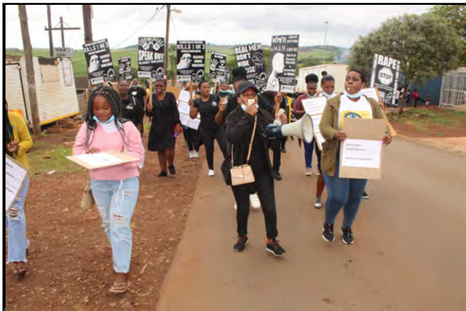
Official & the community walking to the event venue