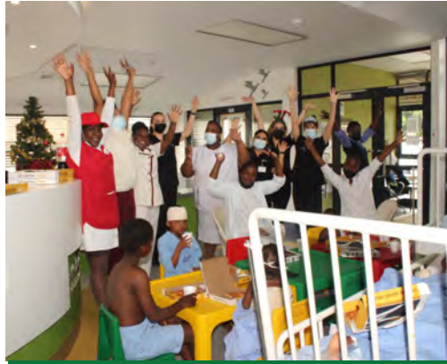
Peads burns team and parents during Christmas party

It was a fun filled day for kids in Pediatric Burns Unit at Ngwelezana Tertiary Hospital as the team prepared a Christmas party for them since they could not be home to celebrate the festive season with their families.