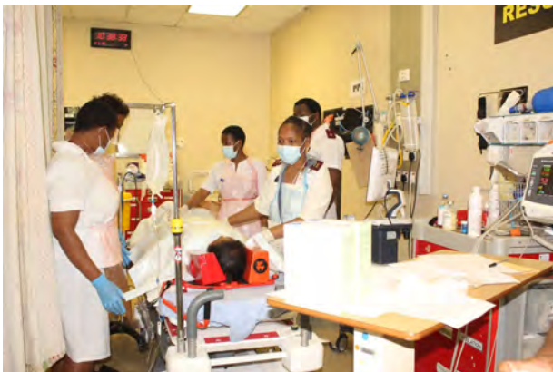
Medical staff attending to the patient