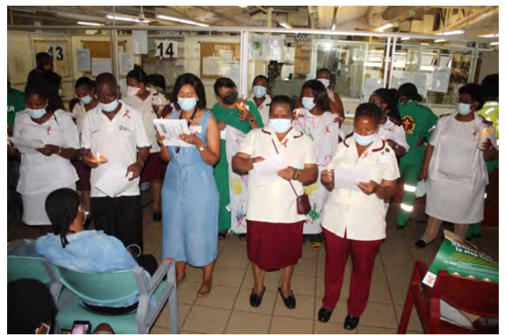
Nurses the candle lighting at OPD

The HAST team visited OPD where candle lighting was done as a symbol of remembering those who have died because of HIV/AIDS.