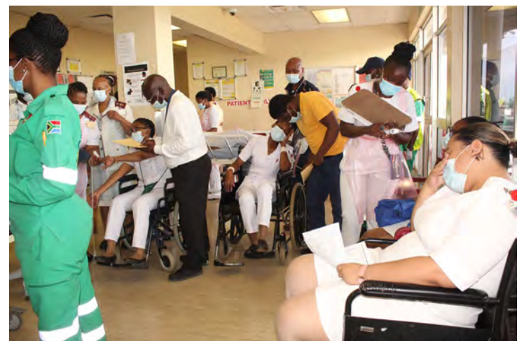
Minor injuries patients been attended