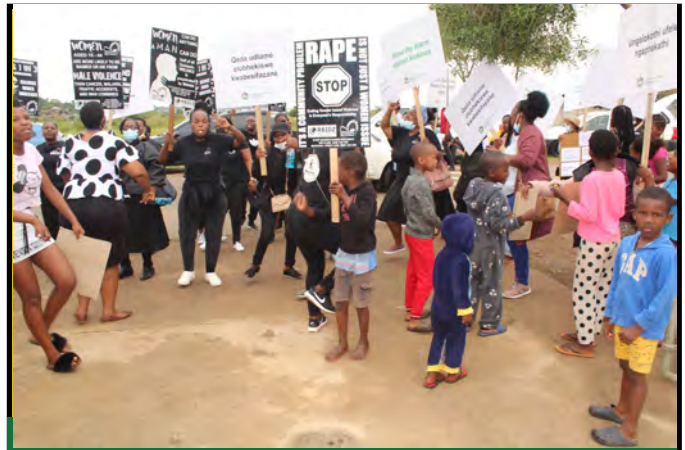
Officials & community marching against women & children abuse