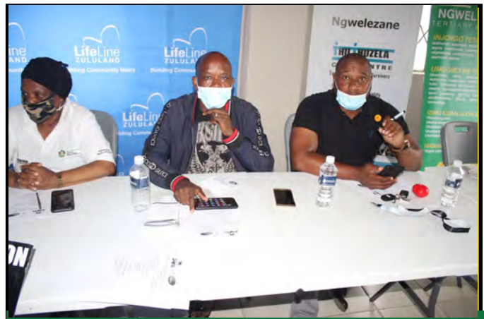
Ward 9 community leadership led by Cllr Mdaka