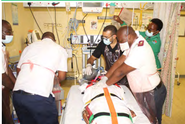
Patient being resuscitated