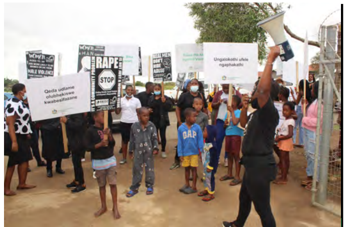
Giving community massages against women & child abuse