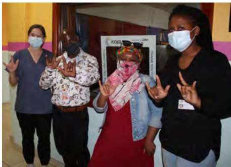
DEAF CULTURE AWARENESS