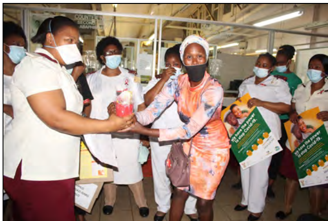
Patients receiving tokens for answering questions