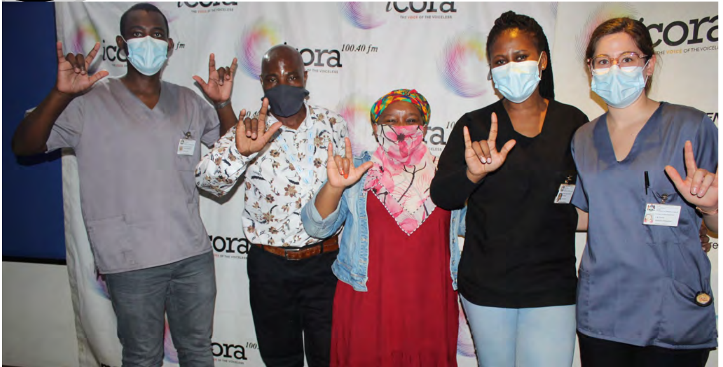
Audiologist & Speech Therapist team with deaf community activist

N ational Month of Deaf or Deaf Awareness Week also known worldwide as International week of the Deaf is an initiative of the World Federation of the Deaf (WFD). It is celebrated on the last full week of September and is celebrated through various awareness activities worldwide.