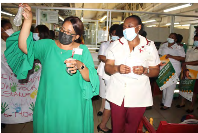
Inserting of female condom demonstration