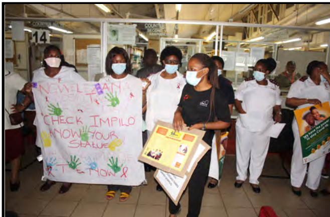
Speech from Zululand Life line official during the event