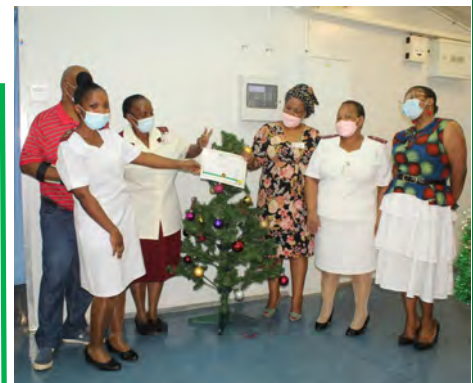
3rd position RENAL UNIT