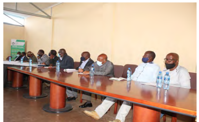
Dube Traditional Council Committee –Izinduna