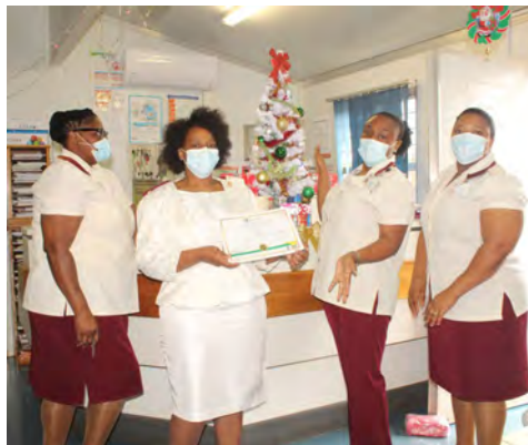
2nd position T.B CLINIC