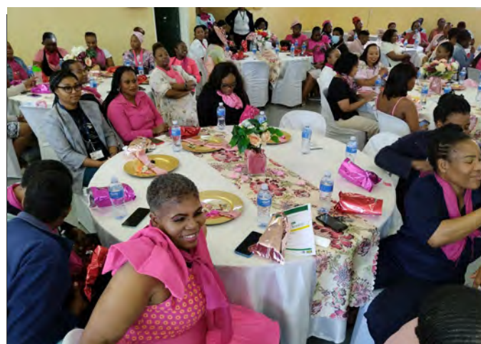
Staff members enjoying the event