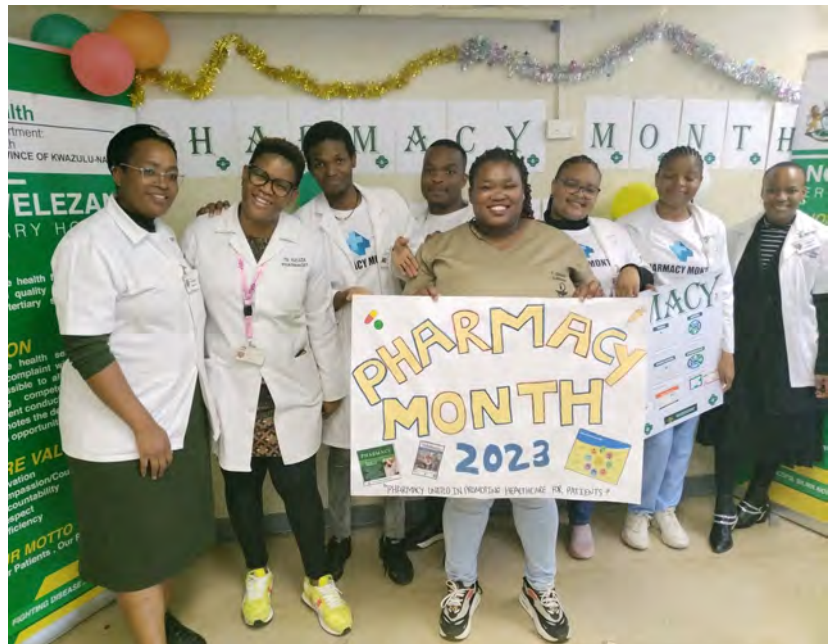
PHARMACY STAFF DURING PHARMY MONTH COMMEMORATION

All staff members are encouraged to support the initiative by donating the box of school shoes before the end of October 2023.