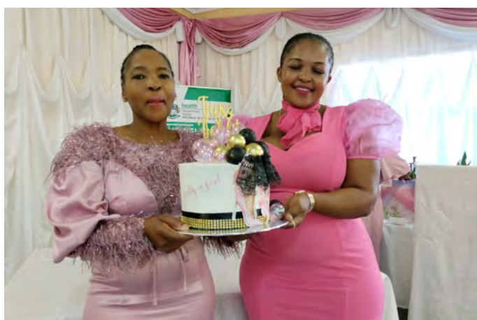
Best dressed winners receiving the cake