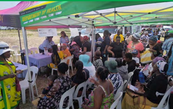
Ngwelezana staff rendering services to the community

The community attended the program in numbers despite the unbearably hot weather conditions. The local leadership expressed gratitude to department of Health for bringing health services to their community.