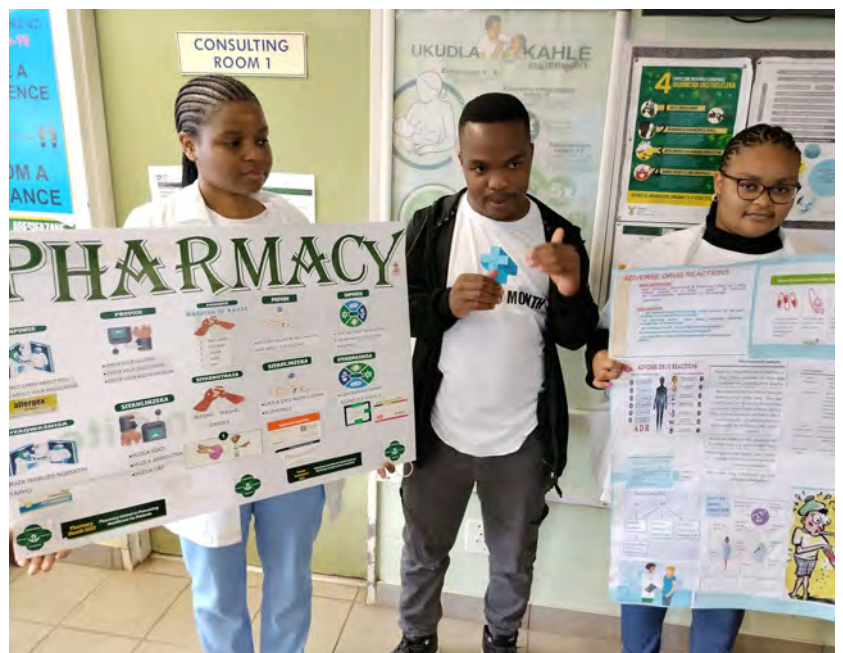
MR. ZULU GIVING HEALTH EDUCATION AT FMD OUTPATIENT