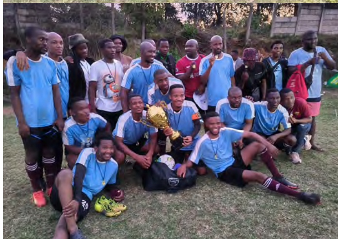
Soccer team crowned 2023 KCD Champions

K ing Cesthwayo District hosted a successful sports day at Eshowe town despite some challenges faced prior to the event.