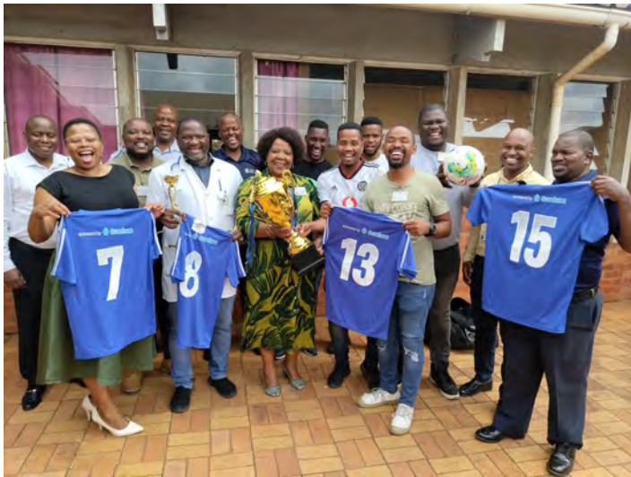
Soccer team handing over trophies and soccer kit to EXCO