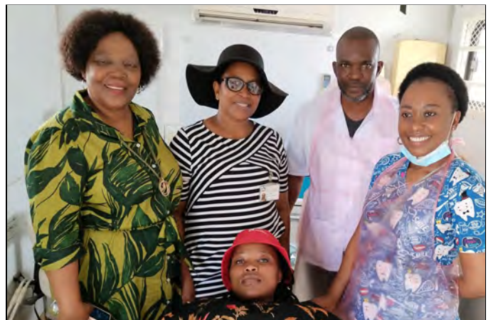
Management visiting dental mobile bus