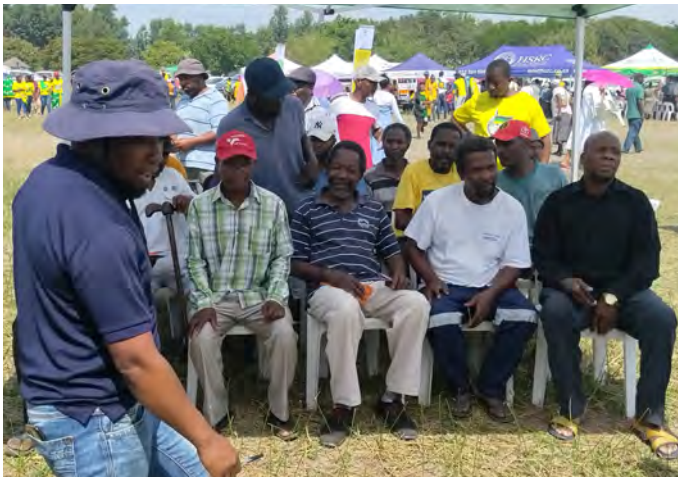
Mens Clinic waiting area