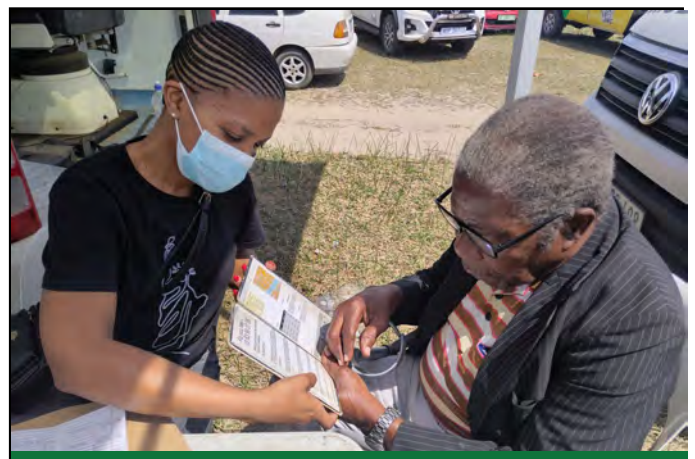
Patient reading after being give spectacles