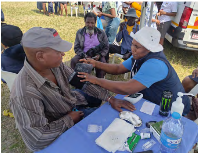
Client taking BP during isibhedlela kubantu