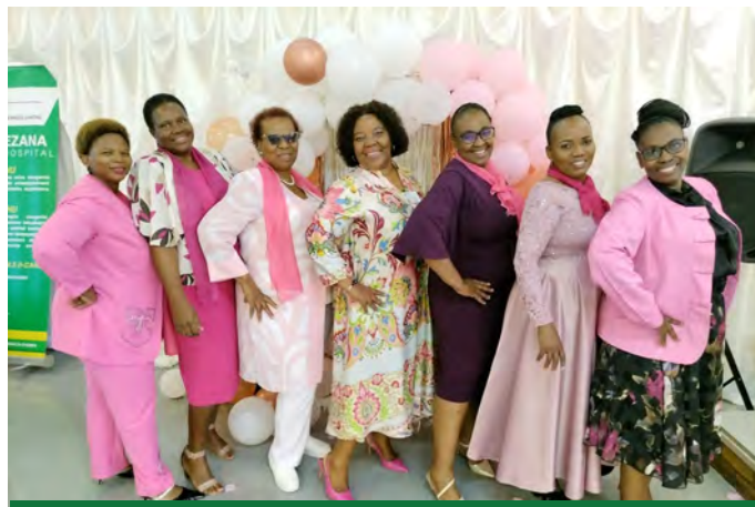
Imbokodo during women's day photo shoot