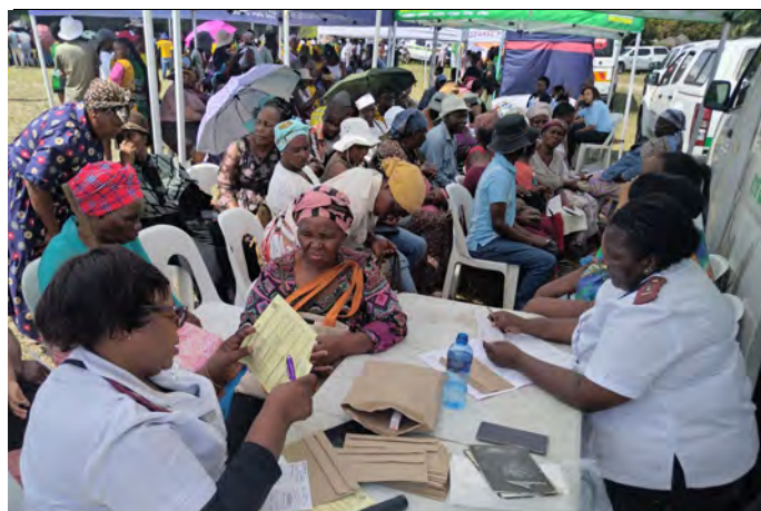
Vital sign station