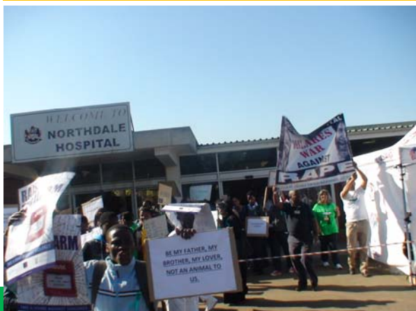
Left: Patients from the hospital participating in the march.

They were captured saying “ Phansi ngama blesser Phansi “