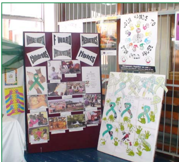
Poster and Pamphlet exhibition that was displayed for the whole week.