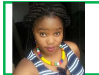
THANDIWE HLELA PHOTOGRAPHER