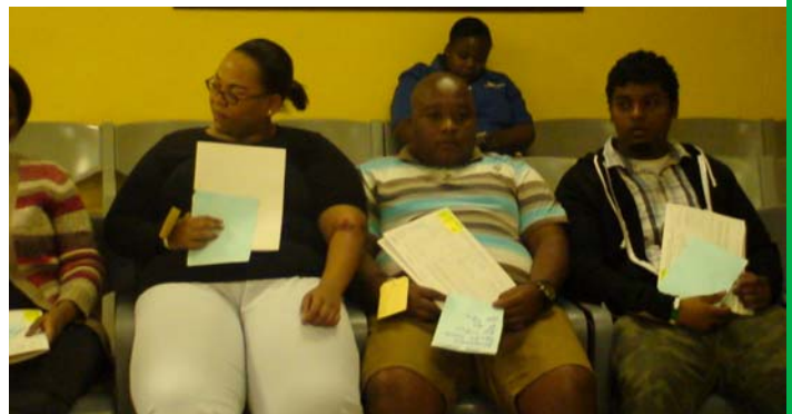
Above: Green code patients waiting to be seen at POPD