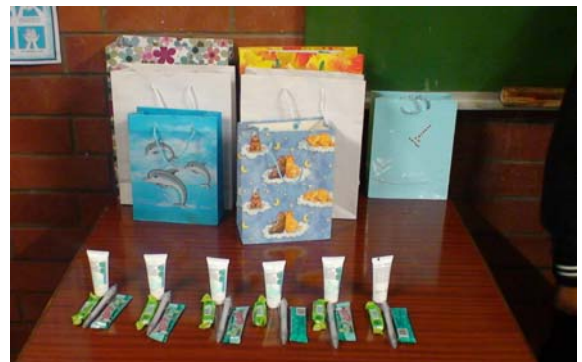
Right: Tokens that were given to the learners as prizes for the poster competition.

Northdale Hospital embarked on a handwashing drive on 1the 0 to 15 October 2016, as part of commemorating Global Handwashing Week. The actual Global Handwashing Day was on 15 October. The theme for this year was: “MAKING HANDWASH A HABIT.”