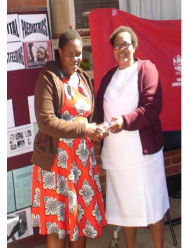
Pregnant mothers also had fun as they were given a chance to dance and entertain others. There were prizes as well that were given to mothers when answering breast feeding related questions well.

O n the 05th of August 2016 Northdale Hospital celebrated International Breast Feeding week. The main aim was to create awareness and emphasize the importance of breast feeding for both mothers and babies.