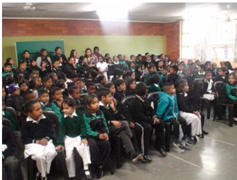
Left: Ridgeview Primary learners who attended lessons on Hand washing