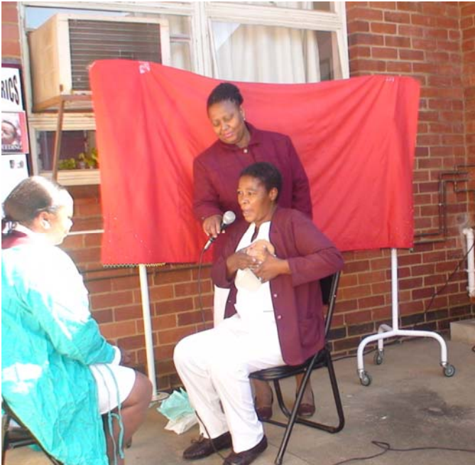
NURSING STAFF DEMONSTRATING WAYS OF EXPRESSING AND PRESERVING BREAST MILK .