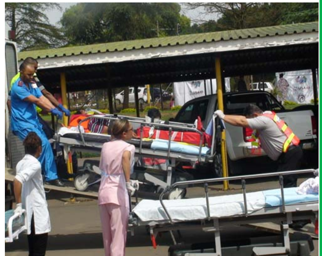
Left: As the bus comes into Ambulance bay area with patients. Right: Patient being carried out of the bus with a stretcher to Casualty.