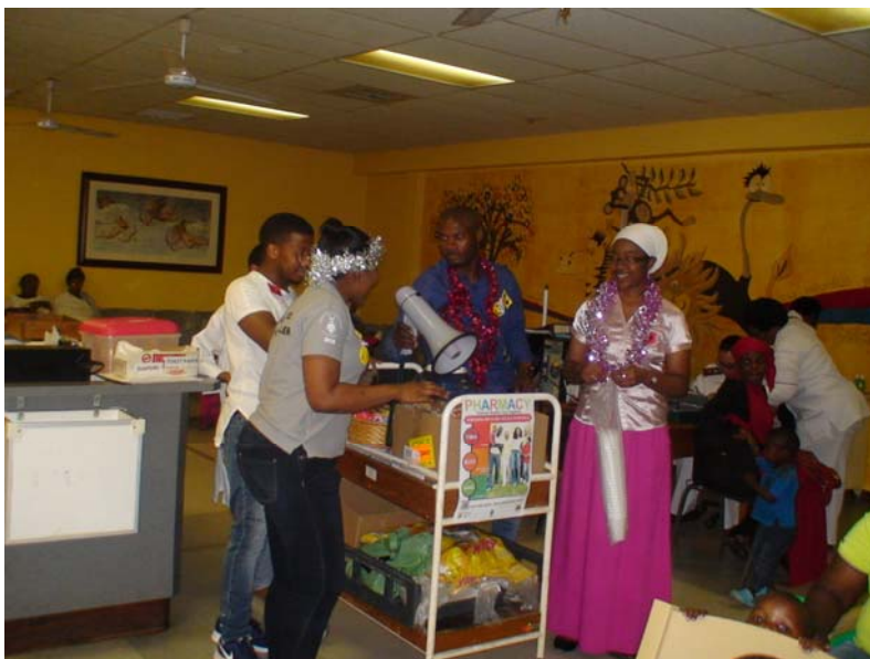
Pharmacy staff as they were distributing Goodie bags to the children in POPD.

On the last day of the week pharmacy staff visited the Paediatric Wards and Pediatrics Out Patient Department. They handed out goodie bags to the sick children. This was a lovely gesture which was enjoyed by all. The goodie bags were donated by the pharmacy team.