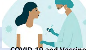
COVID-19 and Vaccine

VIKELA INDODAKAZI YAKHO KUMDLAVUZA WESIBELETHO: YIVUMELE IGOMELE I-HUMAN PAPILLOMAVIRUS (HPV) MANJE!!!