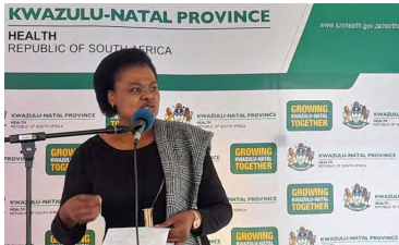
IMBIZO OPEN DAY

FORMER MEMBER OF NATIONAL ASSEMBLY ADDRESSING MEMBERS OF THE MEDIA DURING NORTHDALE HOSPITAL IMBIZO OPEN DAY. FULL STORY IN PAGE 2&3