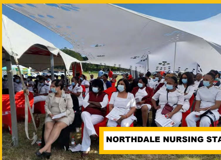
NORTHDAL NURSING STAFF

He concluded that nurses should continue enrolling in their field and developing themselves. They are all appreciated by the department of health.