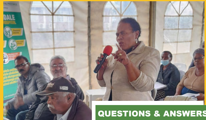
QUESTIONS & ANSWERS SECTION