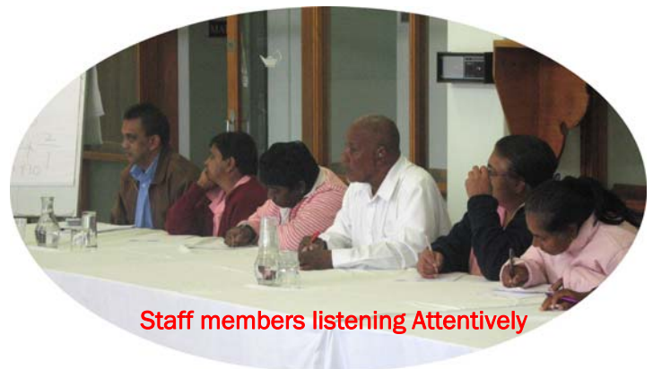
Staff members listening Attentively

We also need to thank our patients for their tolerance and support, working together can and will prove to be beneficial for both patients and staff members.