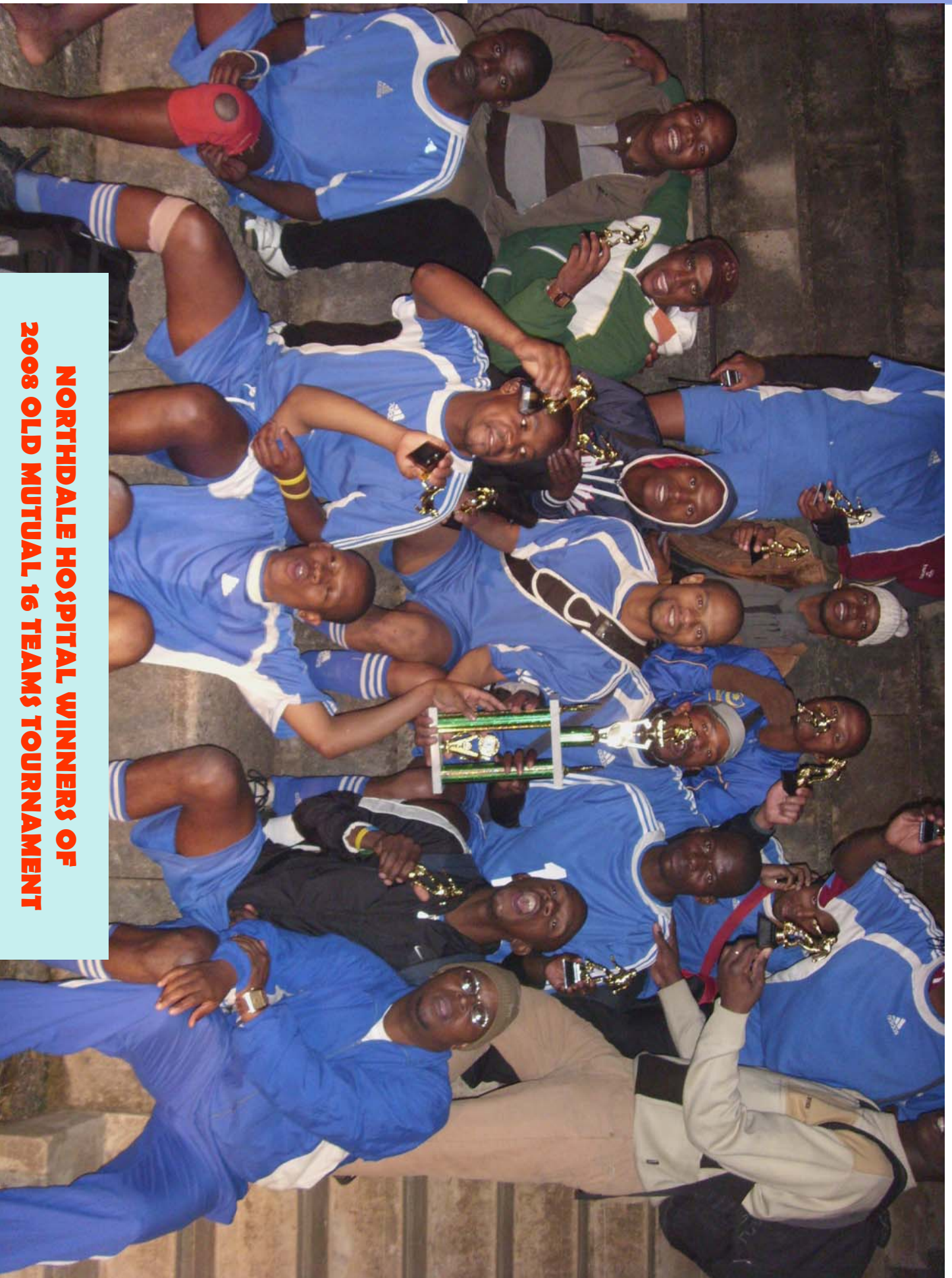
NORTHDALE HOSPITAL WINNERS OF 2008 OLD MUTUAL 16 TEAMS TOURNAMENT