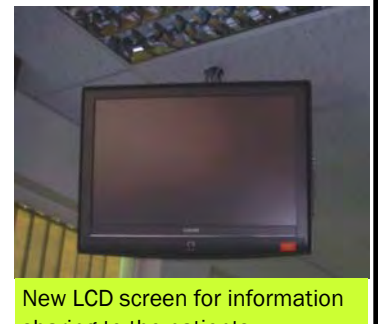
New LCD screen for information sharing to the patients