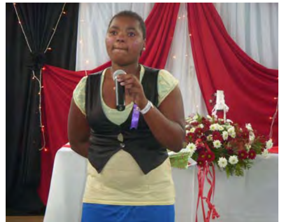
PEOM TO EDUCATE US ABOUT ABUSE