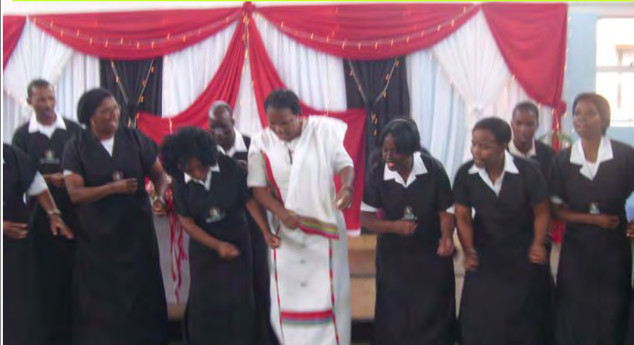
UMPHATHI DISTRICT AKADLALI KANJALO UYAJIKA UMA ITHUBA LI-VUMA.....WAYEYIBIZA PHANSI NE CHIOR YASE NORTHDALE HOSPITAL .....KHANDA PHANS.... KHANDA PHEZULU VUMU VUMA....AYEYE DISTRICT MANAGER YETHU AYEYE