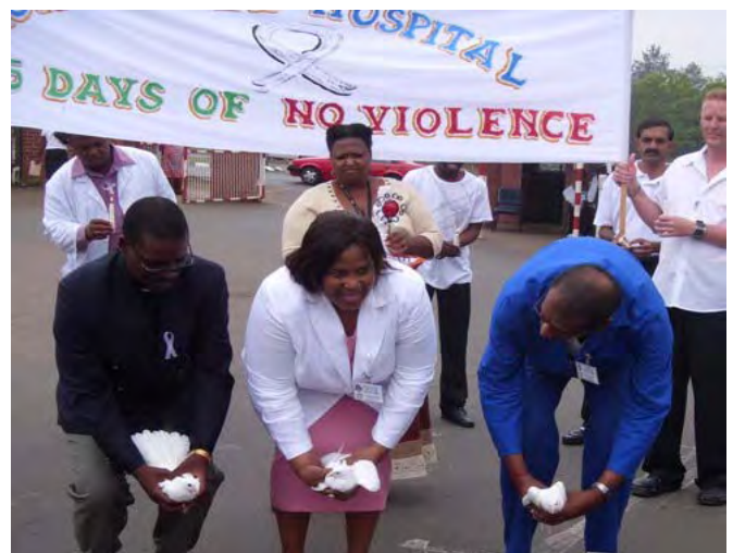
THE RELEASING OF WHITE DOVES AS A SYMBOL OF PEACE

The abuse is rife and real, The silence is deafening.