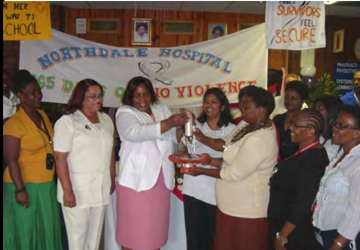
THE OFFICIAL OPENING LAUNCH OF 16 DAYS OF ACTIVISM IN A FORM OF CANDLE LIGHTING CEREMONY

The 25th November to 10 December is observed as a National 16