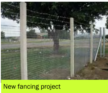
New fencing project

These are some of the few projects that are taking place to lift the image of Northdale Hospital, new fencing all around the Institution, Painting at A ward ( Male Medical Ward ) roofing of the Passage to the Staff residents and new ceiling for the passages, we have also installed information LCD screens to send out information to our service users, these screens are at the Hospital Triage/Sorting area, Main passage, MOPD and Pharmacy Outpatients area, the aim for having such screen is to make it easy for us to communicate easily with our patients and all other service users.