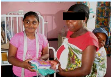
Delited mother receiving a gift for her baby.