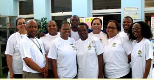
THE TEAM BEHIND THE SUCCESS OF THE EMPLOYEE'S WELLNESS WEEK