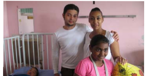
Happy mum and Dad receiving toys for the sleeping little one