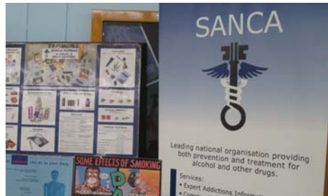
SANCA Information Display