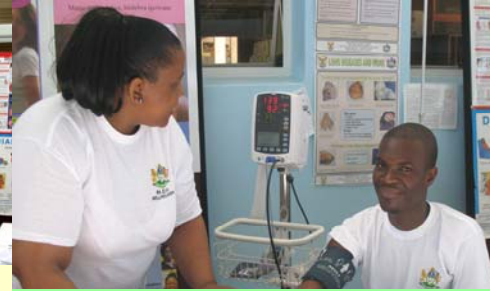
UYATHETHA BANDLA SHAME UMPHATHI, UPHEZULU USHUKELA WE PRO