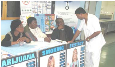
SANCA Crew helping out our Staff member on his questions.