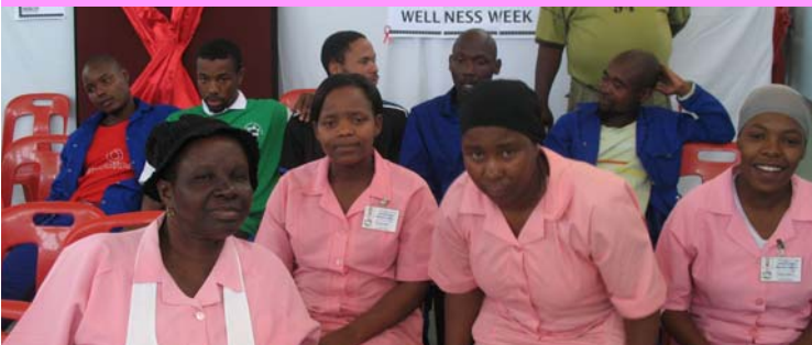
SOME PEOPLE HATES LIMELIGHT, SOME EVEN TRY TO RUN AWAY FROM CAMERA MAN, BY THE WAY THESE ARE SOME OF OUR STAFF MEMBERS WHO WERE WAITING TO HAVE THEIR VITAL SIGNS CHECKED