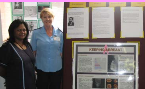
NORTHADALE HOSPITAL RADIOGRAPHERS TEAM SHOWING OFF THEIR STALL AS WELL DURING THE EMPLOYEE'S WELLNESS WEEK.