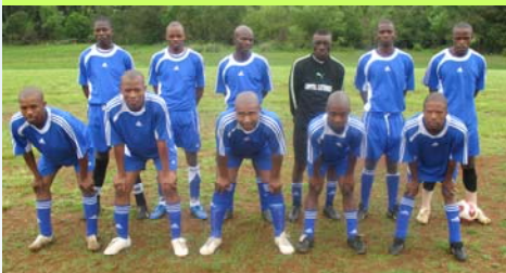
THE TEAM OF LECTURES,,, WE ARE WAITING FOR ABANYE