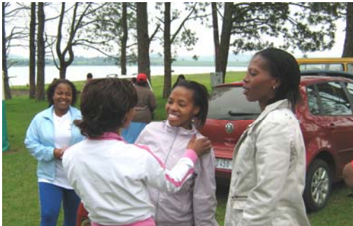
LONG TIME NO SEE !!!! AMA HUGS PHARMACY STAFF MEMBERS GREETING THE FELLOW STAFF MEMBER