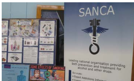
SANCA Information Display