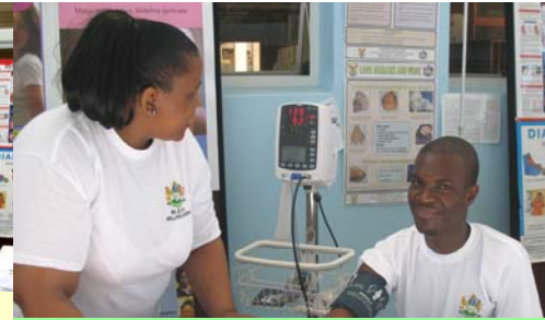
UYATHETHA BANDLA SHAME UMPHATHI, IPHEZULU I BP WE PRO