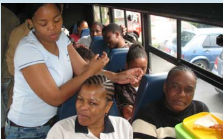
SIKA LE.....SOME KIDS CAN DANCE EVEN EBHASINI, ABANYE BEDLA UMPHAKO