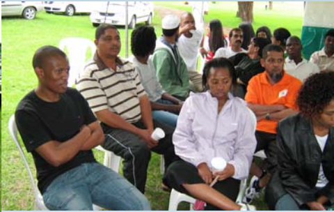
INTOBEKO ? I WONDER WHY THESE GUY WERE SO SERIOUS.