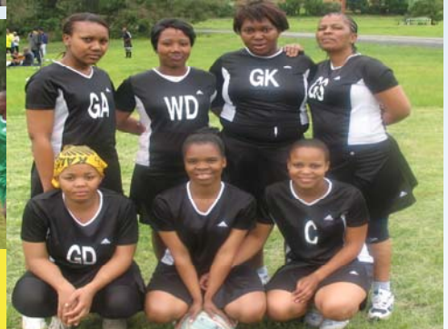
NORTHDALE HOSPITAL NETBALL TEAM