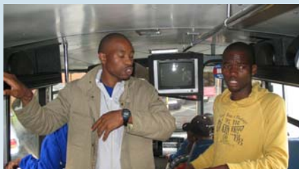
IF YOU WANT TO LAUGH COME AND ASK THIS GUYS TO HIT YOU WITH A JOKE OR 2