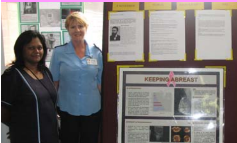
NORTHDALE HOSPITAL RADIOGRAPHERS TEAM SHOWING OFF THEIR STALL AS WELL DURING THE EMPLOYEE'S WELLNESS WEEK.