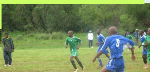
ISIKHATHI SE CLASS, NORTHDALE HOSPITAL TEACHING ST. APOLLINARIS HOW SOCCER IS PLAYED.