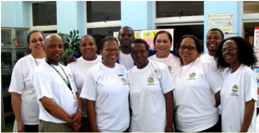
THE TEAM BEHIND THE SUCCESS OF THE EMPLOYEE'S WELLNESS WEEK