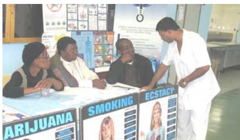
SANCA Crew helping out our Staff member on his questions.