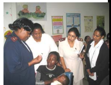
Information was shared before Vitamin A drops were given