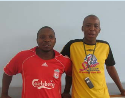
IT'S AMAZING WHAT OTHER DUDES CAN IF BEBONA I CAMERA

THANK YOU TO PORTSHEPSTONE WHO CAME AND TOOK THEIR CHANCES EKUGCINENI BASUTHA INDUKU NENYAMA,