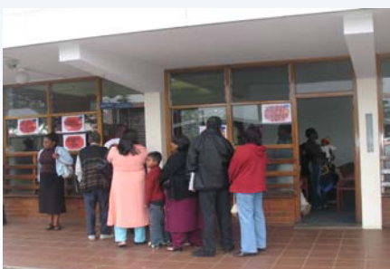
PATIENTS ON THE SORTING QUEUE AT OUR NEW TRIAGE AREA

HOW DOES IT OPERATE ? When a Person goes to our Triage/ Sorting area they