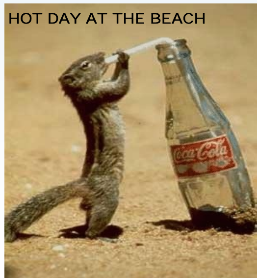
HOT DAY AT THE BEACH

What is the difference between God and a social worker? God doesn't pretend to be a social worker.