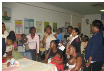
Wonk'muntu was interested and waiting for their turn, but omuntuza bona bebekhala beca-banga ukuthi kubuhlungu