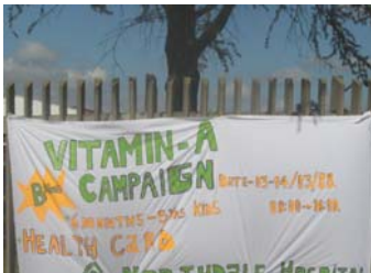
Talents were also displayed, I wonder who the guy who did this or it was done by the 6months to 5year olds ?