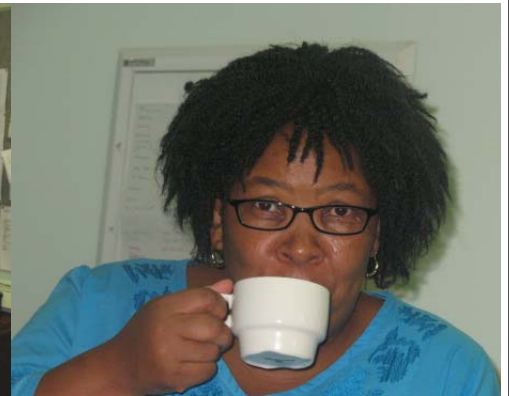
HEY UMUNTU USEBENZILE AT LEAST A CUP OF TEA WILL DO