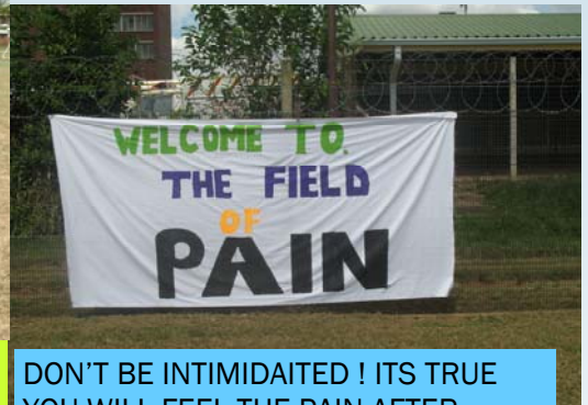
DON'T BE INTIMIDAITED ! ITS TRUE YOU WILL FEEL THE PAIN AFTER EVERY GAME YOU PLAY IN THIS FIELD

AKUDLALWE NGI-JAHE UKU DANSA NGIDLE U JUICE