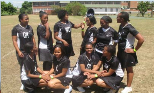
YIZO LEZI IZINTOKAZI EBEZIDALELA I PORTSHEPSTONE INKINGA ZIBAPHA ESIHLE ISIBHAXU LESI