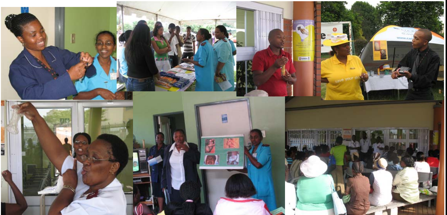
THIS IS HOW WE OBSERVED OUR S.T.I , HIV/AIDS THROUGH PUBLIC EDUCATION IN OUR HOSPITAL FACILITY AND THROUGH COMMUNITY OUTREACH