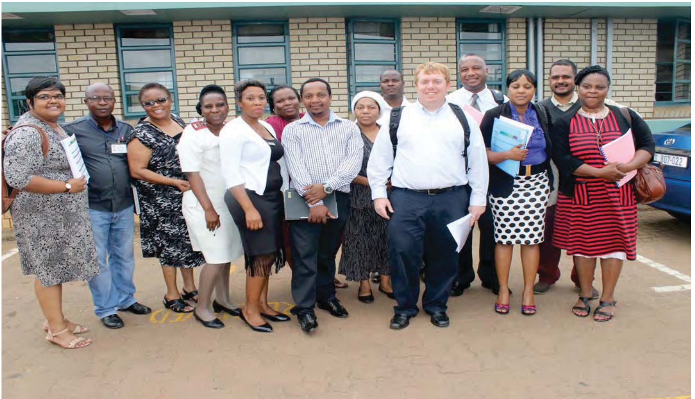
UMnyango Wezempilo. Departement van Gesondheid