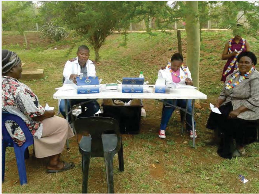
Senior citizen were checked for Diabetes and BP