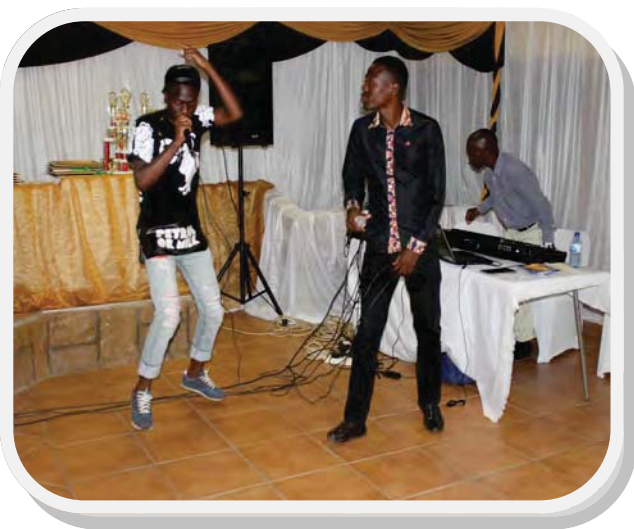
Youth friendly Ground