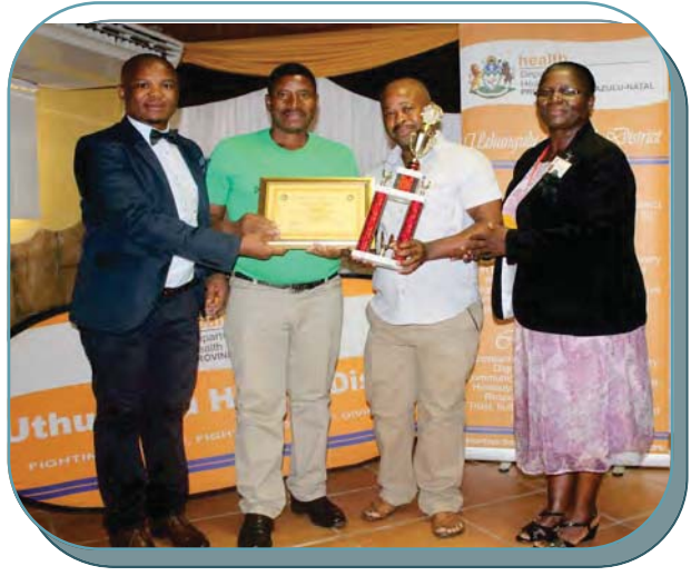
UMnyango Wezempilo. Departement van Gesondheid