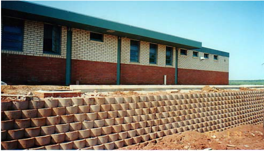
3. VIEW OF SOUTH ELEVATION