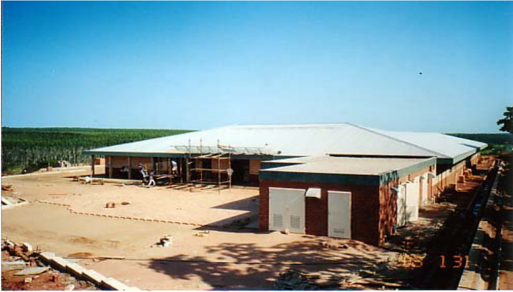
1. WHOLE VIEW OF SITE