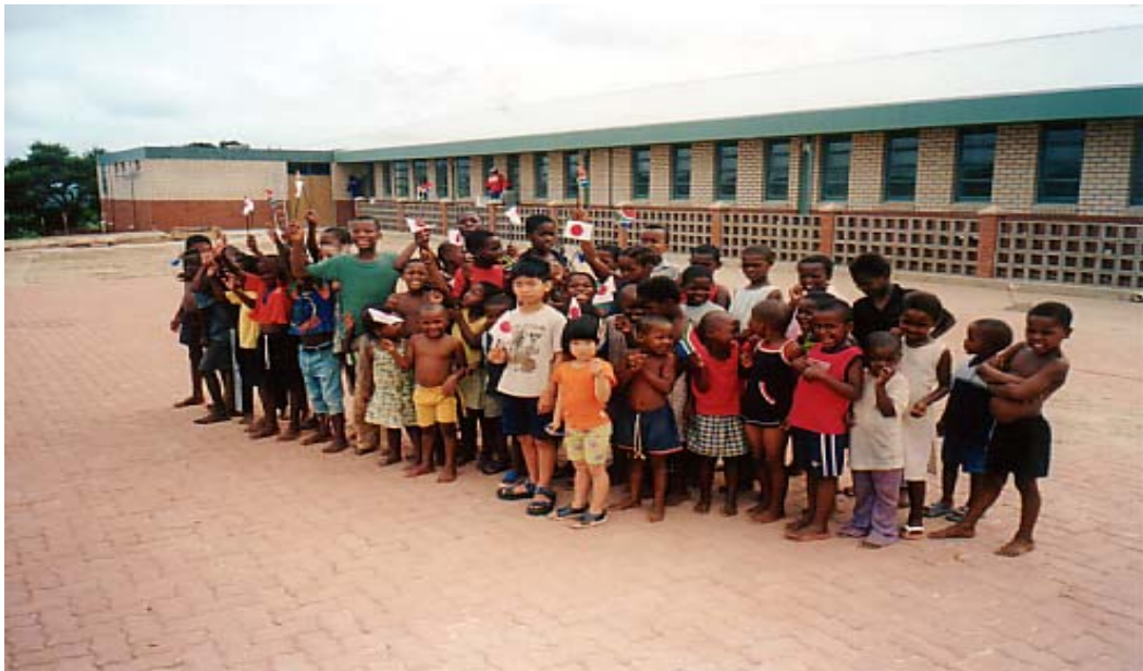
4. NSELENI CHILDREN VISIT ON SITE