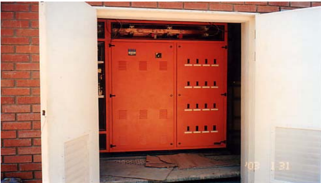
8. ELECTRICAL SUB STATION