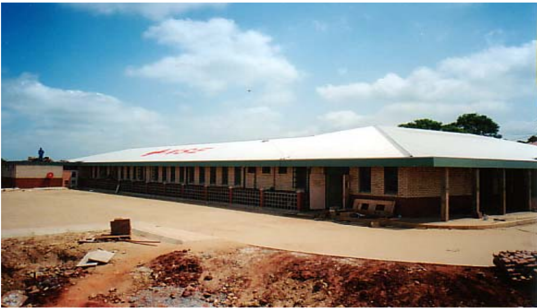
2 .WHOLE VIEW OF SITE