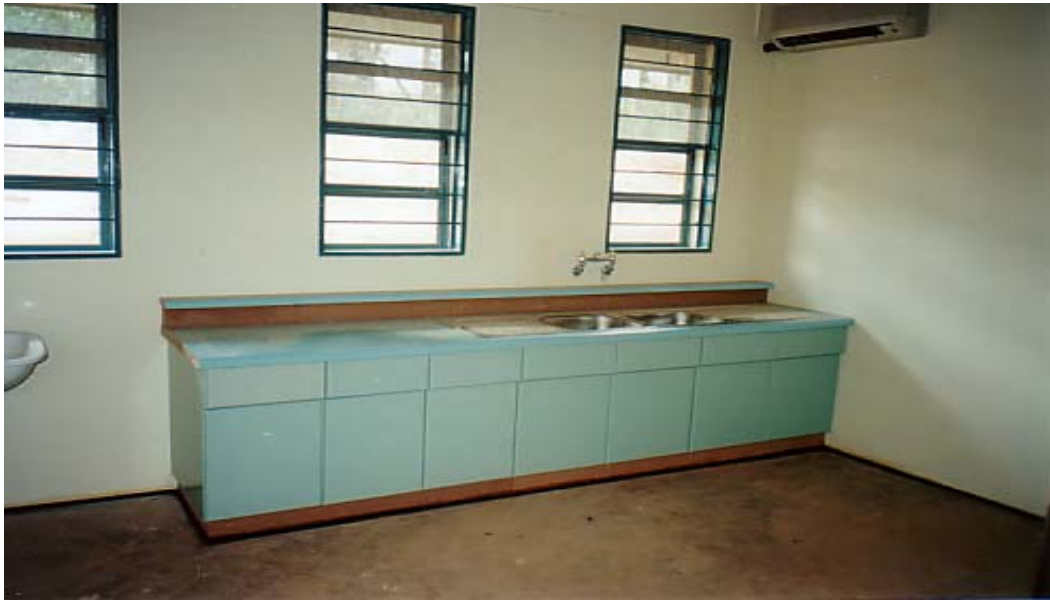
5.DOUBLE SINK COUNTER & WORK TOP