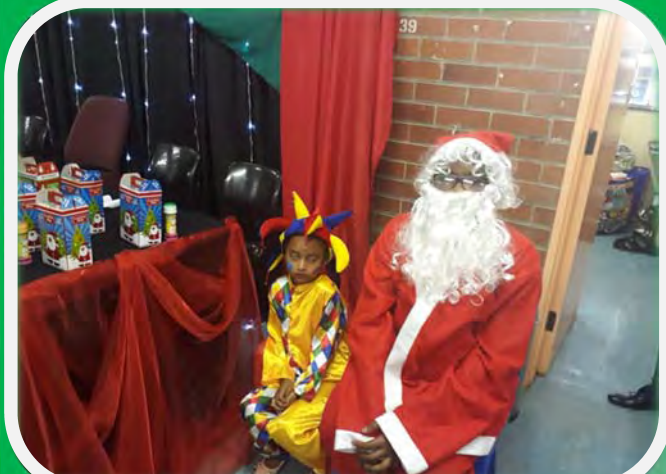
Father Christmas and the clown