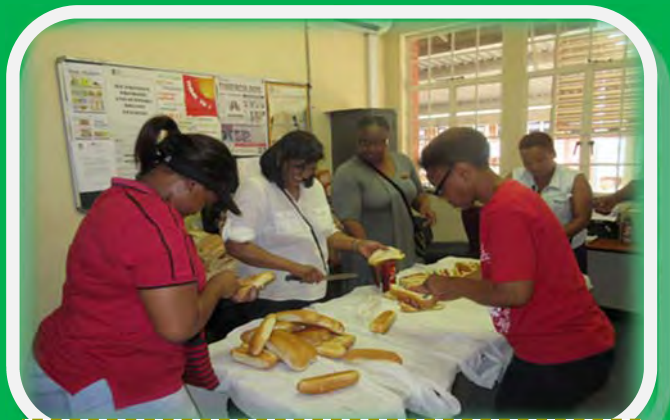
Staff preparing meals for the function