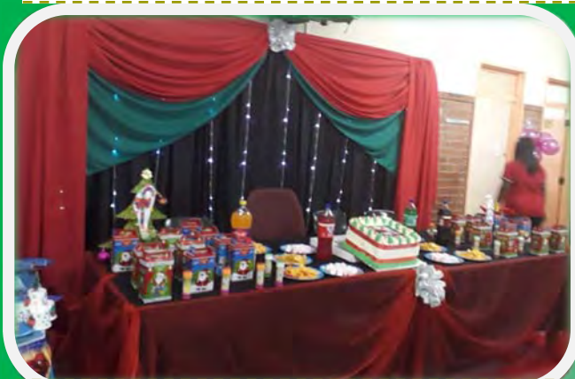
DÉCOR OF THE DAY