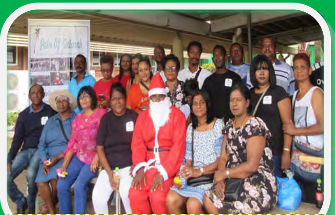
Staff, Palm of Deborah and other stakeholders