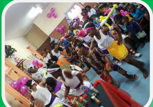
Zulu traditional dancers entertaining the crowd.