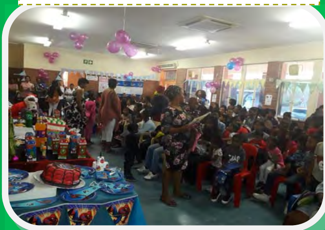
Children in baby clinic during the function