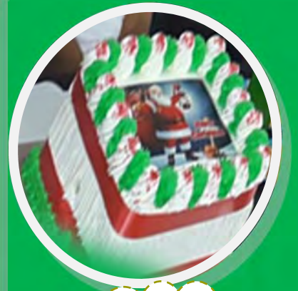
Baby clinic Christmas cake

On the 05th of December 2018, baby clinic hosted a Christmas party. The aim was for the children of Phoenix CHC to enjoy and celebrate an early Christmas party together with the staff .