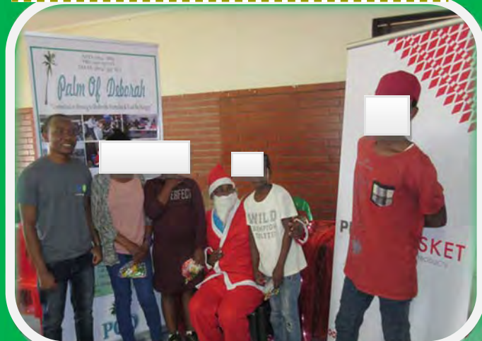
Children receiving gifts from Father Christmas