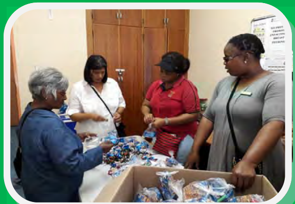
Staff seen preparing gifts for the children