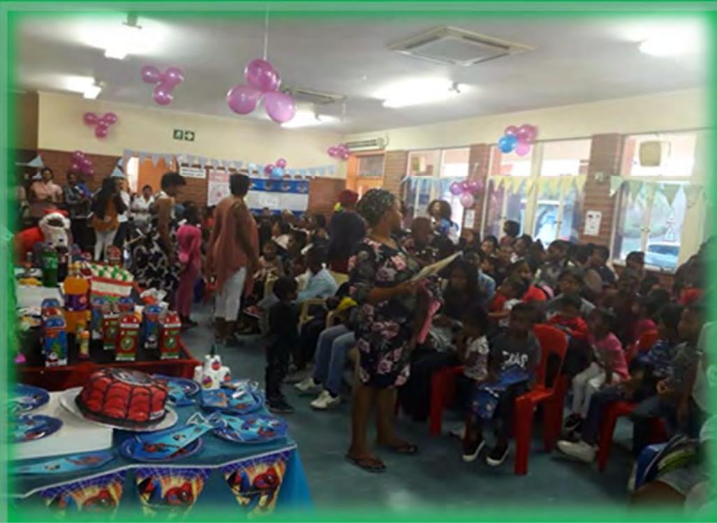
Excited children in baby clinic during the function