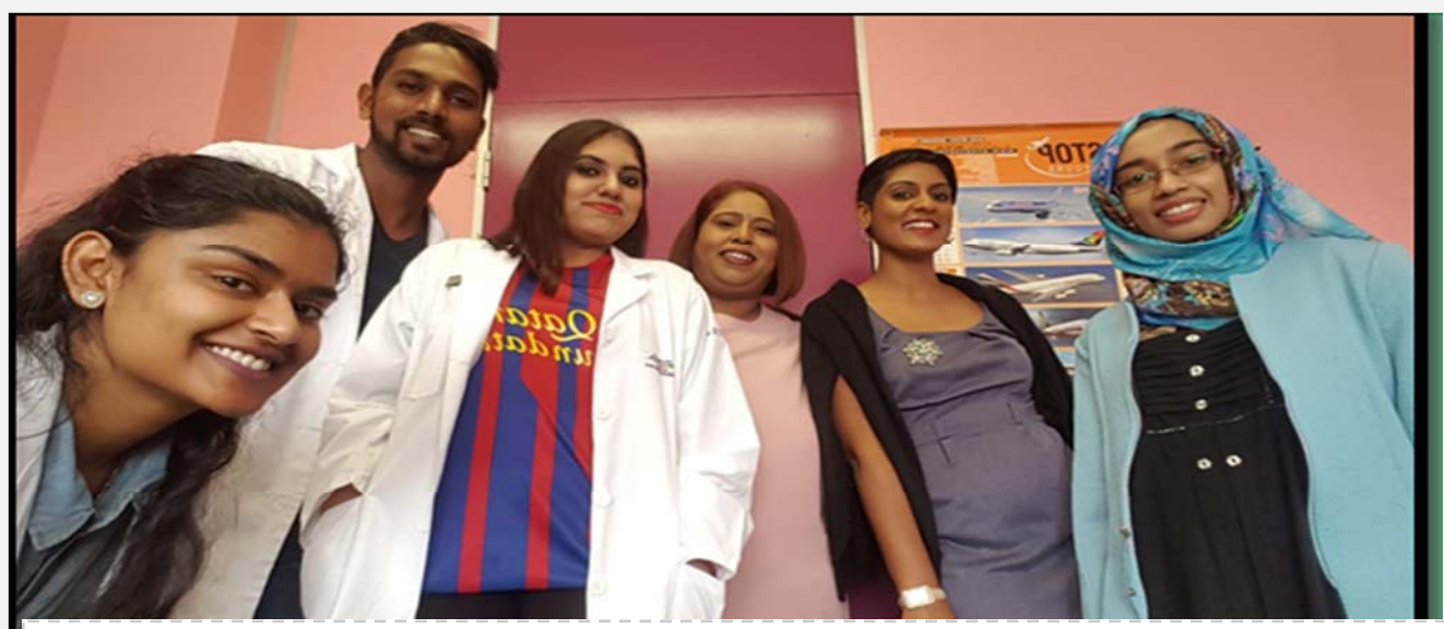
Phoenix CHC and Mental Health staff.