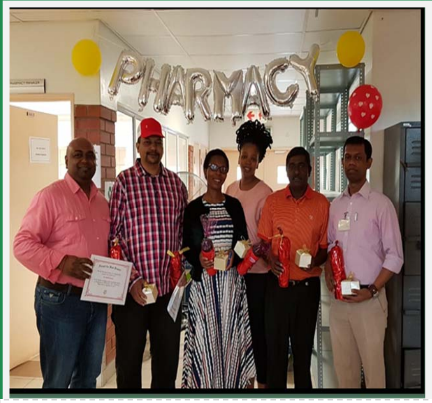
Team Bipolar pictured with their prizes after finishing first in the staff quiz.

Pharmacy week 2019 at Phoenix Community Health Care centre culminated with a more light-hearted and jovial atmosphere with the winning team of the daily quiz competitions finally being announced.