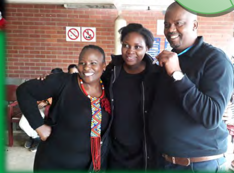
Fifth Place safety ,IPC and Waste Management.