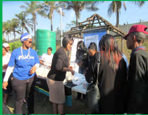
Akeso staff serving patients

Other stakeholders that also joined us was Umhlanga Hospital –Akeso and Sportsmen Warehouse who provided sandwiches and juices to patients. We would also like to thank them in using their 67 minutes Mandela Day in conjunction with Phoenix Community Health Centre.