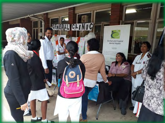
Mental health department