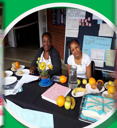
Card Office department