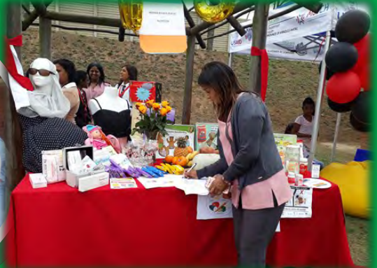
Mother & Child Health and Nutrition