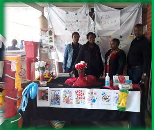
IPC, Health and Safety