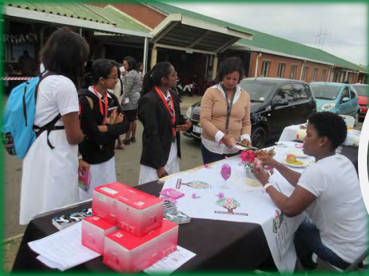
CCG's and Social Workers department