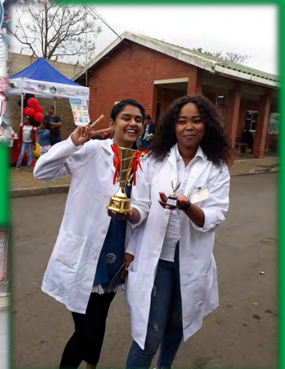
3rd place Pharmacy.