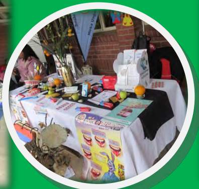
Dental department Decor