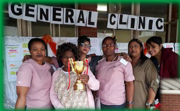
2nd place General Clinic.