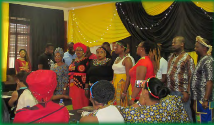
Staff choir entertaining the audience