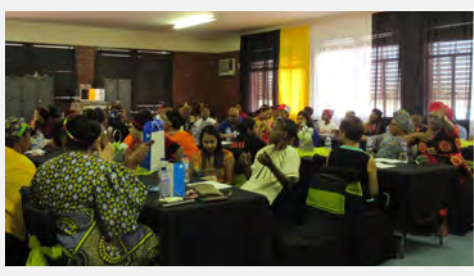
Heritage Day Celebration