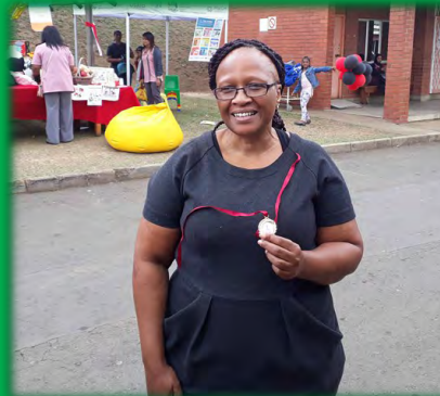
Forth place Dental department.

FIGHTING DISEASE, FIGHTING POVERTY, GIVING HOPE