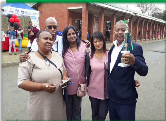
1st place baby clinic ,nutrition and family planning.