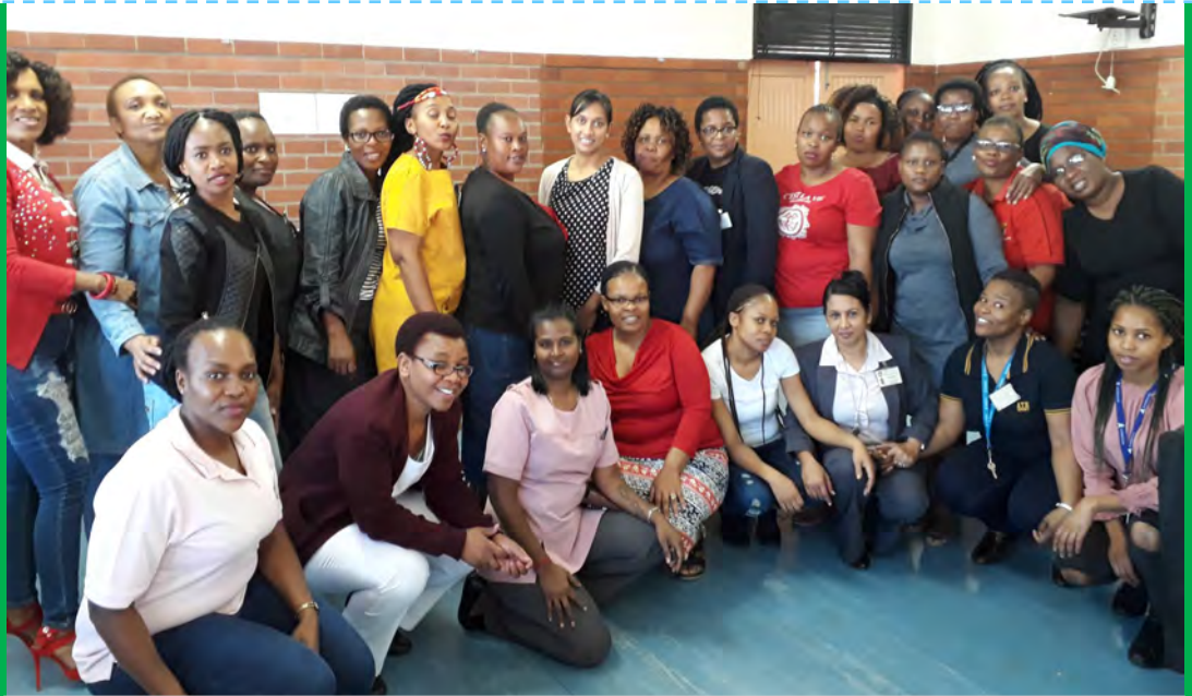
PCHC Women's' Forums