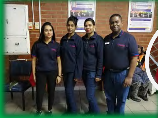
Sportsmen Warehouse staff