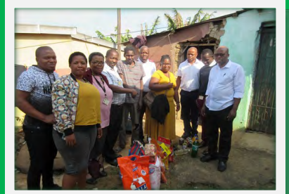
Mandela Day (67 minutes) and breast feeding awareness