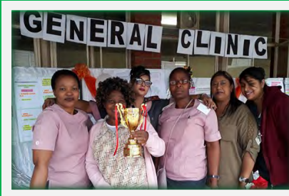
Open day celebration