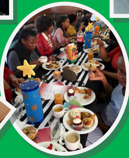
Staff enjoying their meals