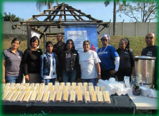
UMhlanga Hospital staff -Akeso