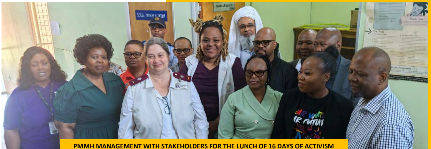
PMMH MANAGEMENT WITH STAKEHOLDERS FOR THE LUNCH OF 16 DAYS OF ACTIVISM

The community benefit on the professional service that is rendered from the TCC. The TCC deals with high levels of Gender Based Violence (GBV) specifically rape, domestic violence. As the survivor walks through the door, the Site Coordinator welcomes them and orientate them on our services. The TCC consists of Doctors and nurses who will do forensic medical examination, medical assessments so that the survivor can be able to get medical treatment like Post Exposure Prophylaxis (PEP) where necessary. The TCC has sensitized and trained Police Officers who will take their statements and ensure proper chain of evidence is maintained from doctors to the detectives who work with sexual offences matters.