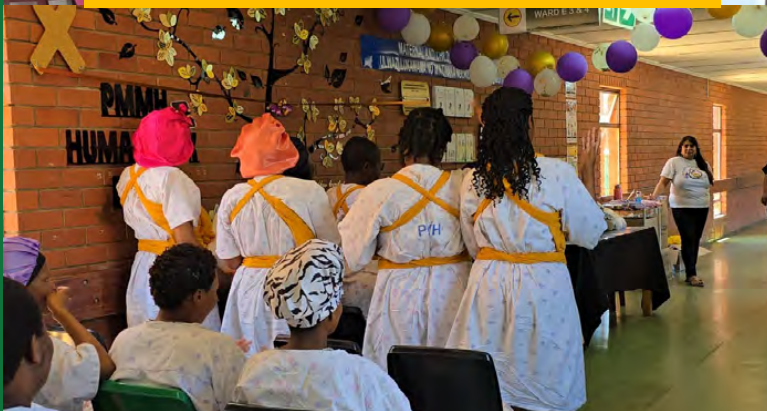
PMMH –MILK-BANK LAUNCH Pg11.