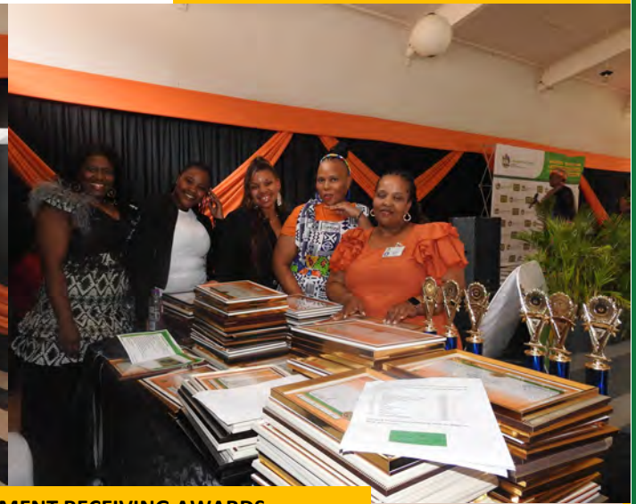
PMMH STAFF AND MANGEMENT RECEIVING AWARDS