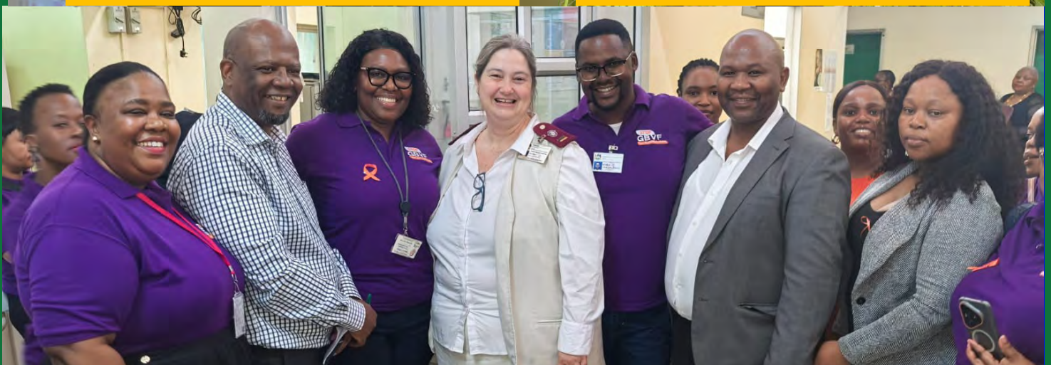
PMMH TCC STAKEHOLDER ENGAGEMENT Pg18.