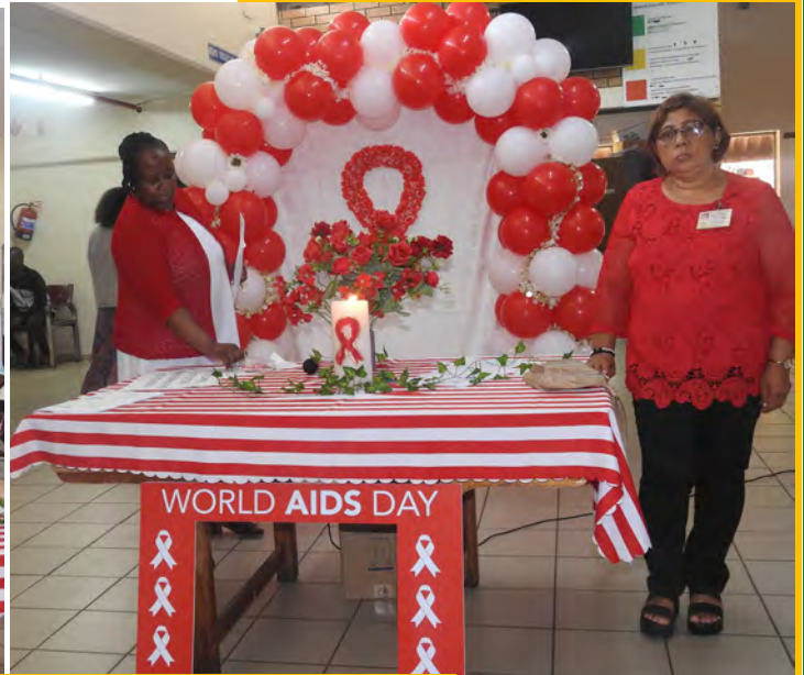
MOPD MANGEMENT AND STAFF AT THE EVENT