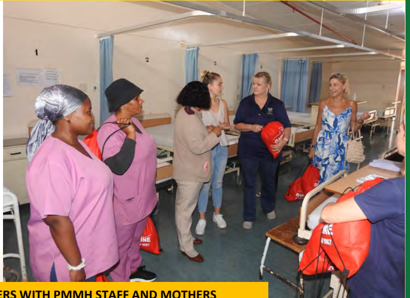
BABYLINE MEMBERS WITH PMMH STAFF AND MOTHERS

PMMH recently received a generous donation from Babyline, aimed at supporting mothers and babies within the hospital. The donation included essential items to assist with maternal and baby care, providing comfort and relief to families during a critical time.