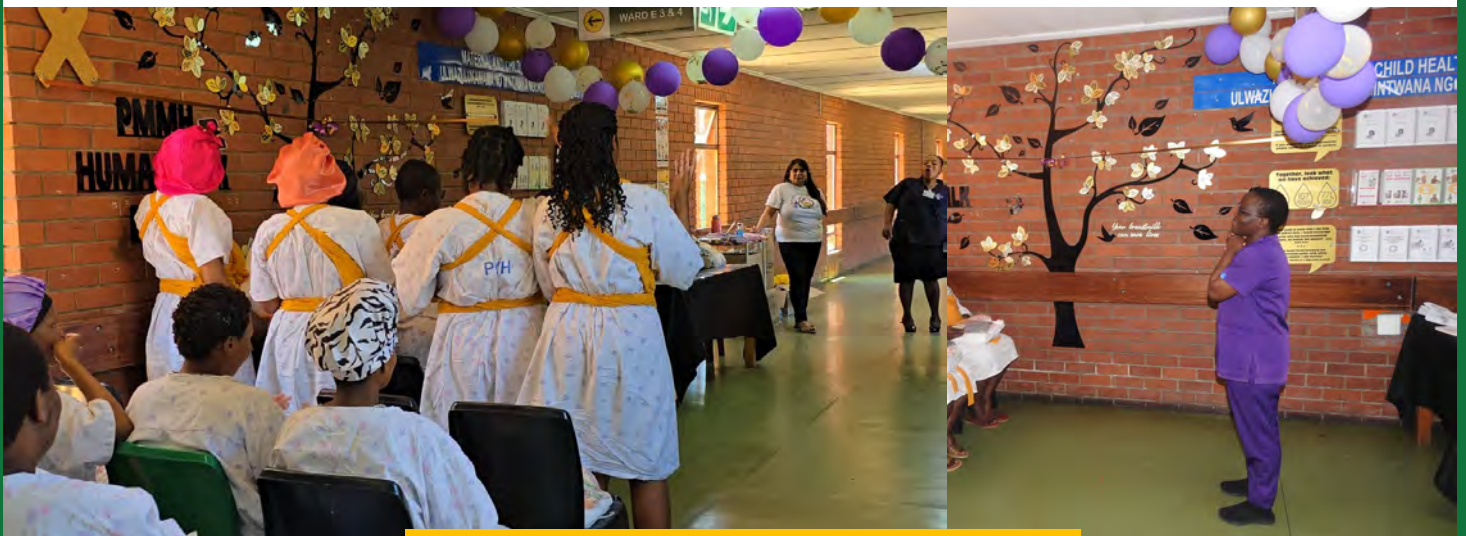
STAFF EDUCATING MOTHERS ON HUMAN MILK BANK