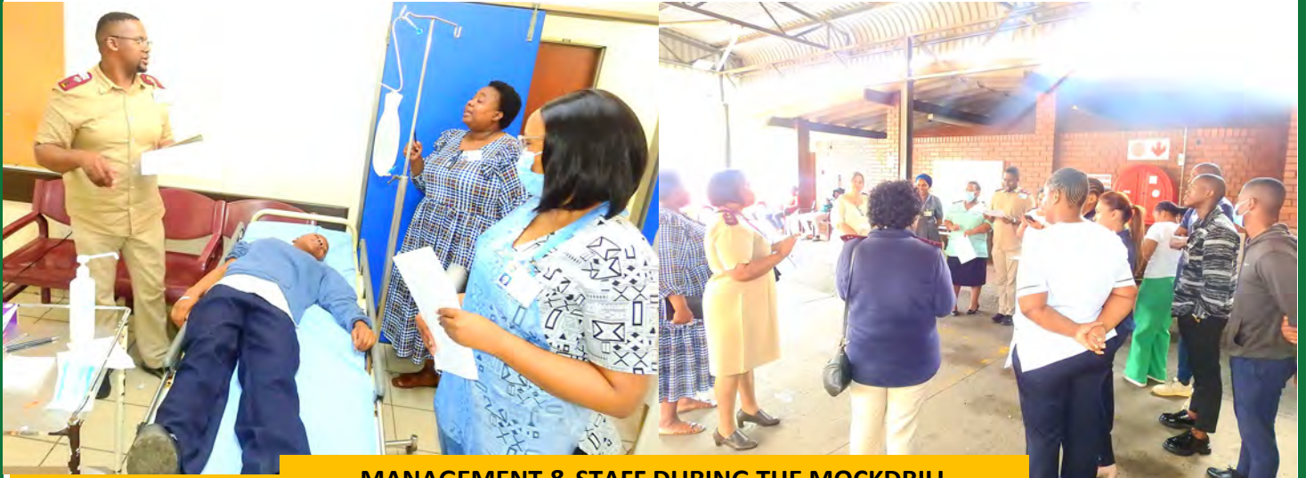
MANAGEMENT & STAFF DURING THE MOCKDRILL

MOPD conducted a mock drill to assess preparedness and improve response to emergencies. The exercise tested teamwork, communication, and adherence to clinical protocols among multidisciplinary staff.