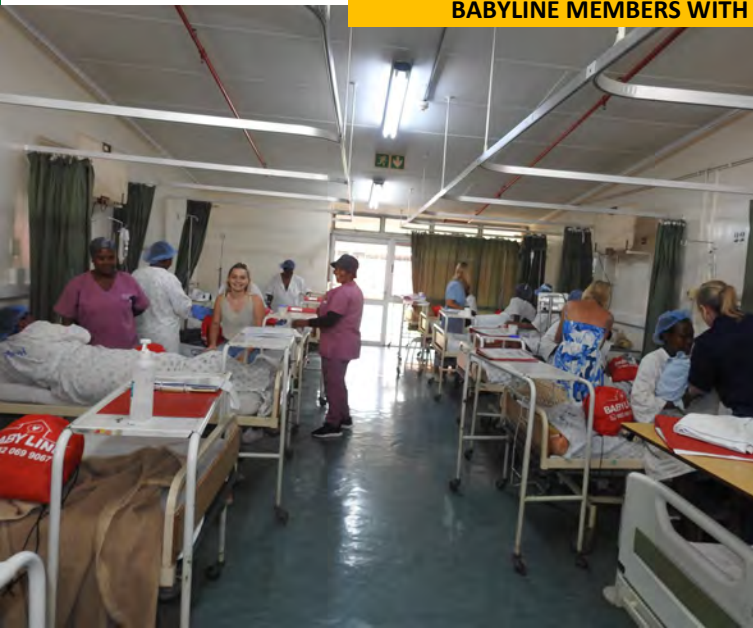
BABYLINE MEMBERS WITH PMMH STAFF AND MOTHERS

PMMH acknowledges BabyLine for their kindness and partnership, which continues to make a positive impact on the lives of mothers and babies in the community.