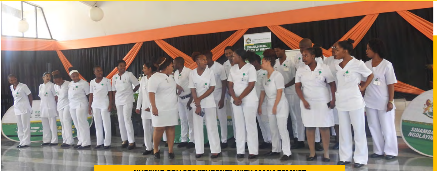
NURSING COLLEGE STUDENTS WITH MANAGEMENT