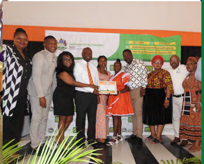
PMMH –OHSC EXCELLENCE AWARDS Pg14.