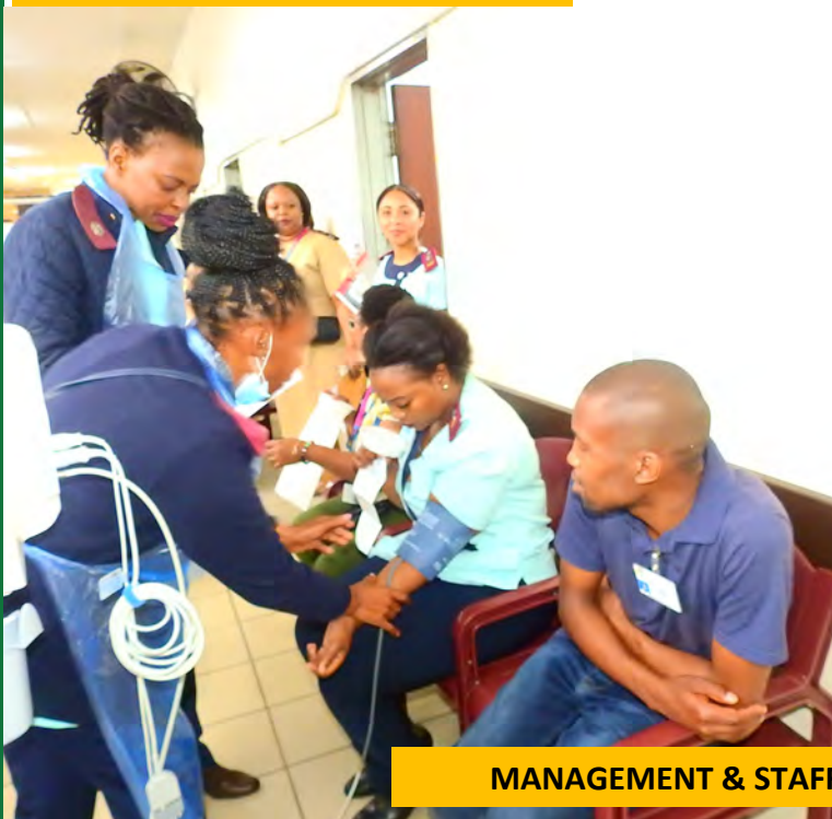
MANAGEMENT & STAFF DURING THE MOCKDRILL

The drill highlighted strengths and identified areas for improvement, reinforcing the importance of regular simulations in ensuring patient safety. Following the exercise, a debriefing session was held to review performance, discuss challenges encountered, and recommend areas for improvement.