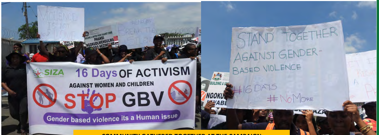
COMMUNITY GATHERED TOGETHER AT THE CAMPAIGN

The event reinforced the message that ending GBV requires commitment, collaboration and continued advocacy from all sectors of society.