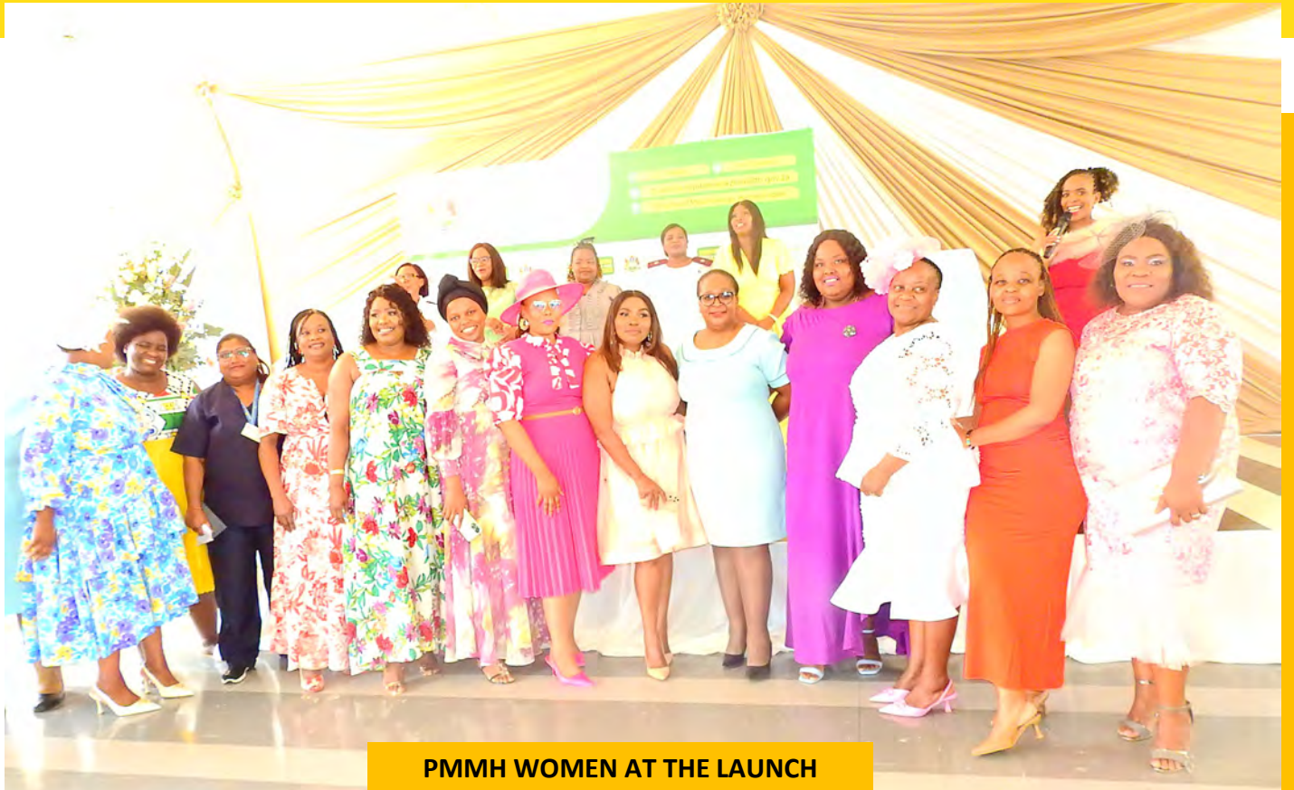
PMMH WOMEN AT THE LAUNCH

On the 27th of August 2025 PMMH Womens Forum successfully launched the Women's Forum to create a safe and inclusive platform for women. The forum aims to promote empowerment, leadership and mutual support among women. Key focus areas include personal development, workplace wellness, gender equality and open dialogue. The launch encouraged collaboration, unity and active participation to strengthen women's voices within the institution. The women's forum will serve as a space for collaboration, mentorship and advocacy, enabling women to share ideas and address challenges collectively. It also encourages active participation and aims to strengthen women's voices in decision-making processes across the institution.