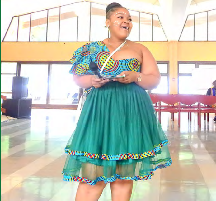
MANAGEMENT AND STAFF AT THE HERITAGE DAY EVENT

Traditional attire, music, and dance added colour and excitement to the celebration. A highlight of the event was an enjoyable play performed by the students, which entertained the audience while showcasing cultural values, history and shared identity. The celebration provided an opportunity for cultural expression, learning and appreciation of diversity. The nursing college continues to promote inclusivity and cultural awareness through such meaningful events.