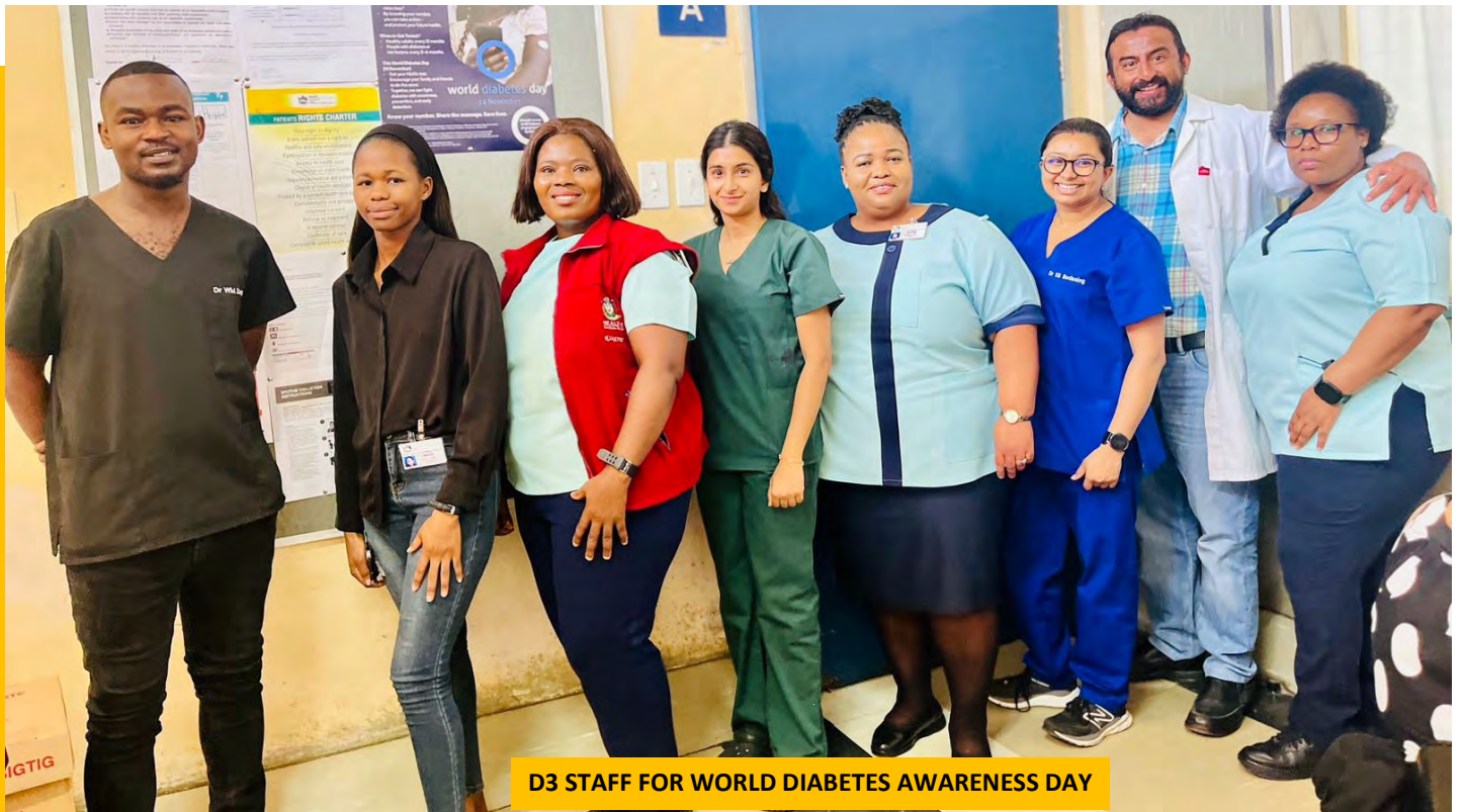
D3 STAFF FOR WORLD DIABETES AWARENESS DAY

On the 14th of November 2025 Chronic Clinic / D3 came together to recognize World Diabetes Day, a global initiative to raise awareness about diabetes, its impact, and the importance of prevention and management.