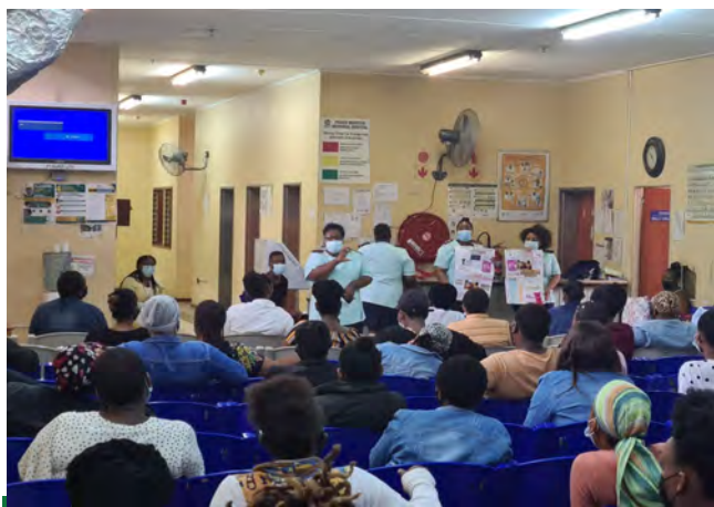
Picture Above : ANC & GOPD staff celebrating World Contraception Day