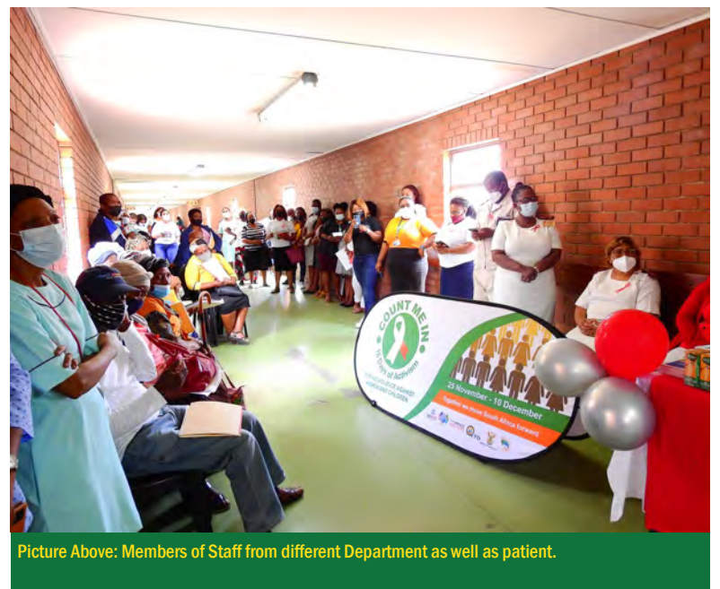
Picture Above: Members of Staff from different Department as well as patient.