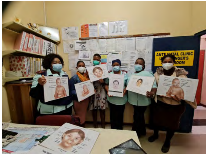
Picture Above: ANC staff members celebrating Fatal Alcohol Syndrome Awareness Day