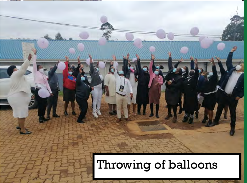
Throwing of balloons