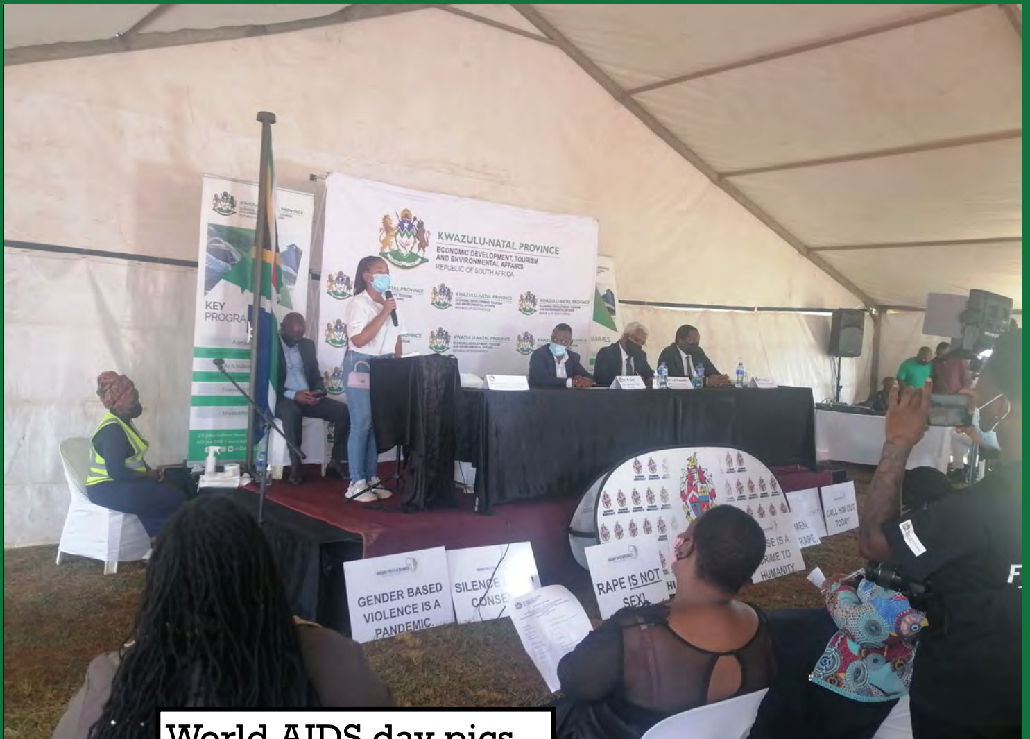
World AIDS day pics