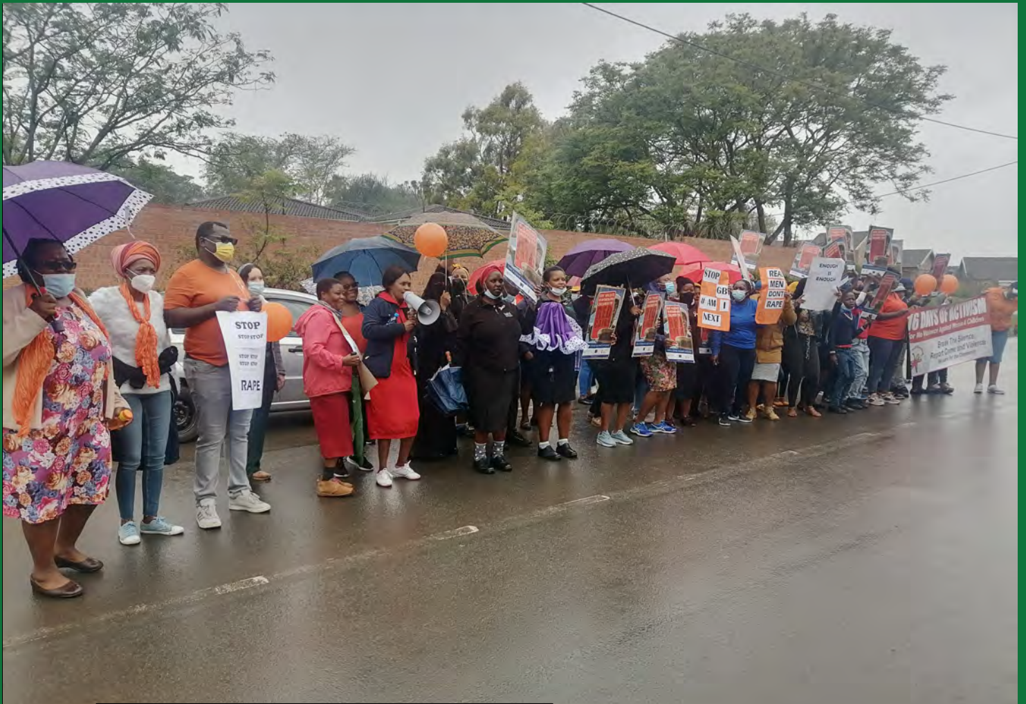
16 day of activism pics