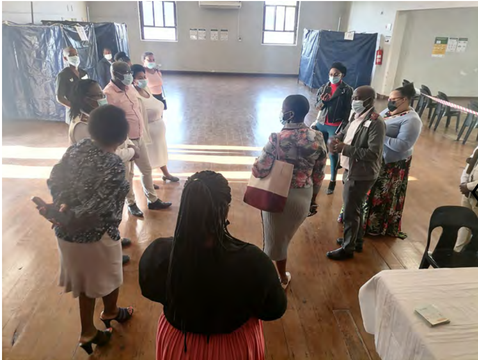
MEMBERS ALSO VISITED VACCINATION SITE.

On the 25 August 2021, Richmond was visited by the KZN Legislators portfolio committee for the assessment and check the facility readiness in fighting COVID-19 pandemic. Representatives from KZN Legislature was Honourable MPP Zungu and Honourable OB Kunene. Honourable members were satisfied with all the work done by Richmond and promised to report back in Legislature about such good practises they witnessed in this facility