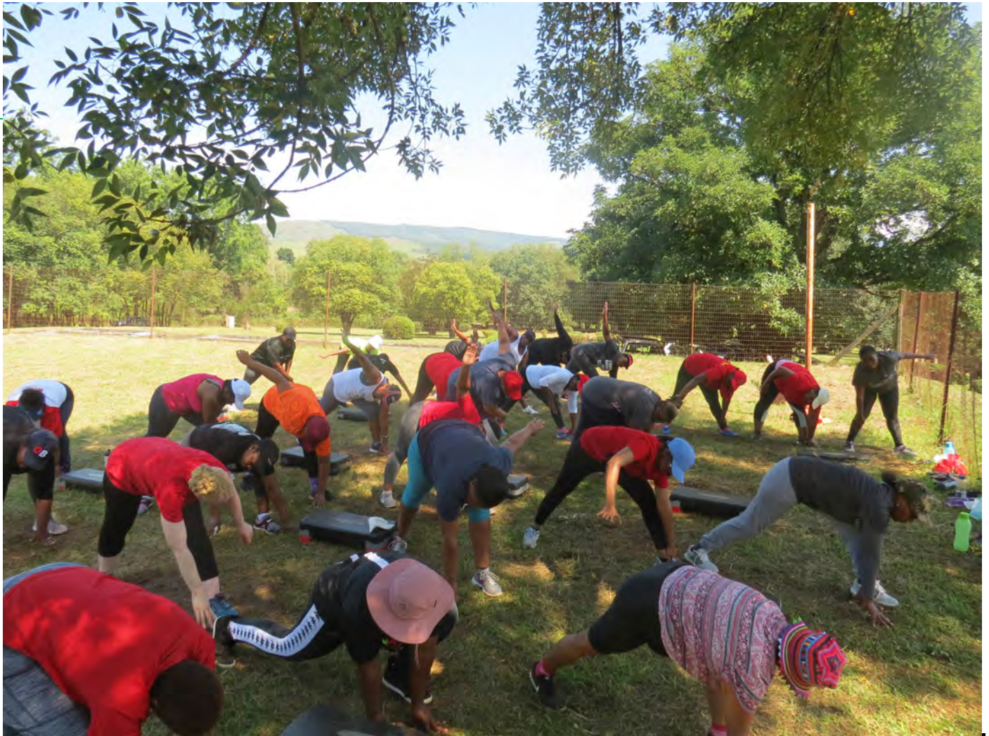
RICHMOND STAFF PARTICIPATING IN THE HEALTH&WELLNESS DAY